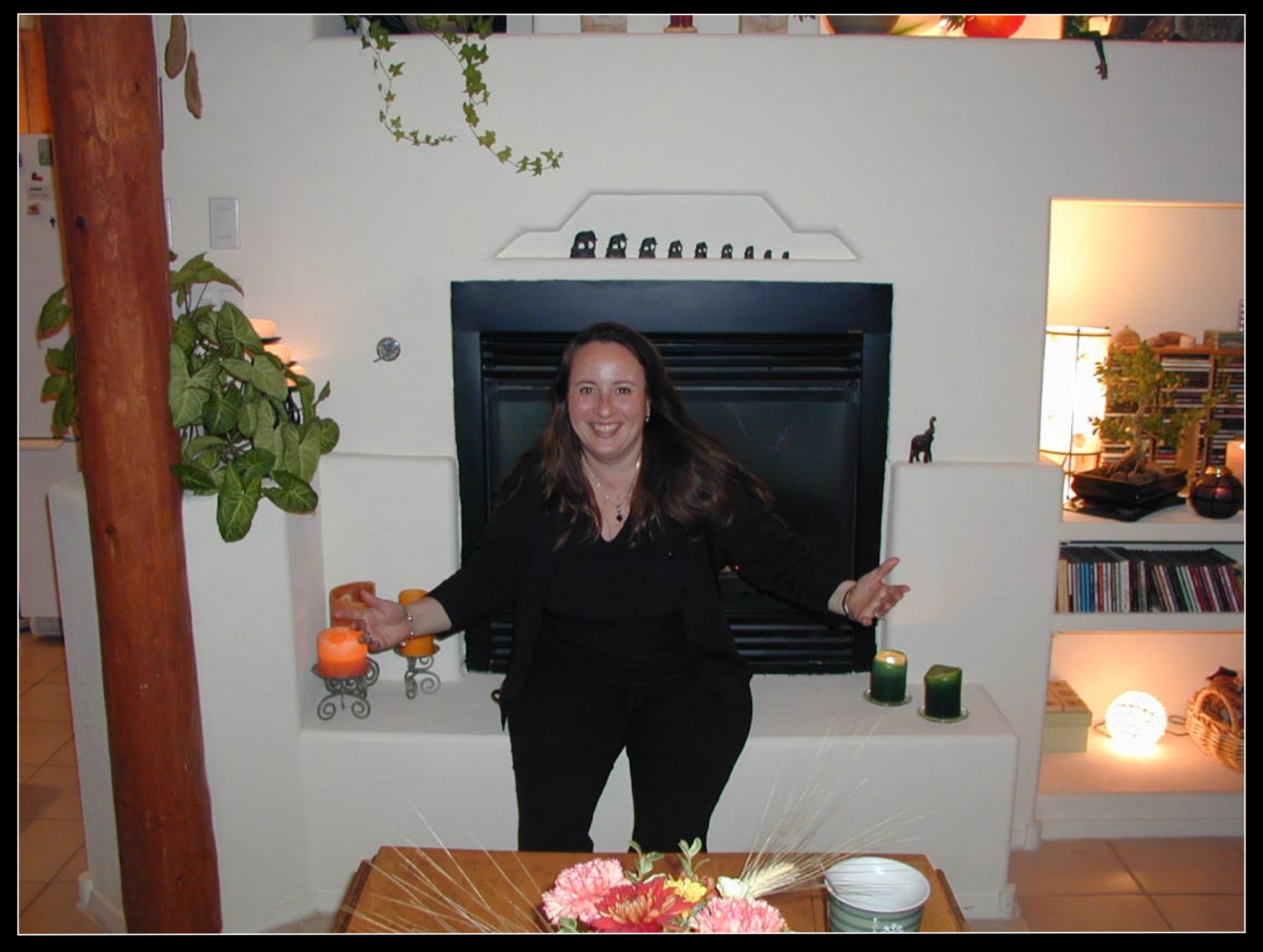
What are you doing?!