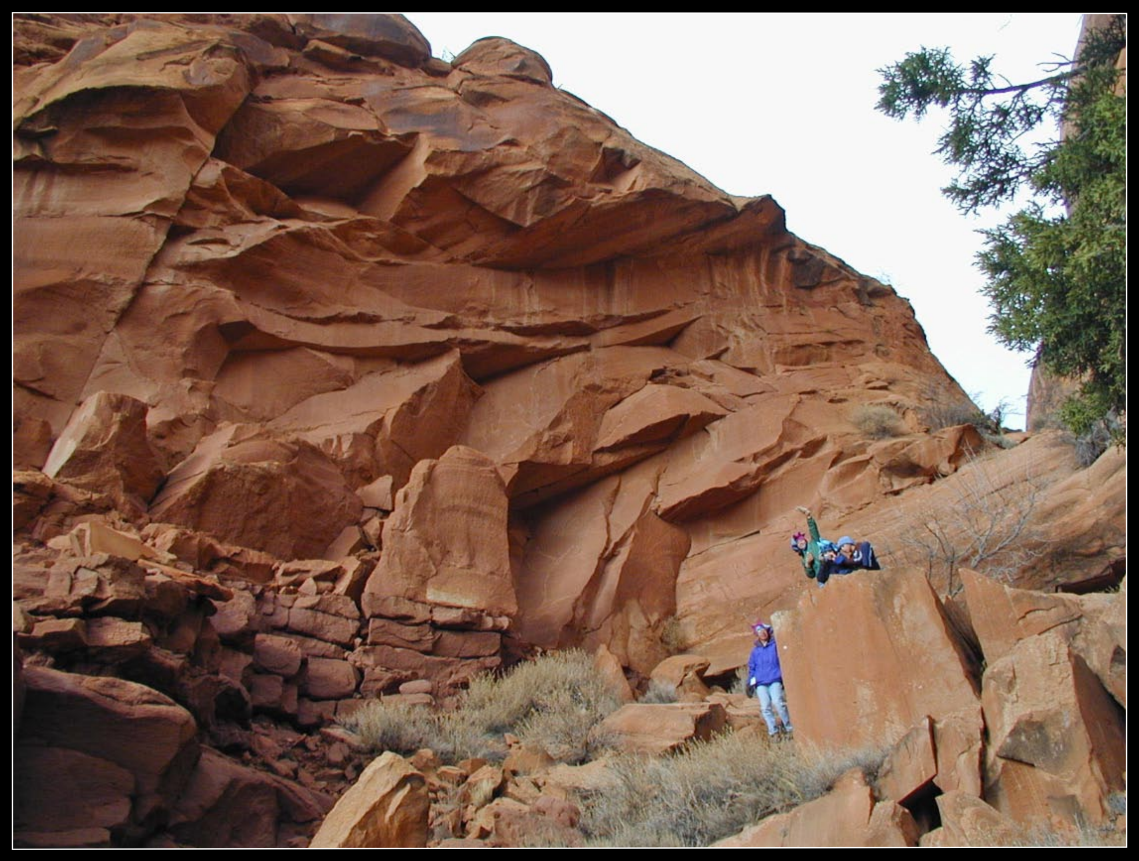
The end of the canyon