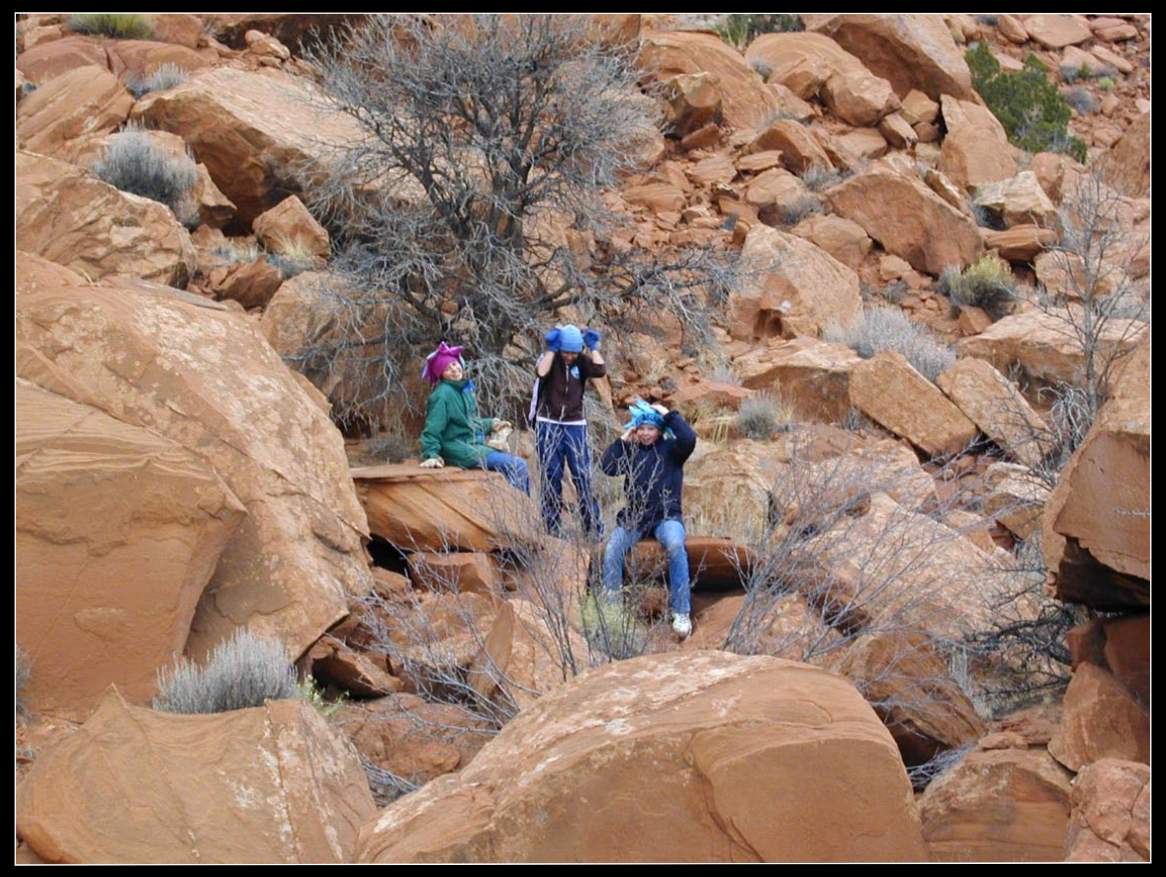
Hiking in Abiquiu