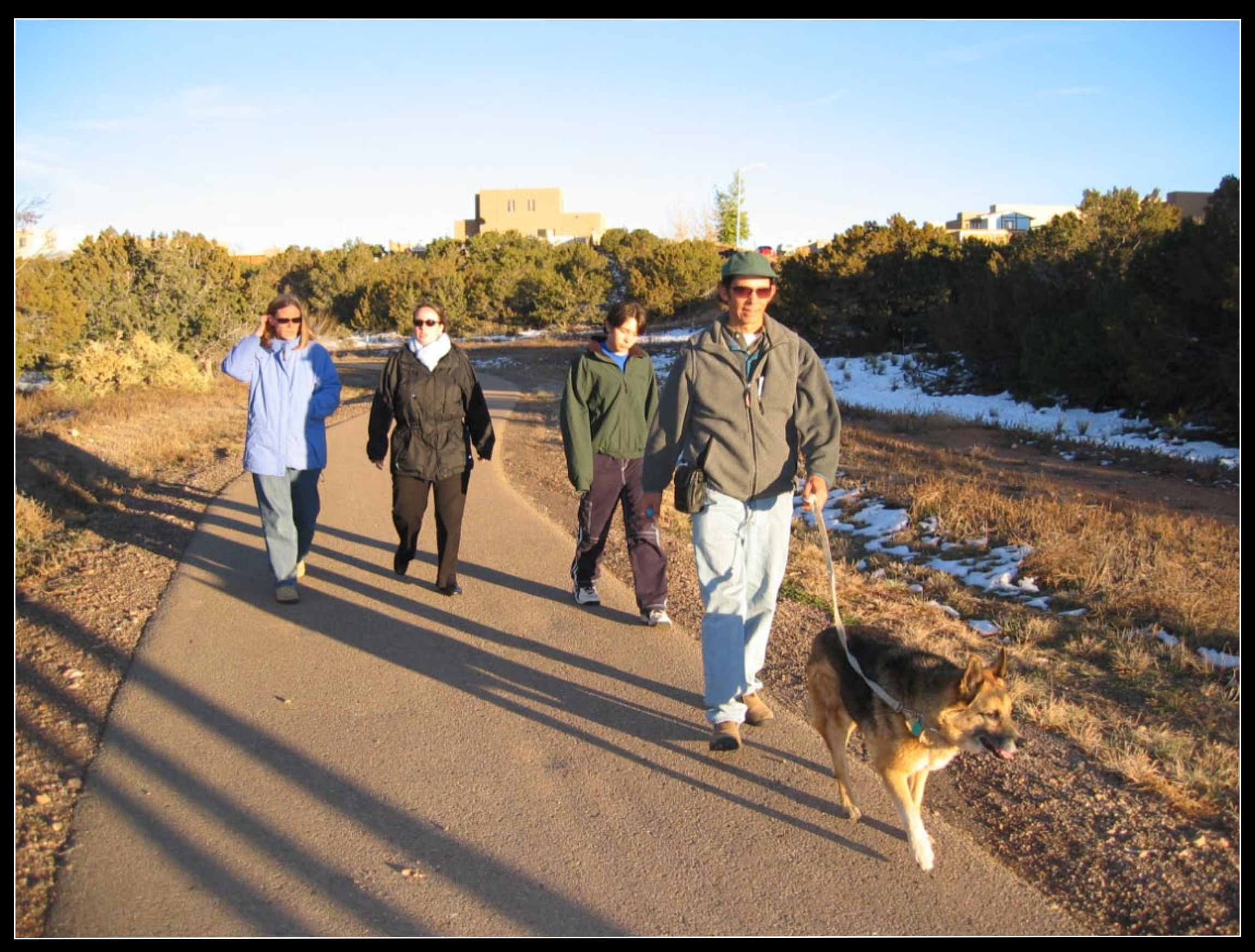
Out for a walk in the arroyo after dinner.