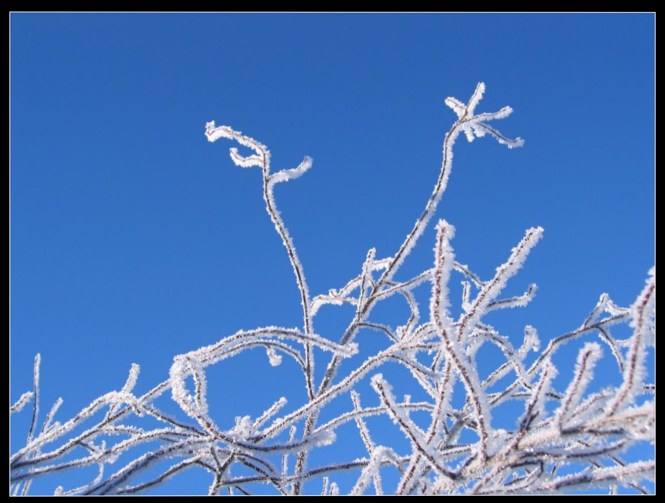
A couple of days after we got back we had cold frost.