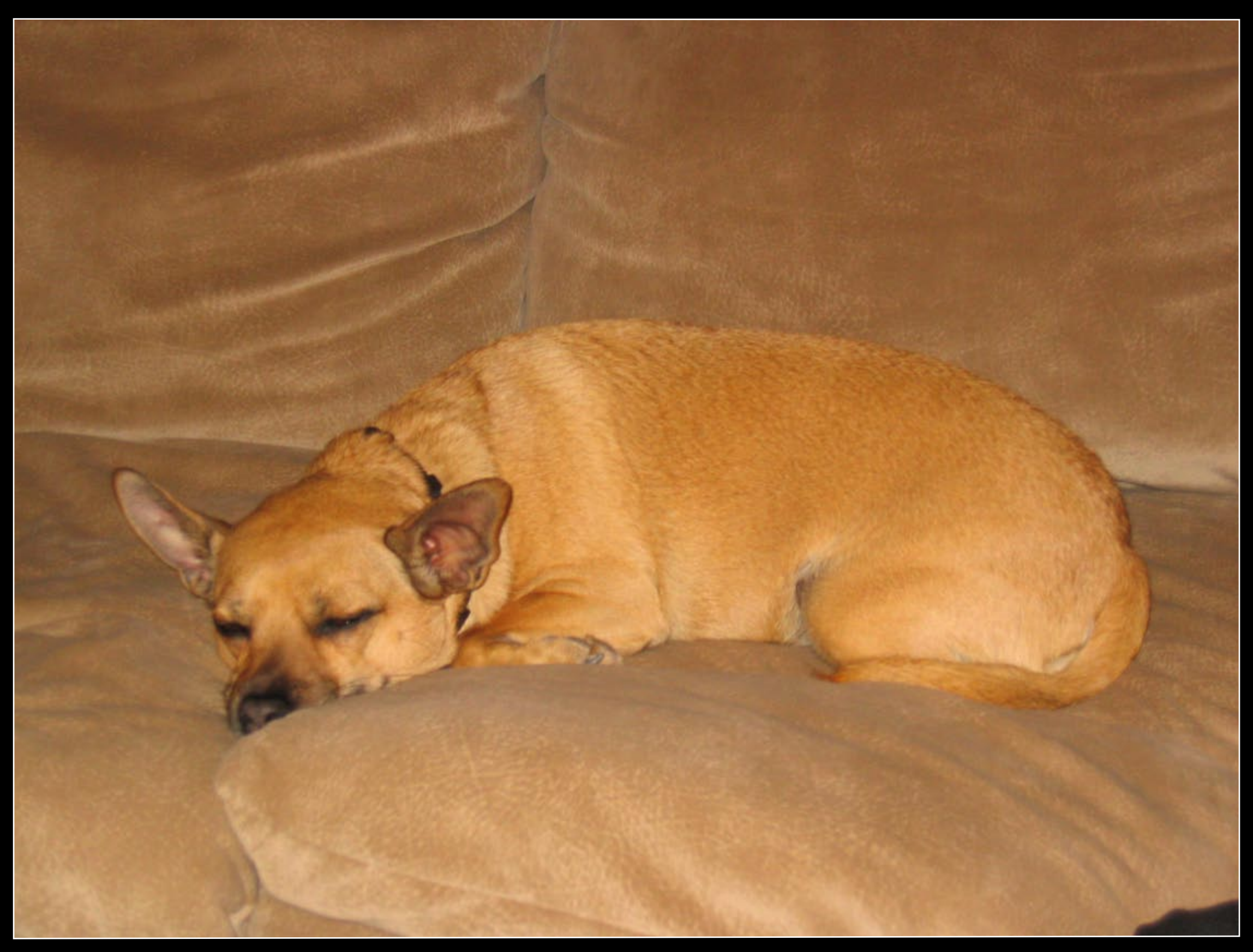
Rico from Puerto Rico