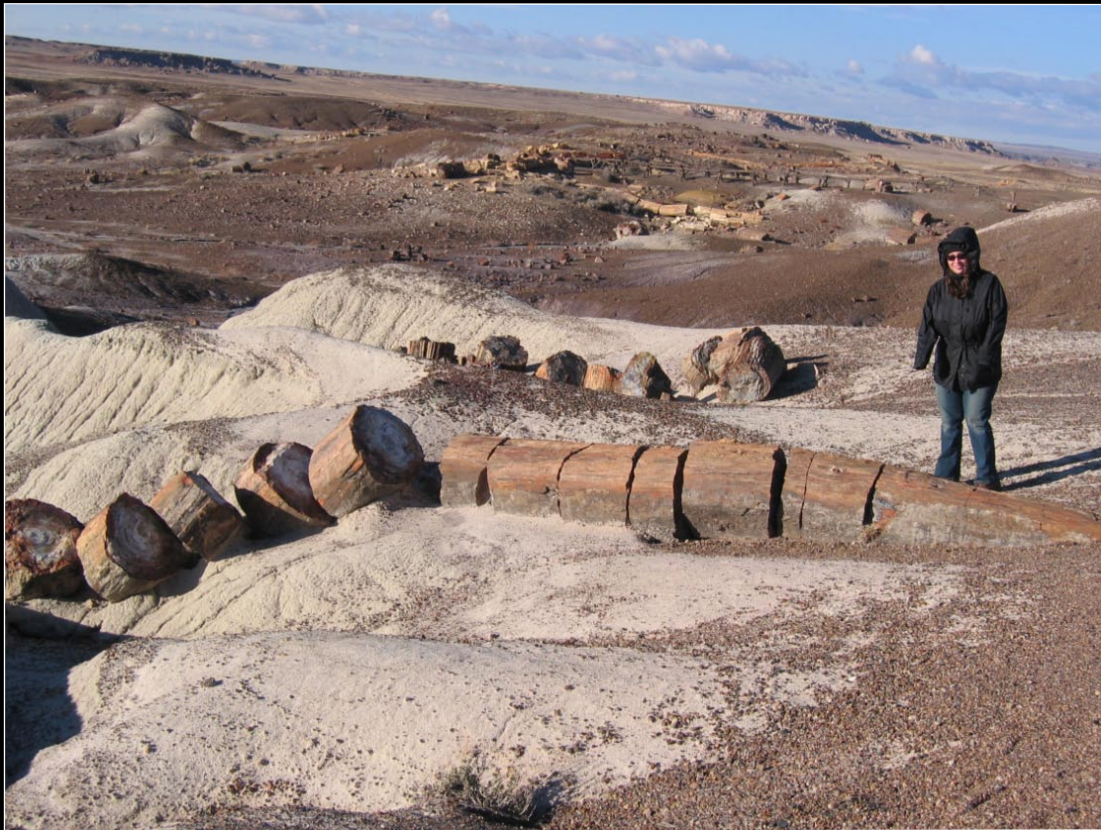
Triassic wood. That's about 225 million years old.