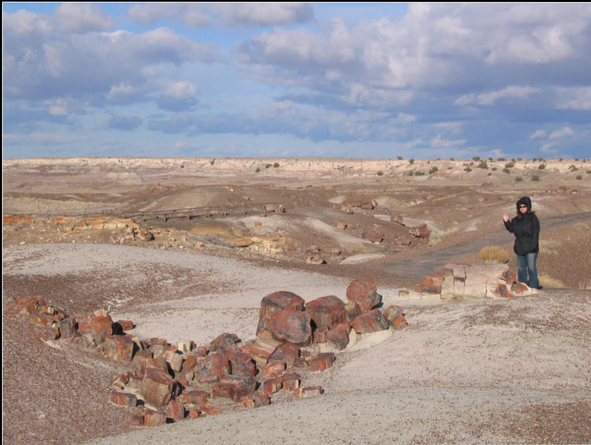
Whole lotta petrified wood.