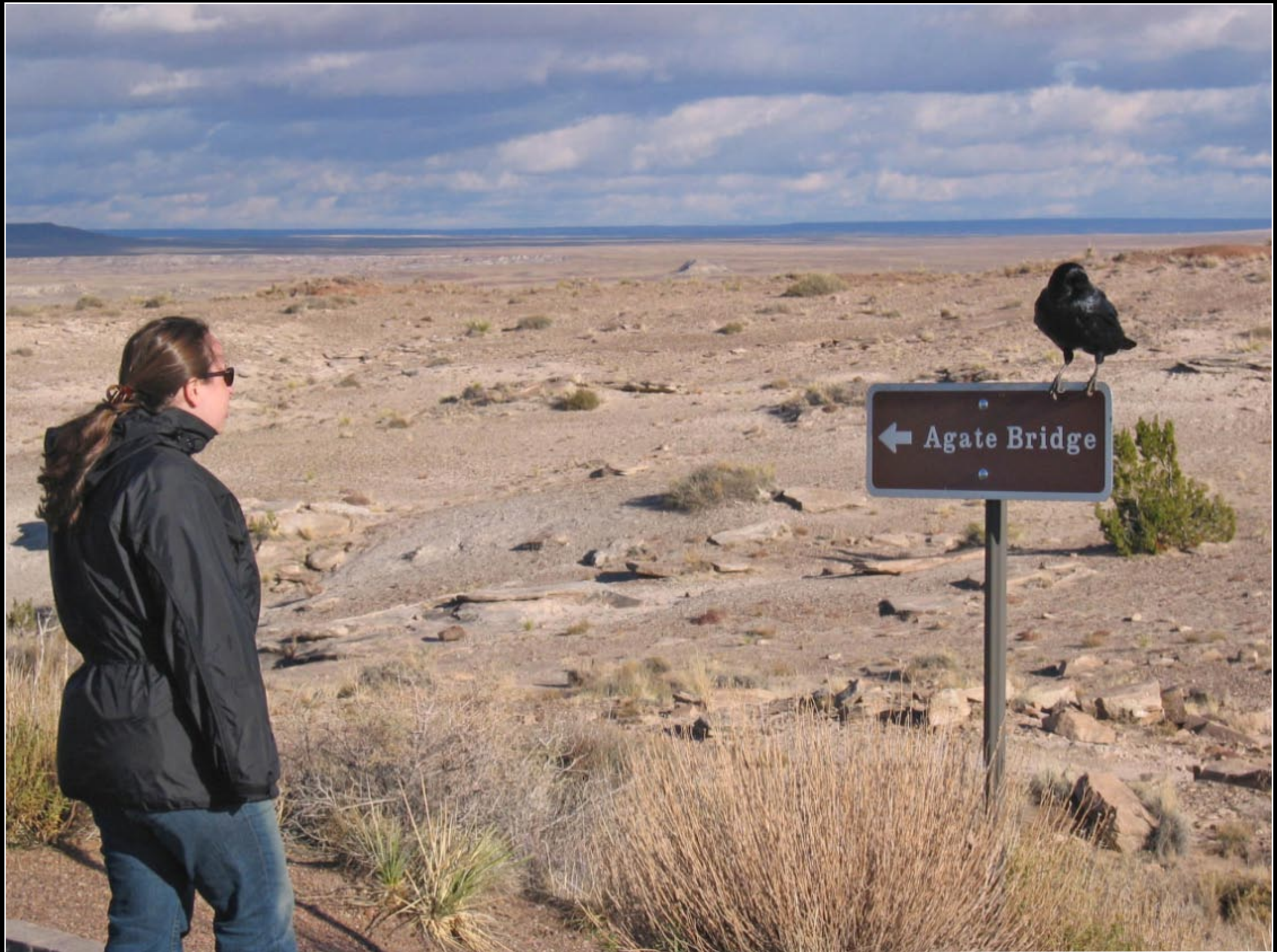
Petrified Forest and Painted Desert. Lots of ravens.