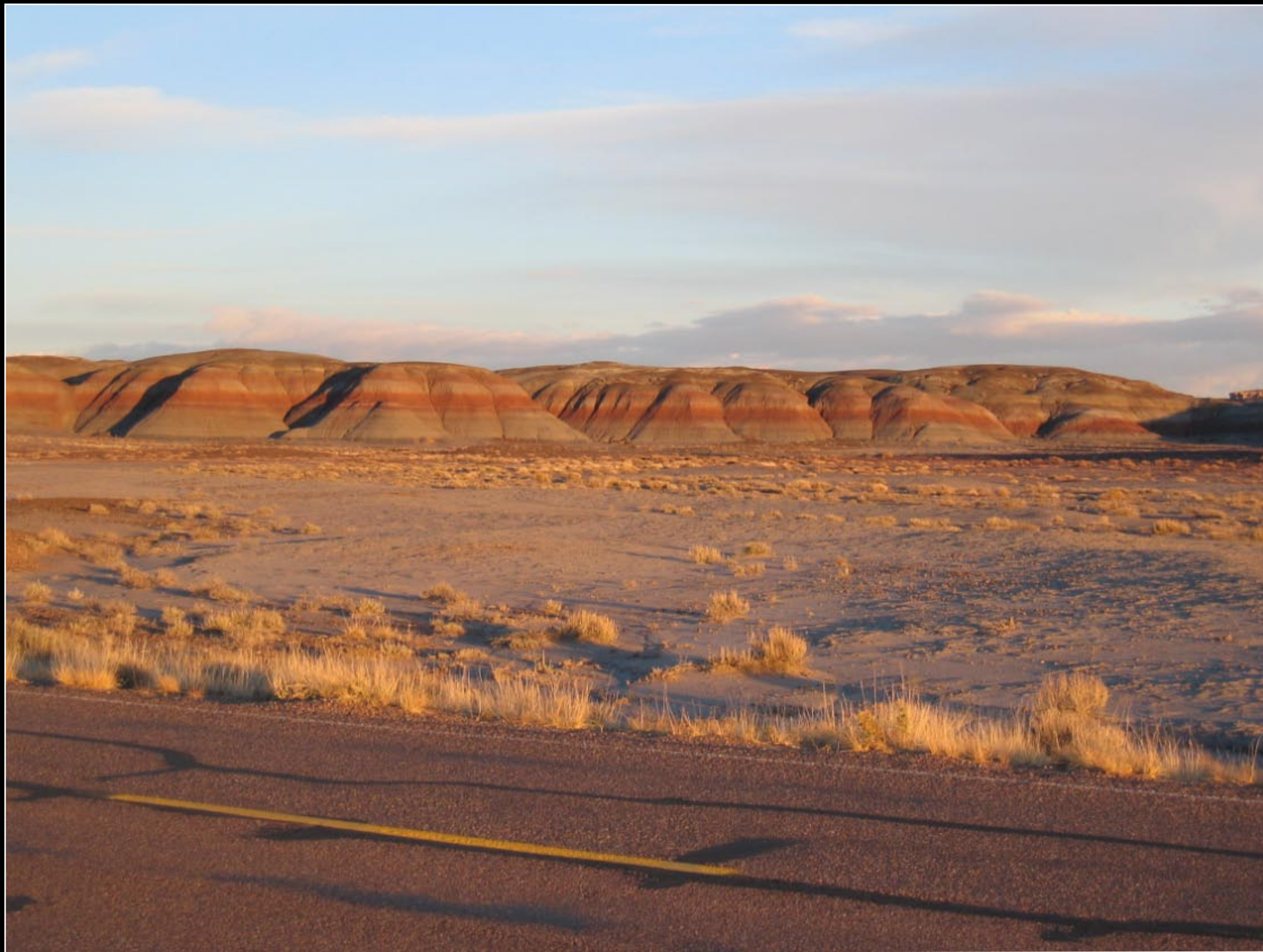
Not sure if this was Painted Desert or not, but it looked cool.