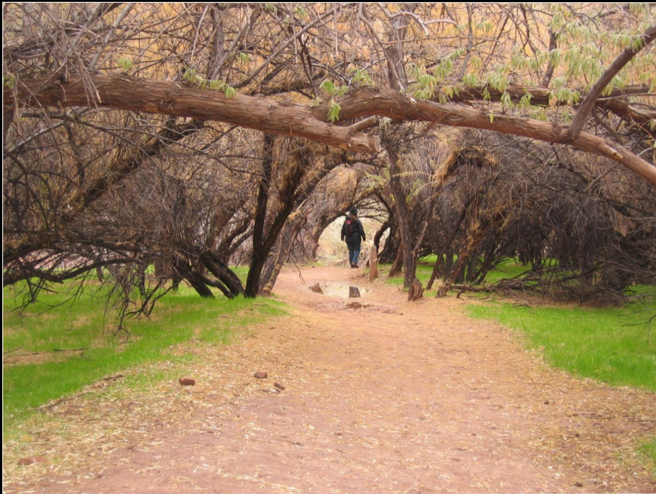
The valley floor was lush in contrast to arid mesa tops.