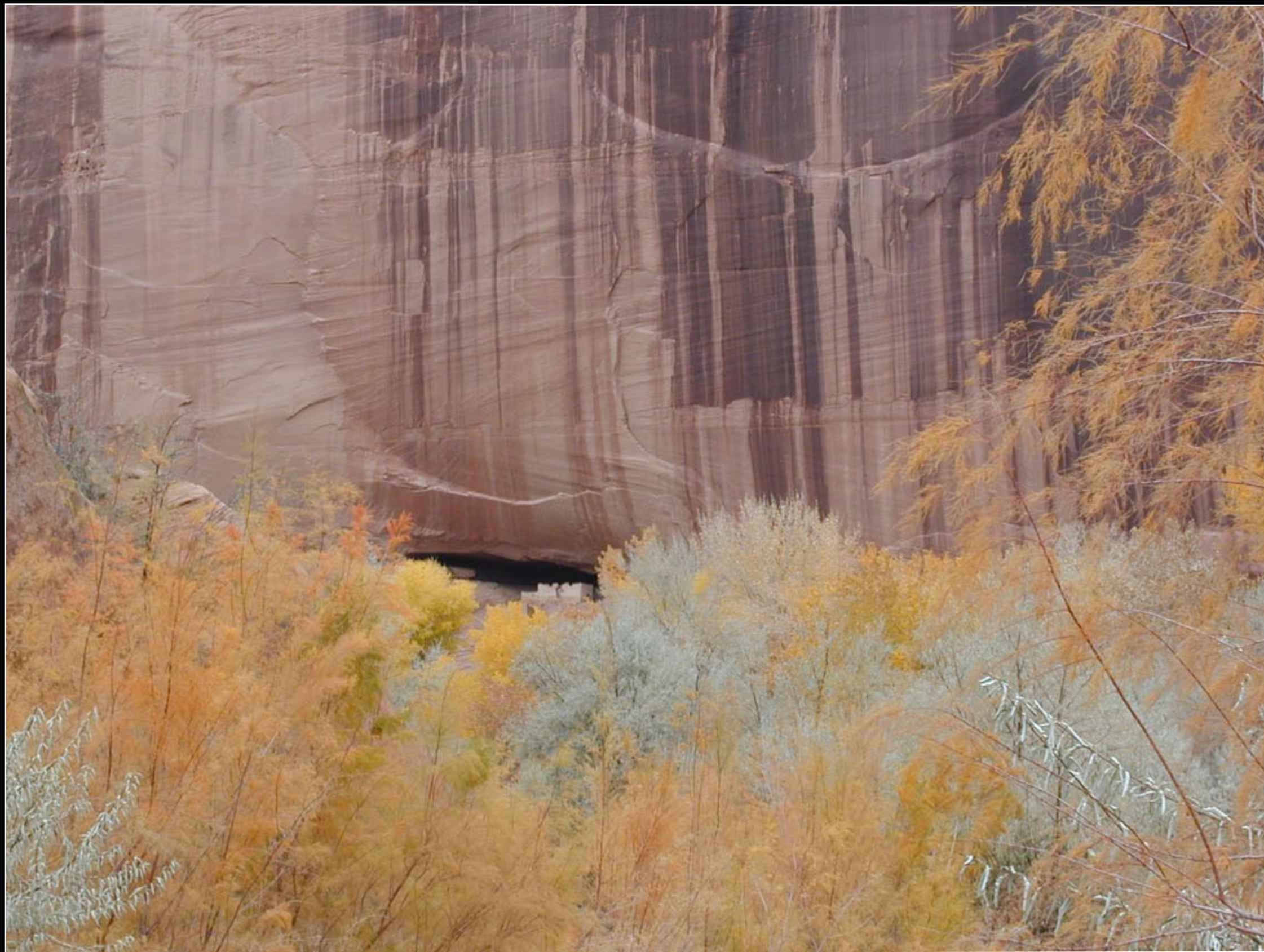
The White House viewed from upriver.