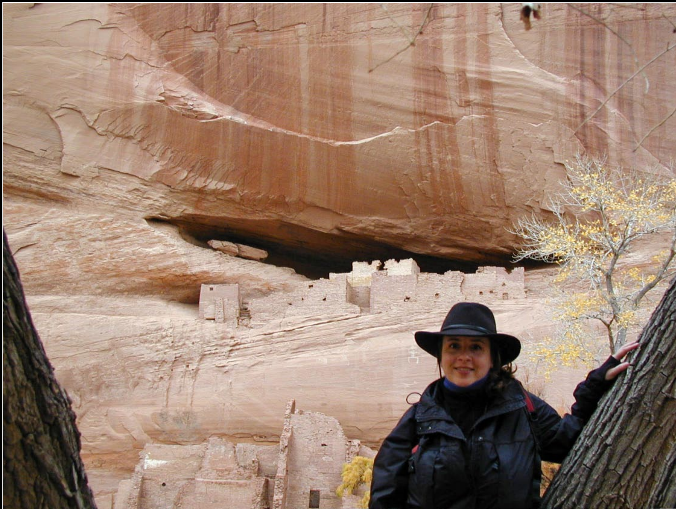
The White House at the bottom of Canyon de Chelly