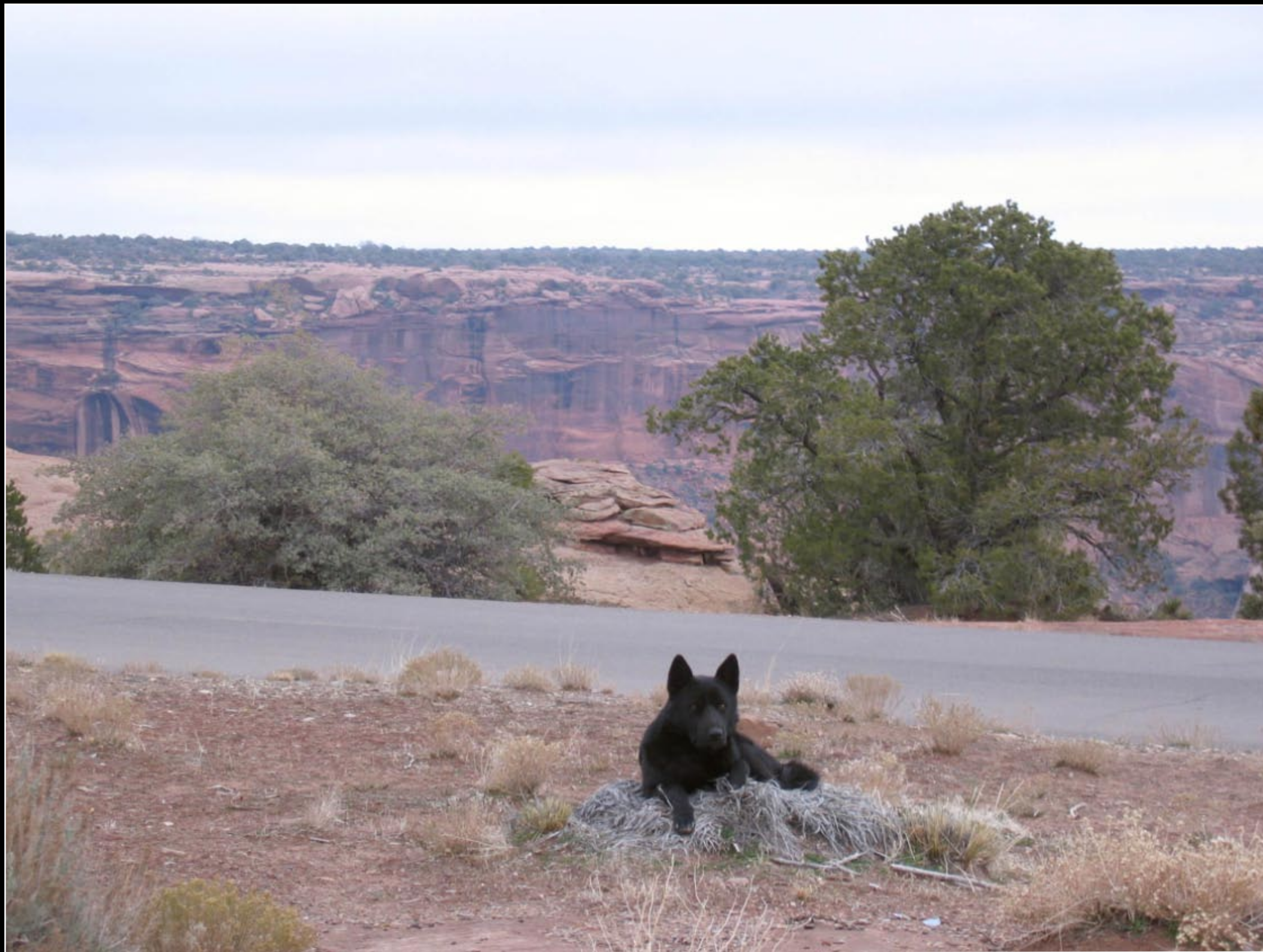
One of many loose dogs in the Canyon de Chelly area.