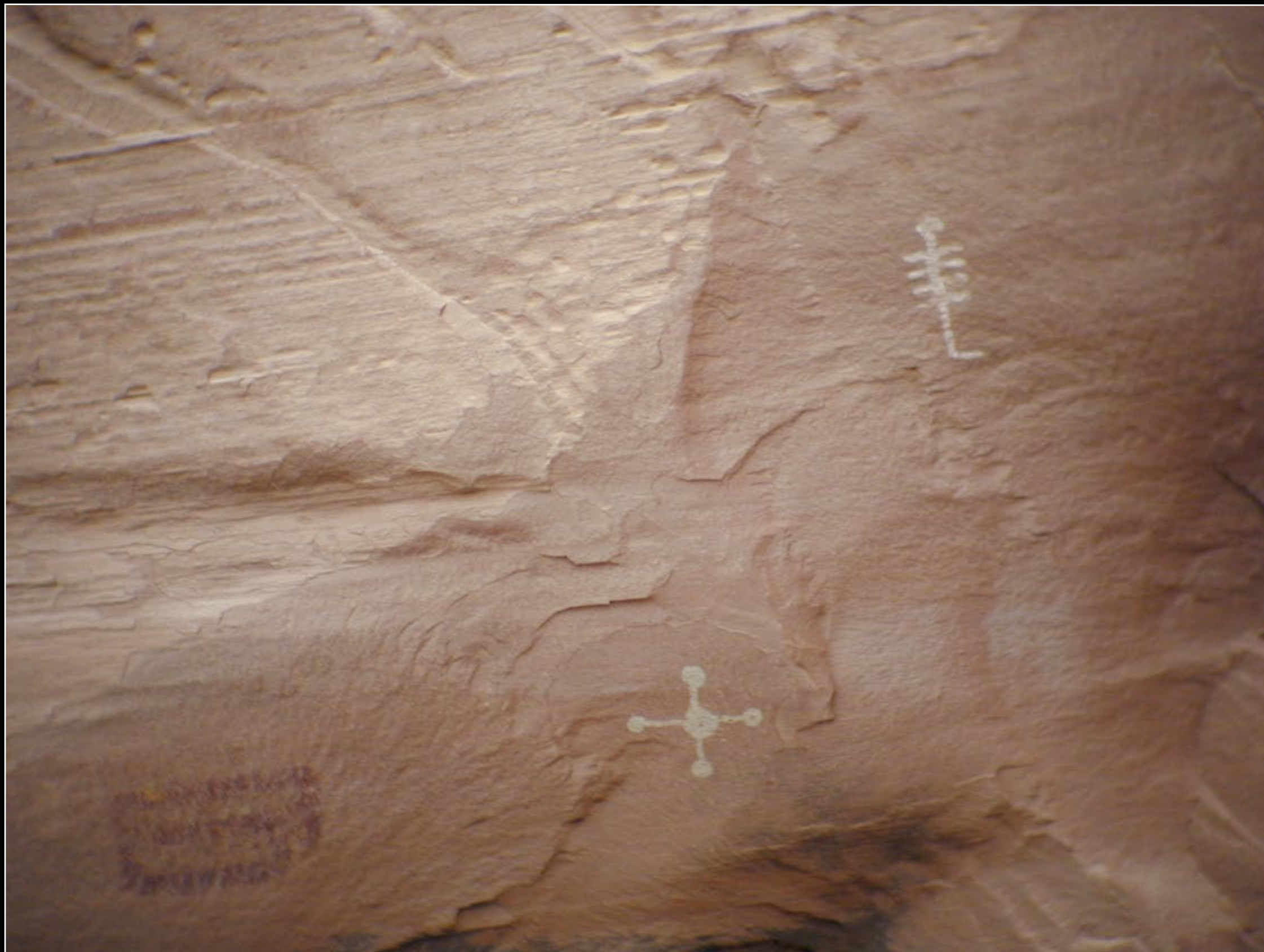
Petroglyphs of responsibility, four sacred mountains, scorpion