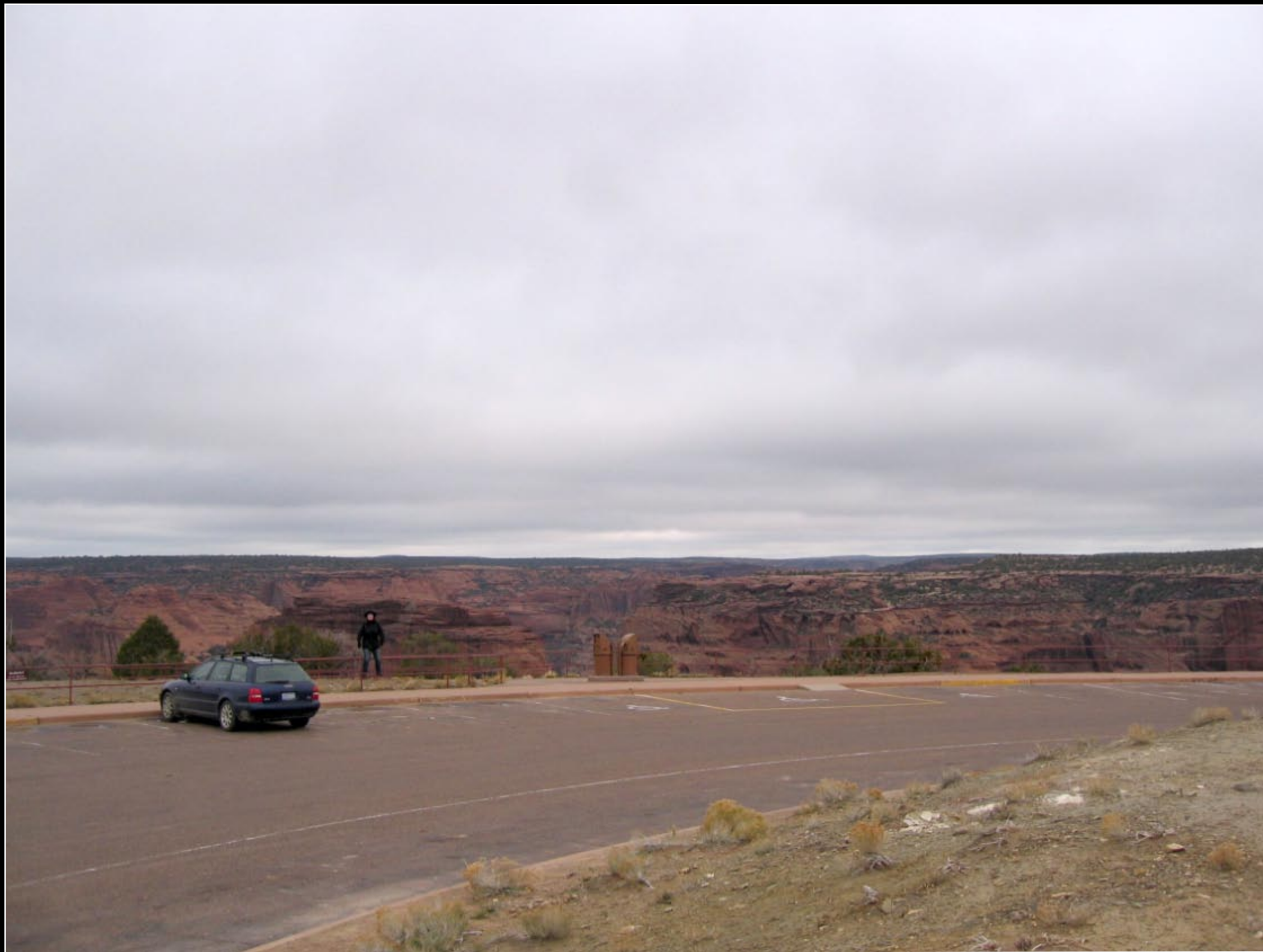
Off season in Canyon de Chelly!