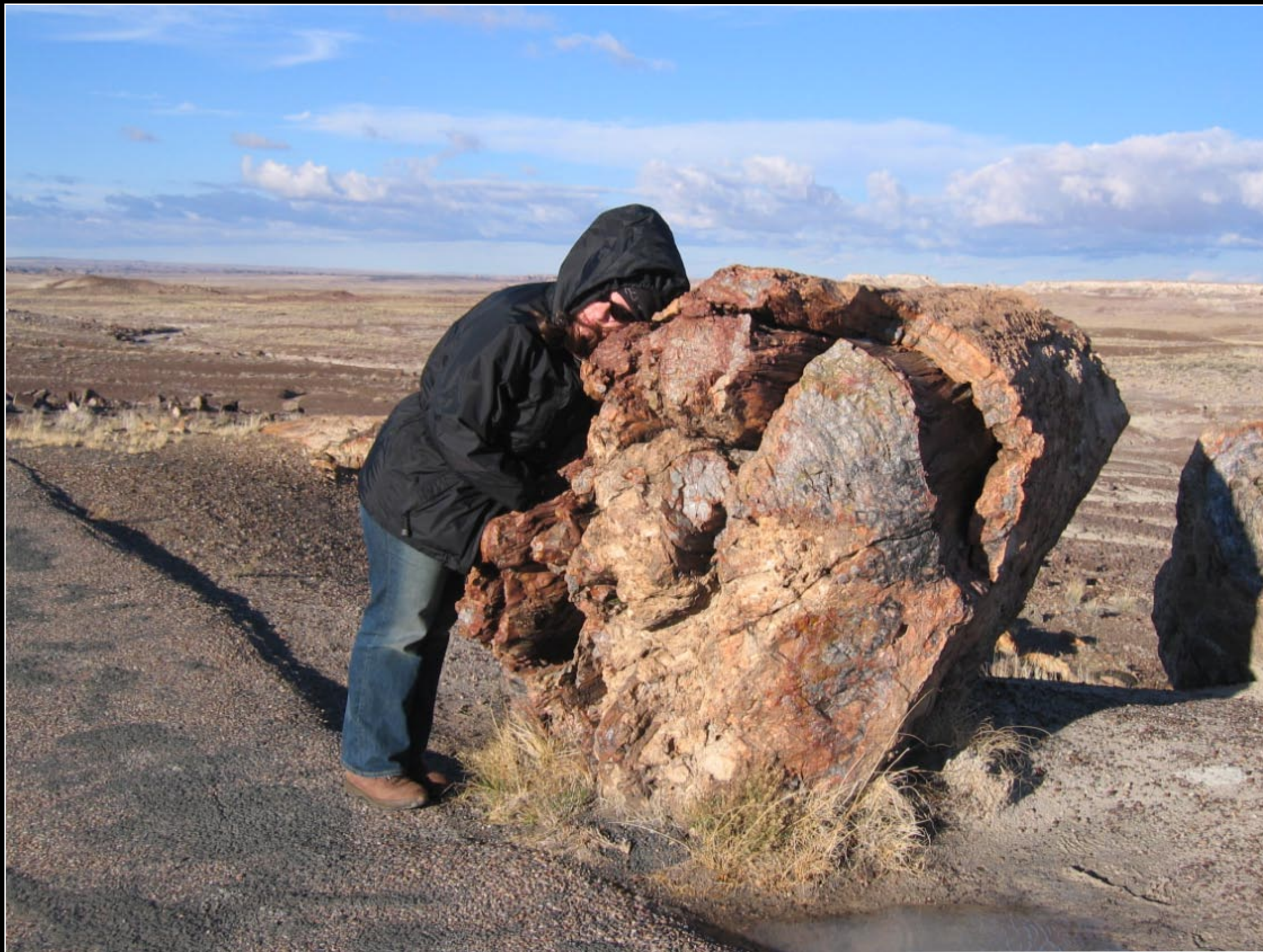
Hiding from the wind