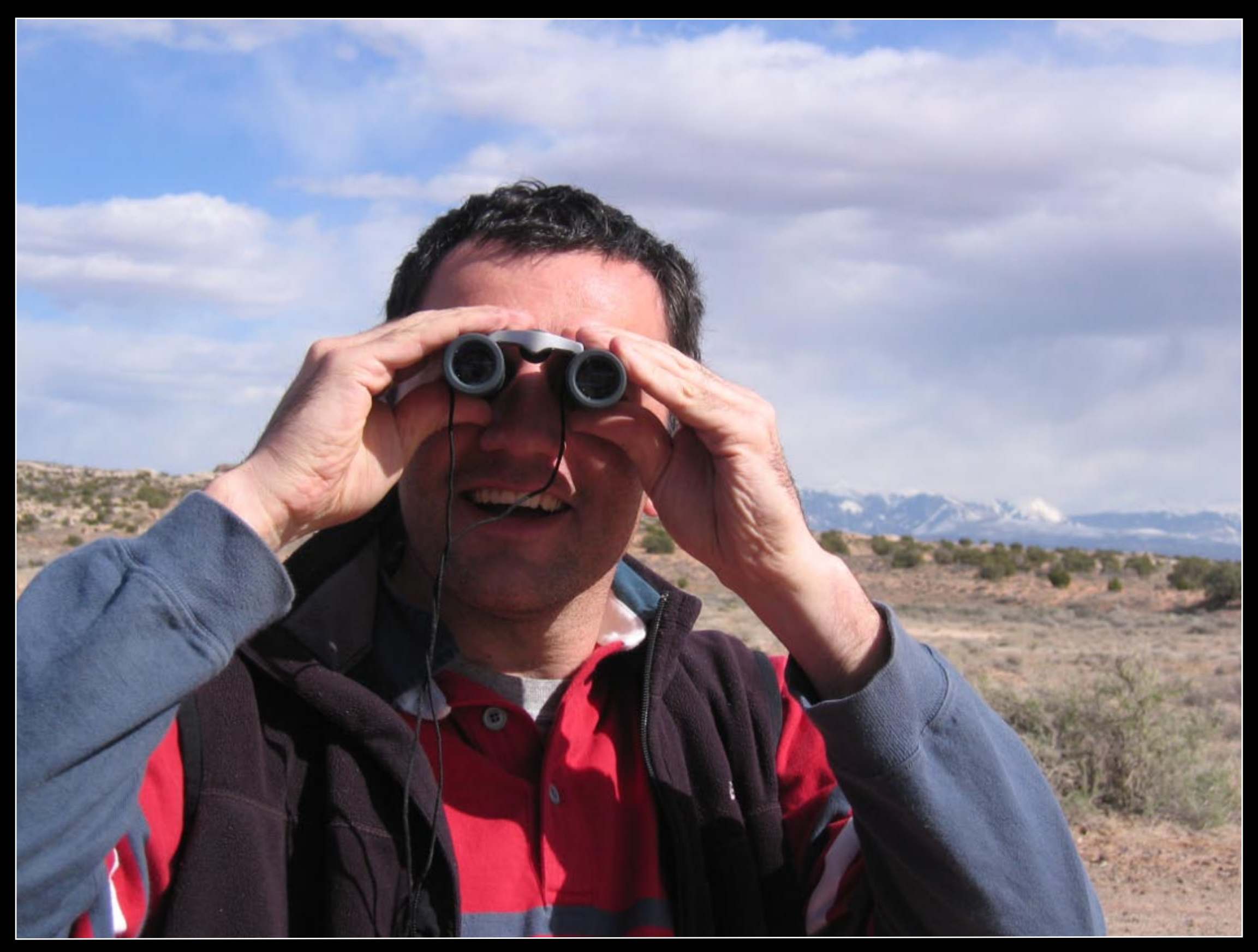
Nice binoculars, dood.