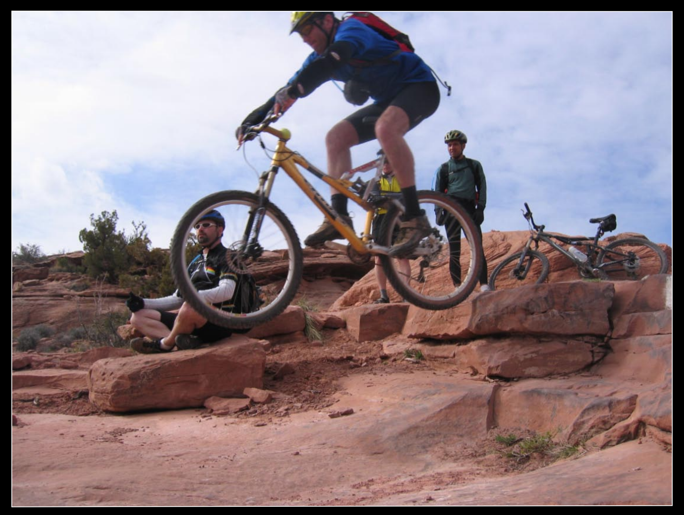
I landed in the foreground sand and wrecked a couple years ago.