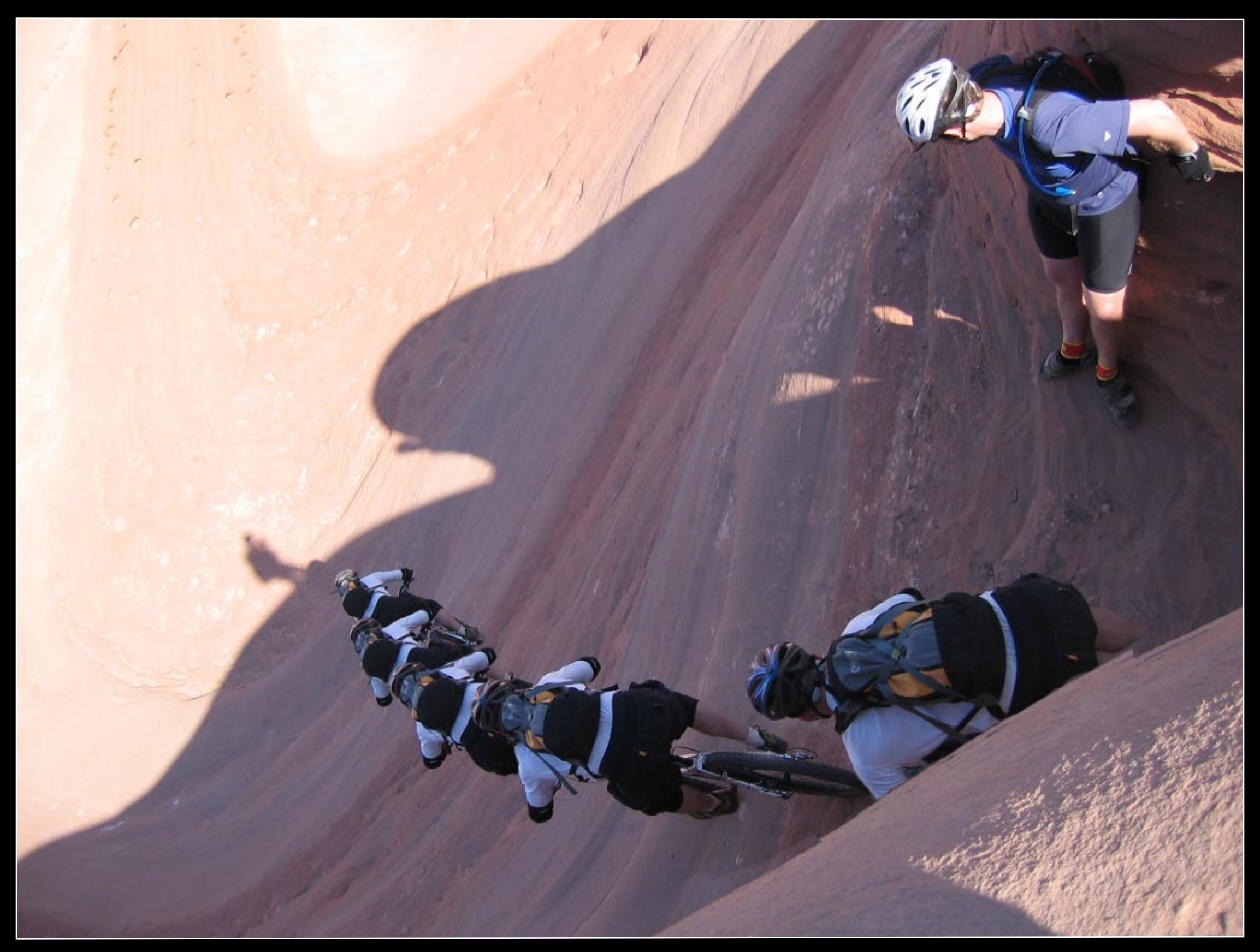
It looks this steep when you're at the top. Woo hoo!