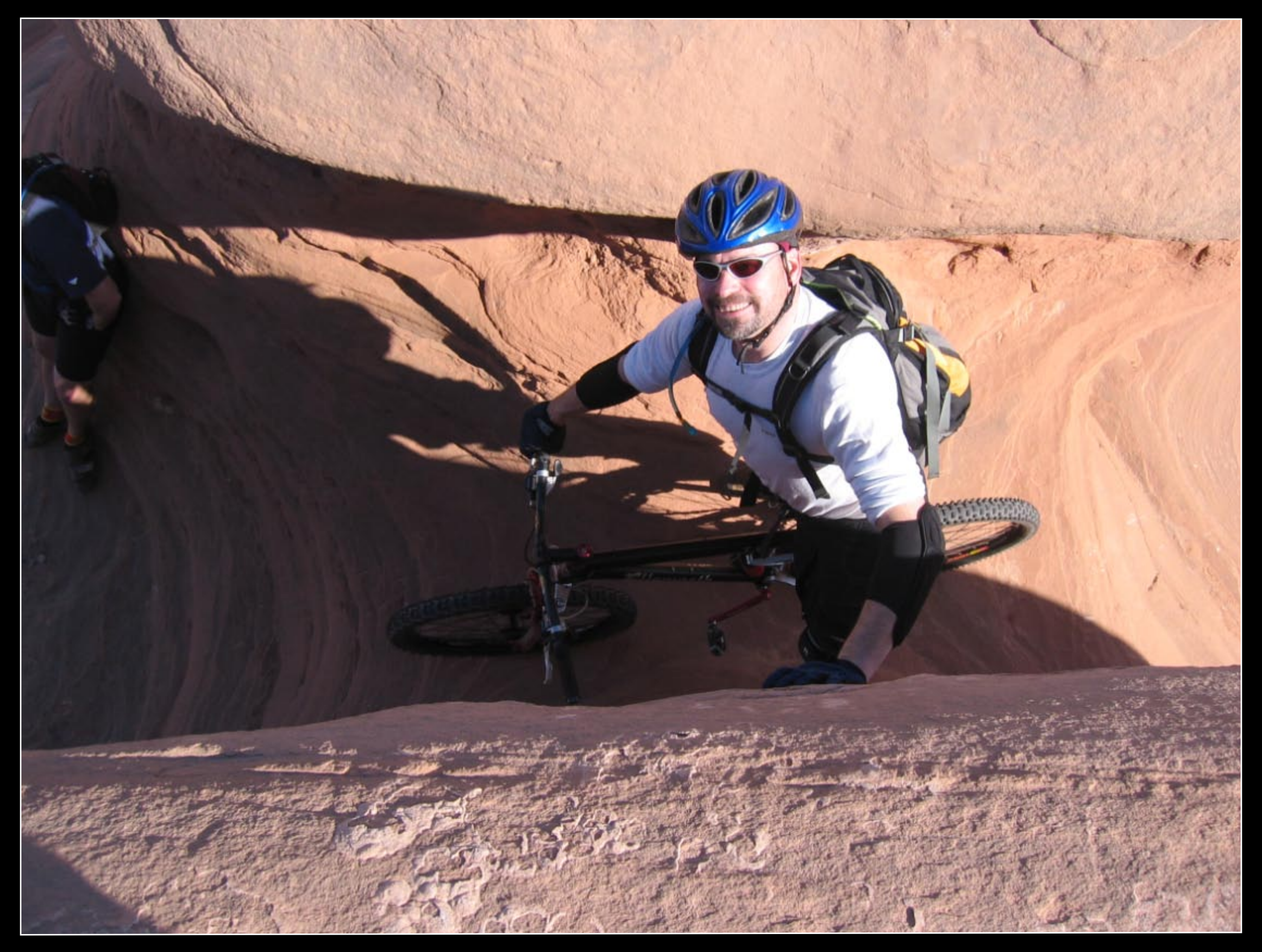
Ready to go down