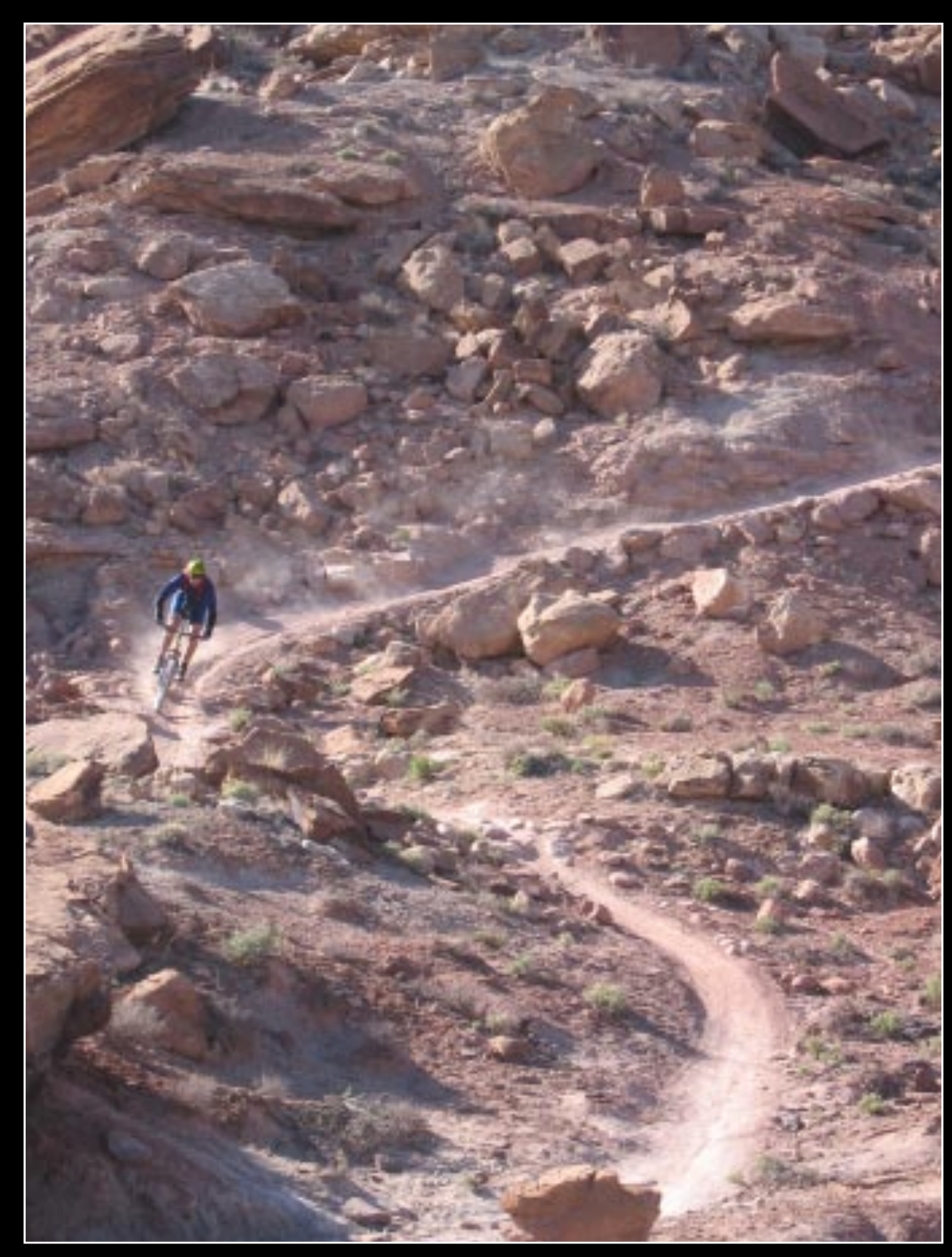
Sweet fast corners on Sovereign