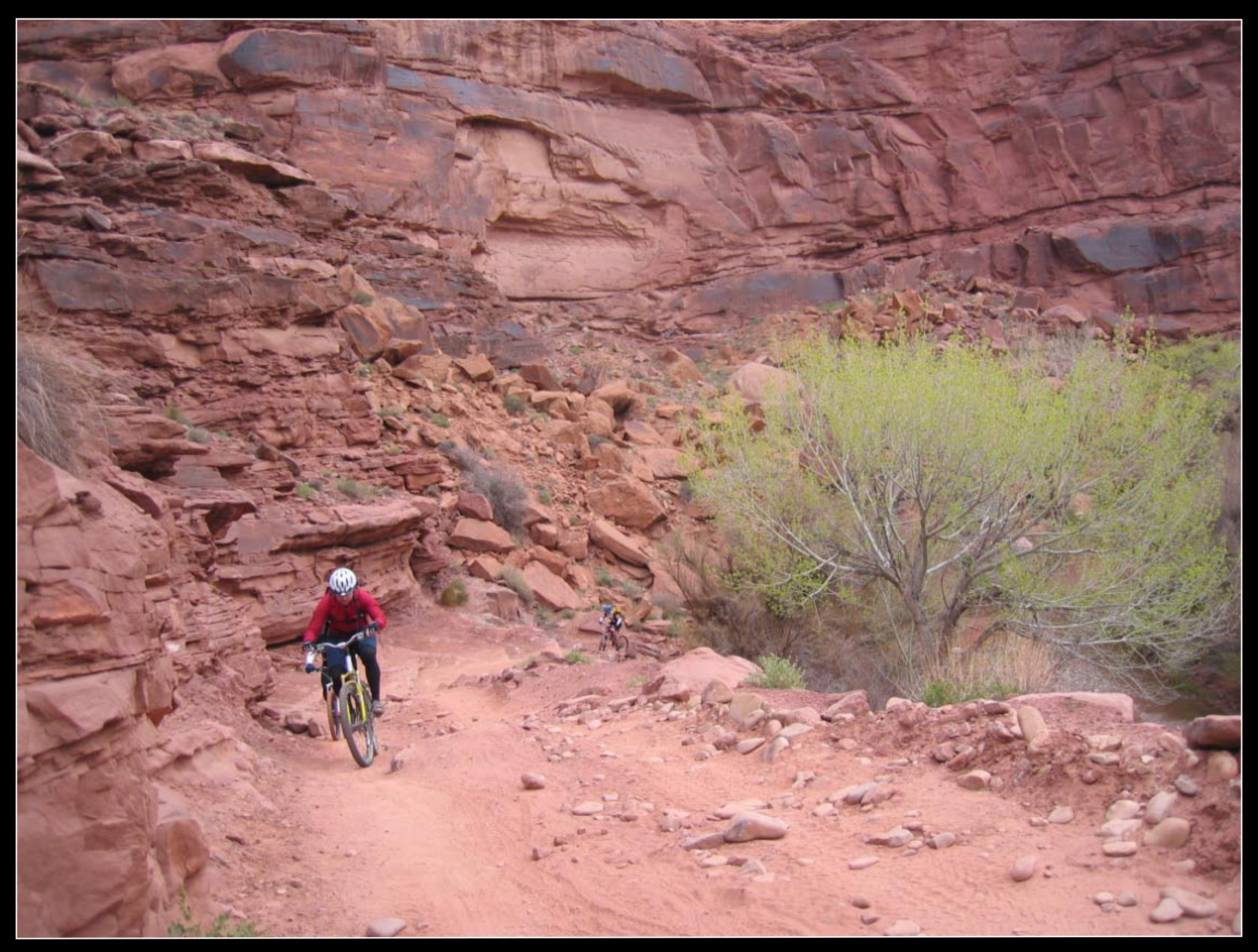
The climb on the other side of the creek.