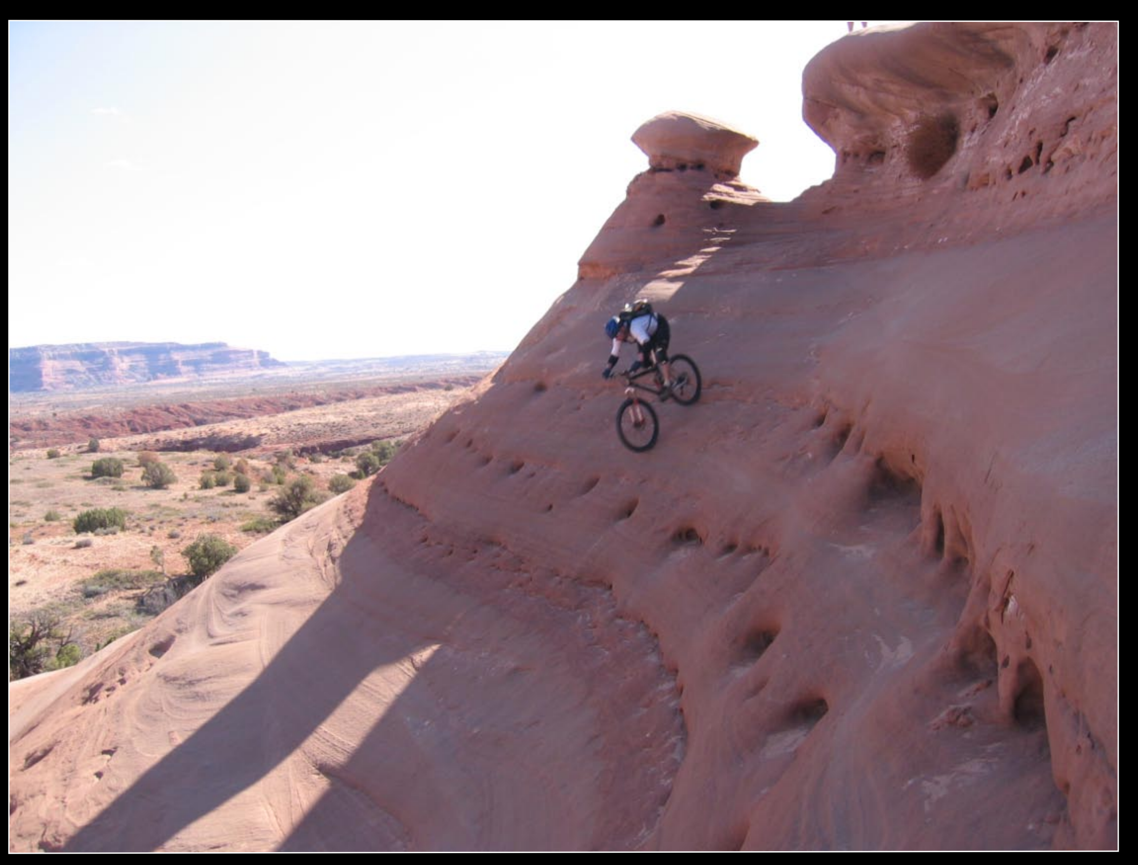
The next day on the mushroom at Bartlett Wash