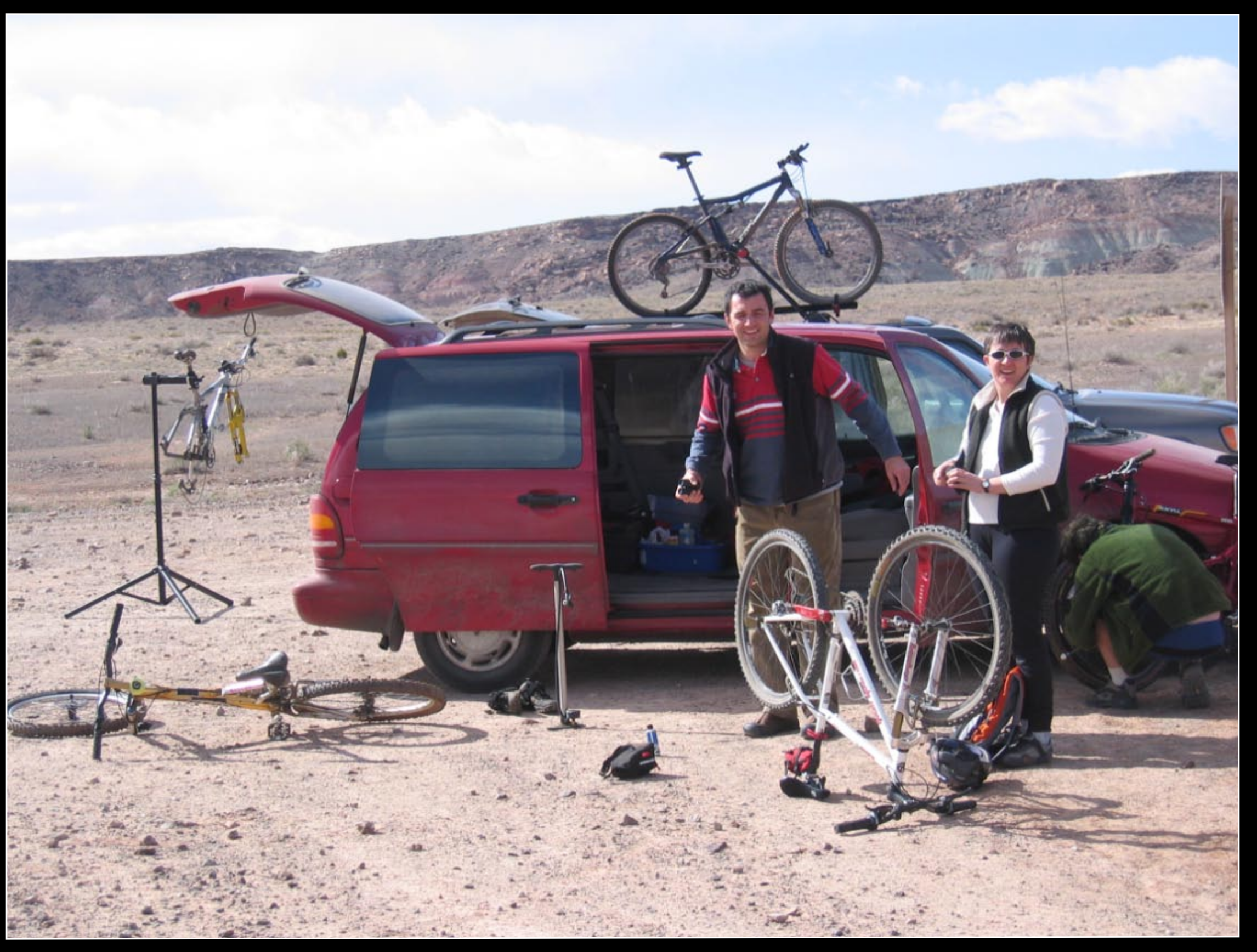
Not ready to ride quite yet