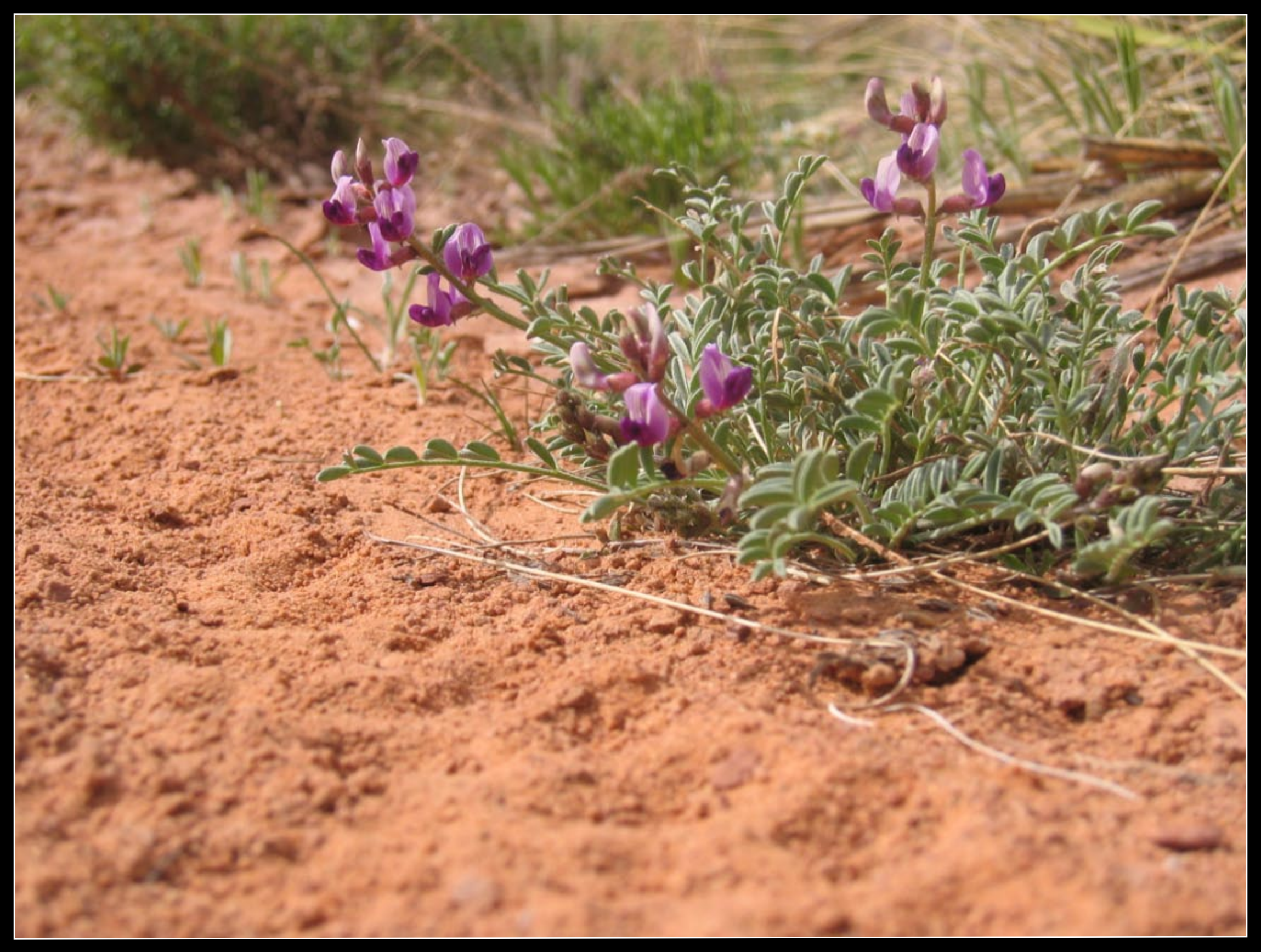
A few flowers were in bloom.