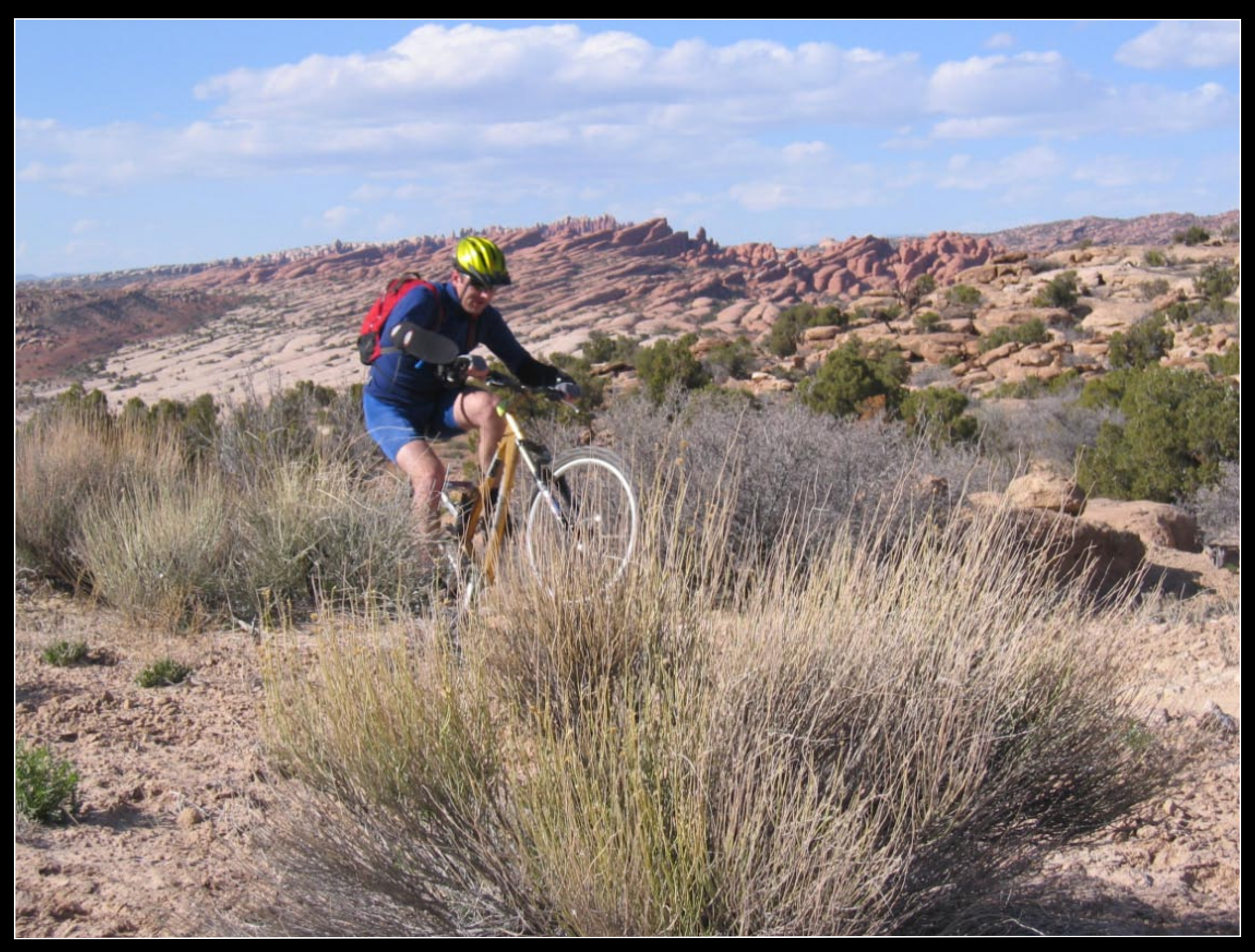
Sovereign Trail with slickrock near Arches Nat'l Park