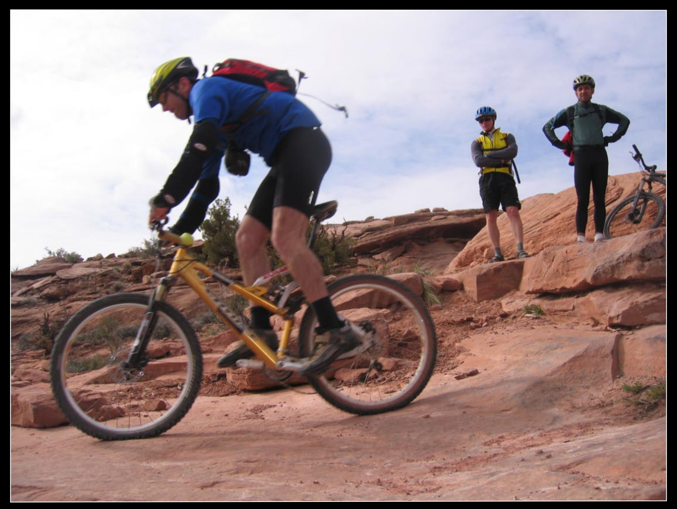
Yann reminded me of that wreck repeatedly during the ride.