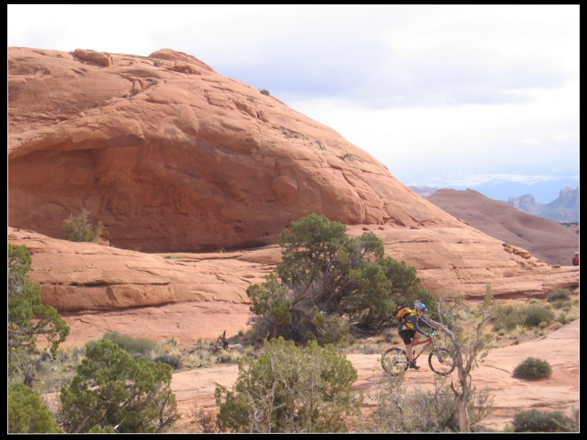
On the Amassa Back peninsula.