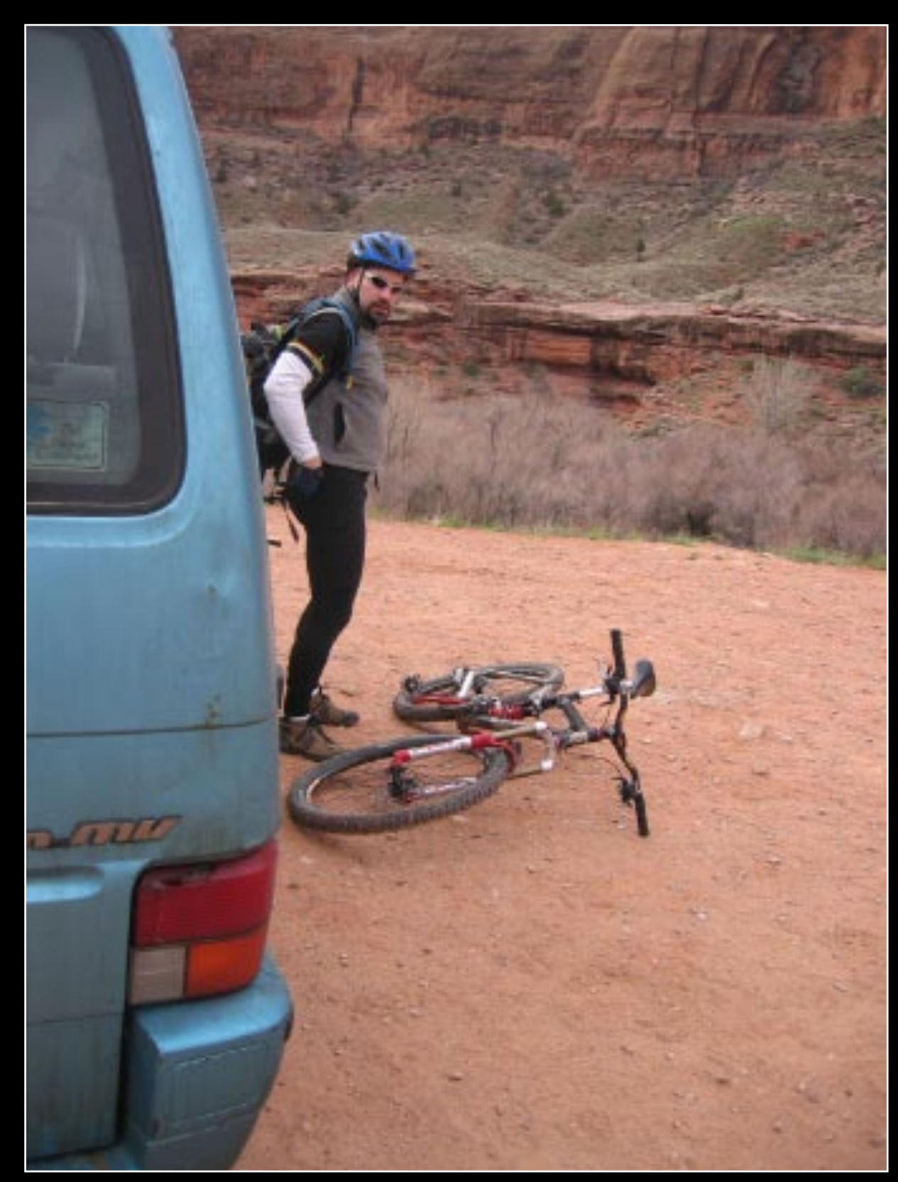
Raph's fine van. The back door doesn't latch.