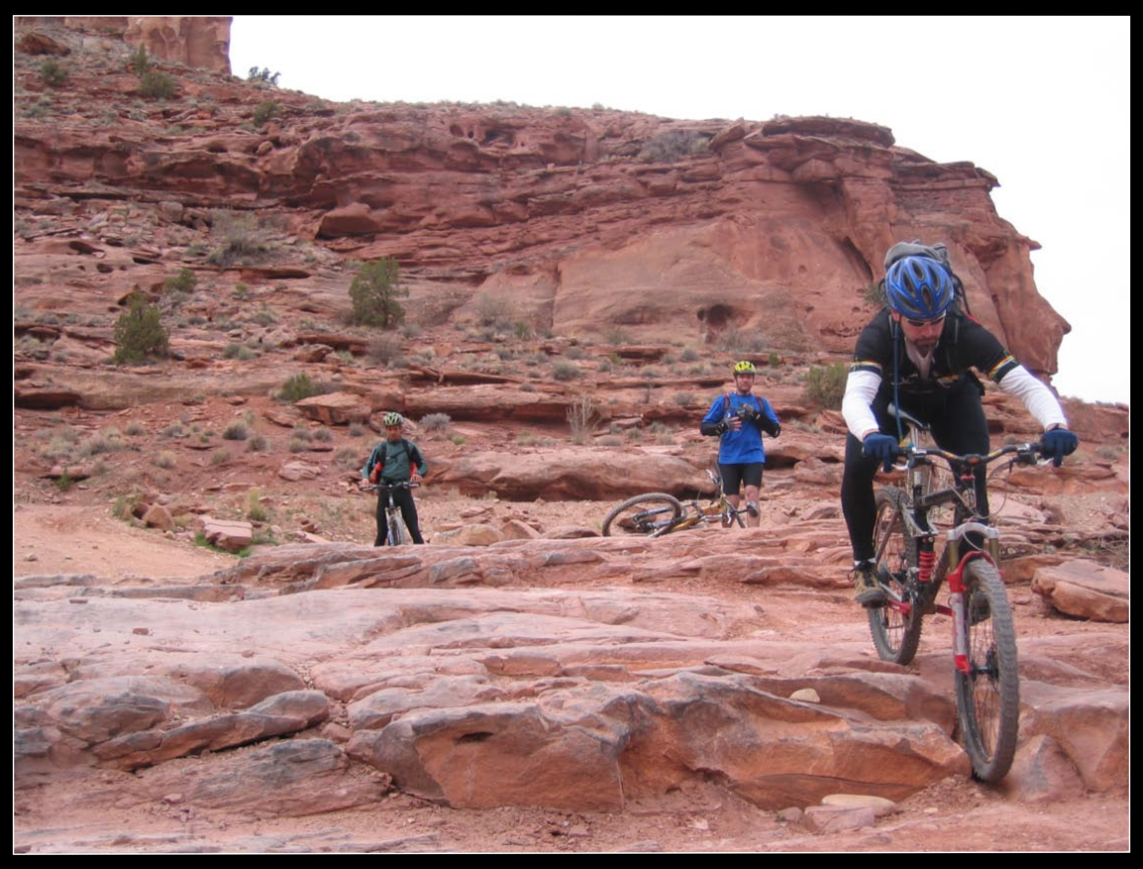
The entrance to Amassa.