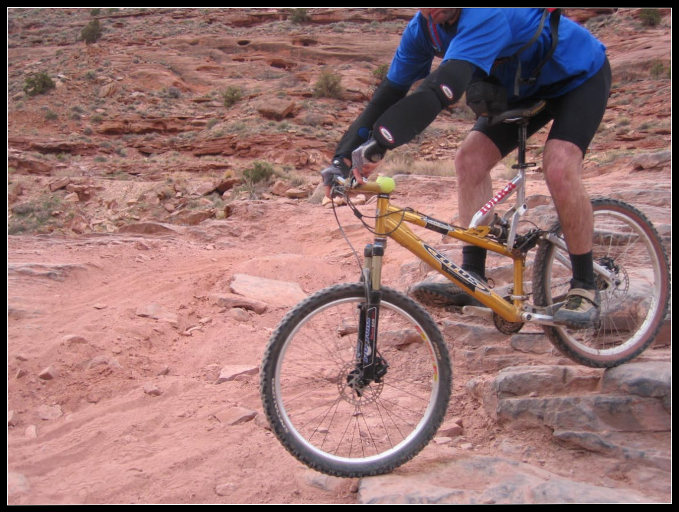
Some doofoo who can't aim a camera took this one.