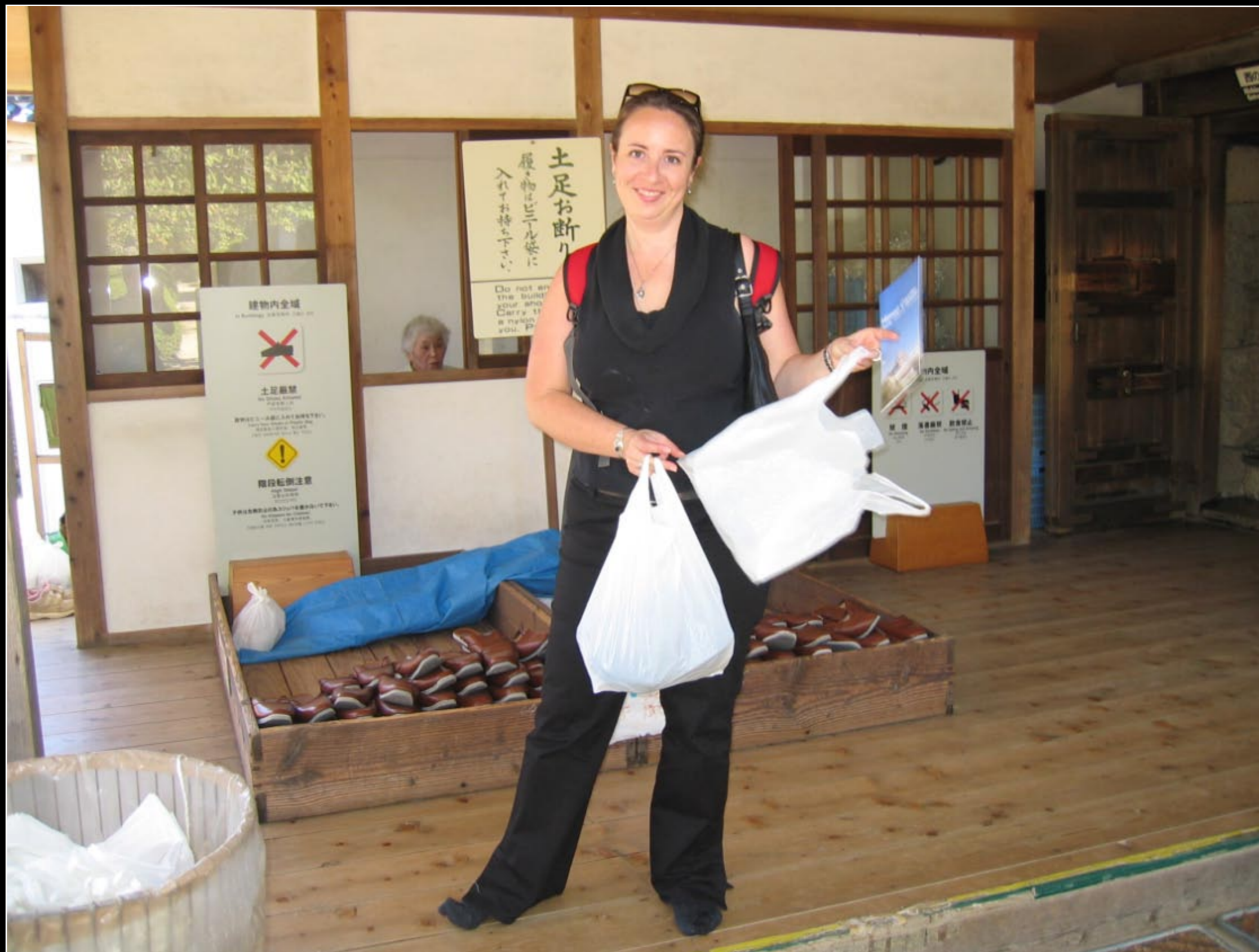
Many places require no shoes. The women's gallery in this case.