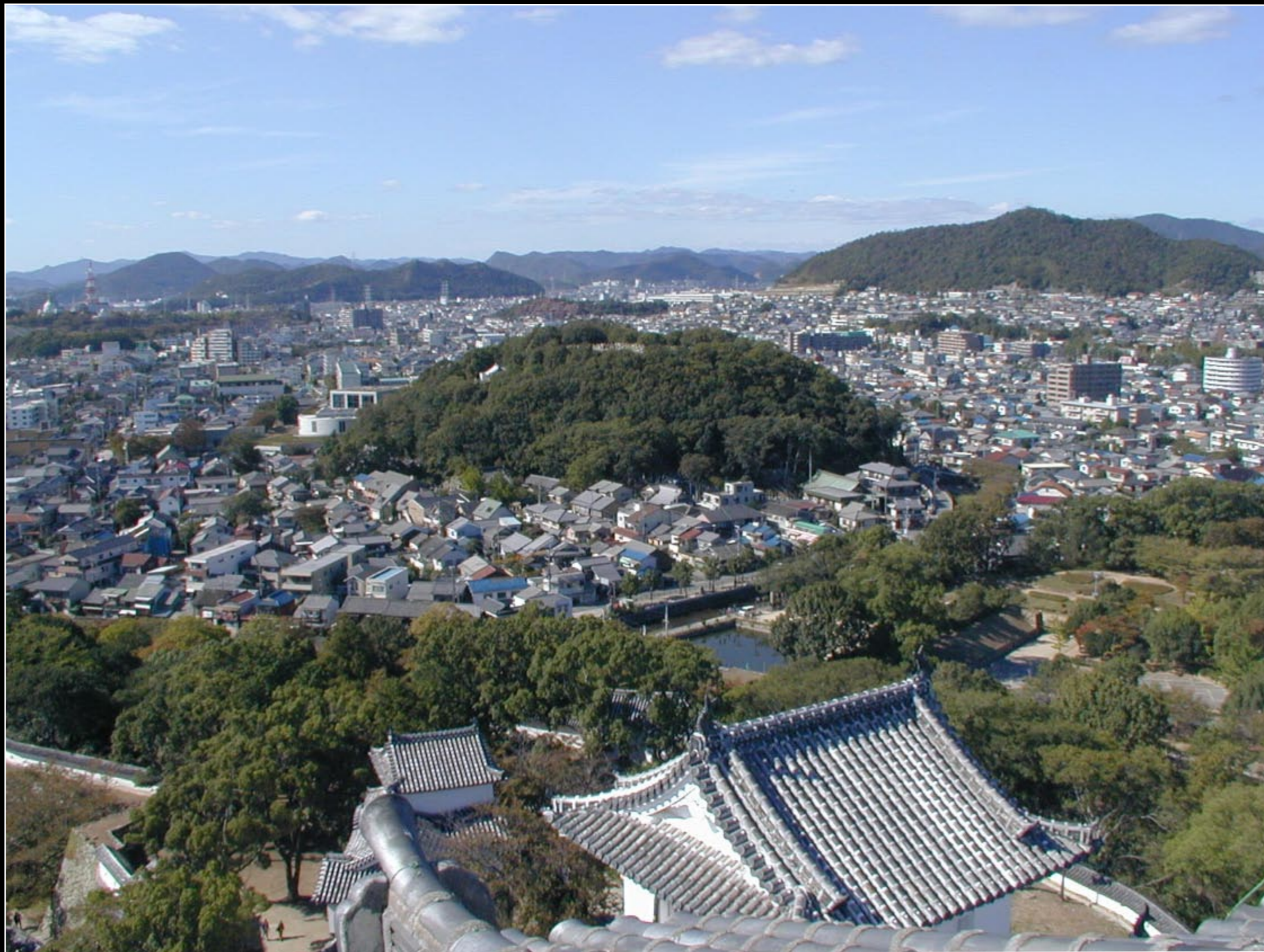
Himeji as viewed from the castle top.