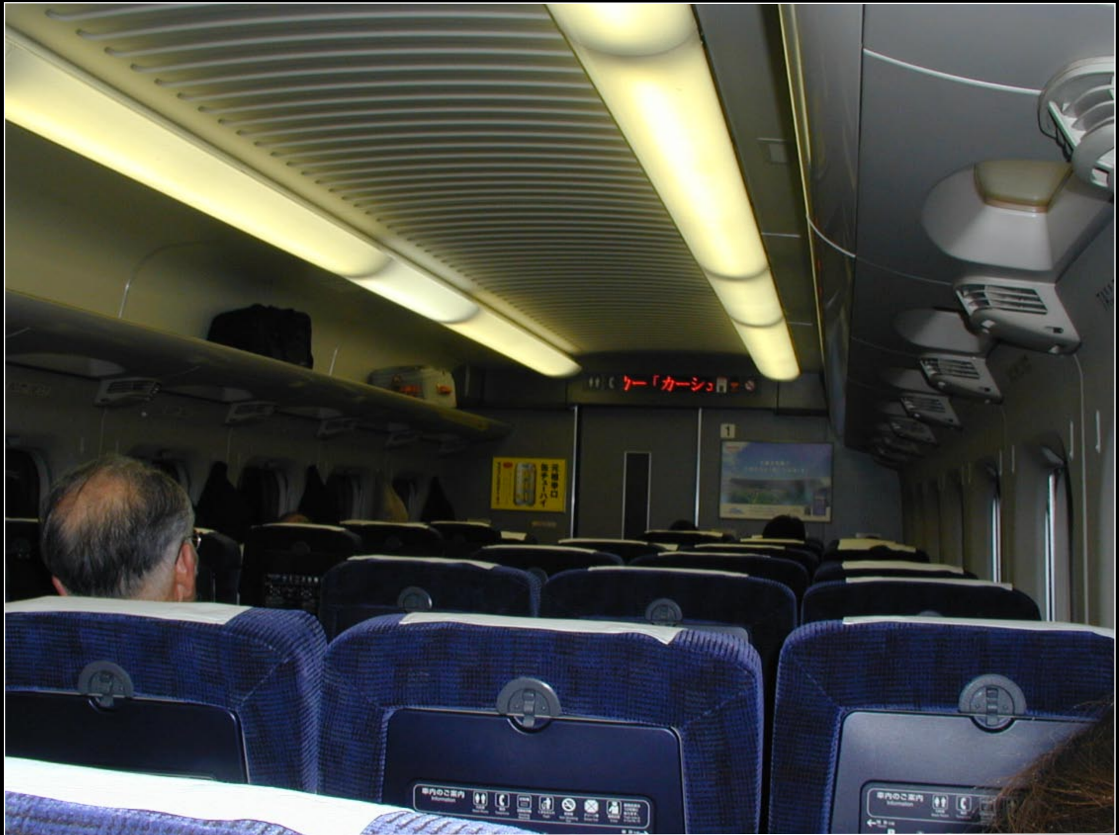
Inside a shinkansen, a.k.a. bullet, train.