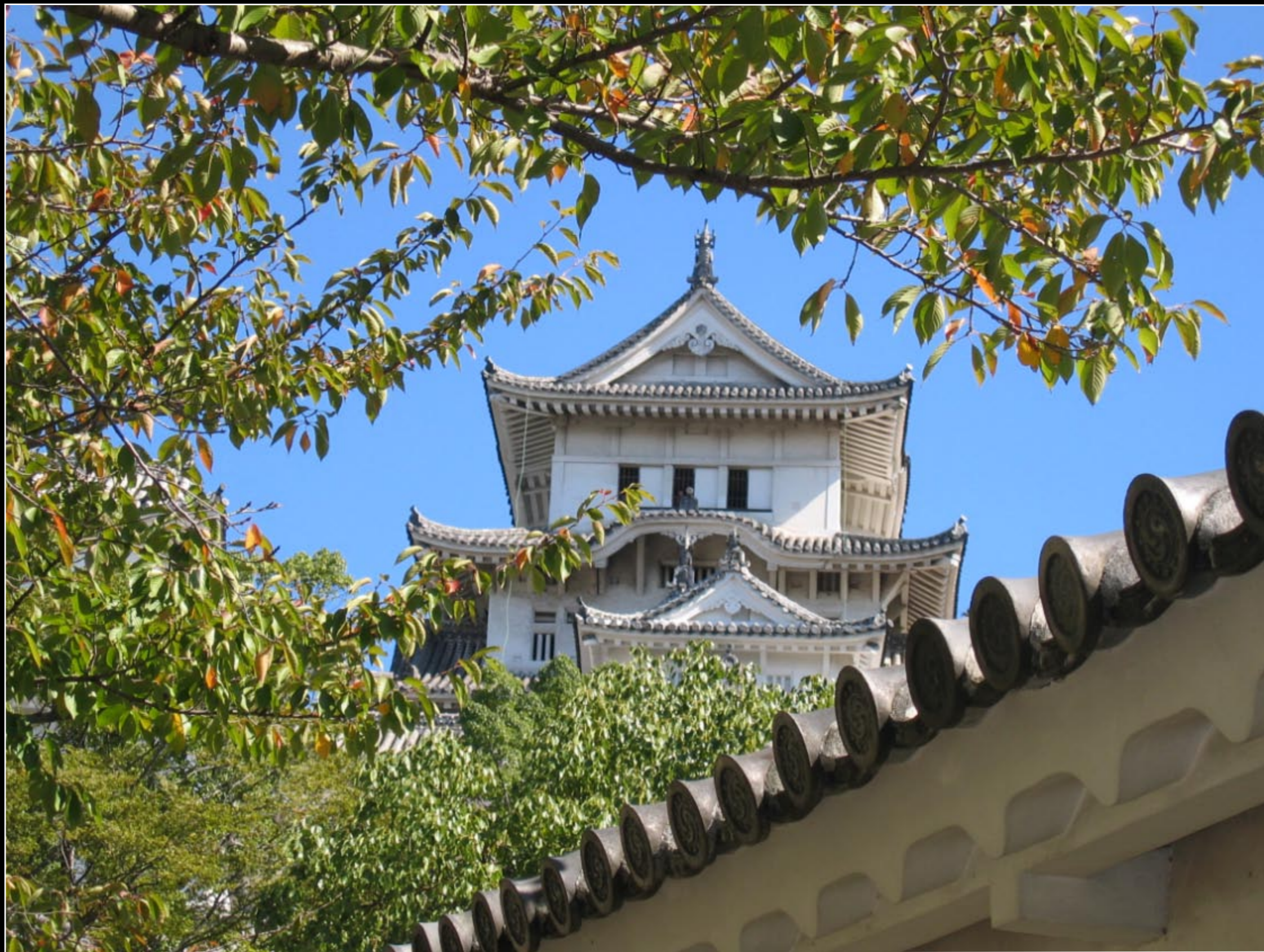
Family crests are on the end cap tiles on the eaves.