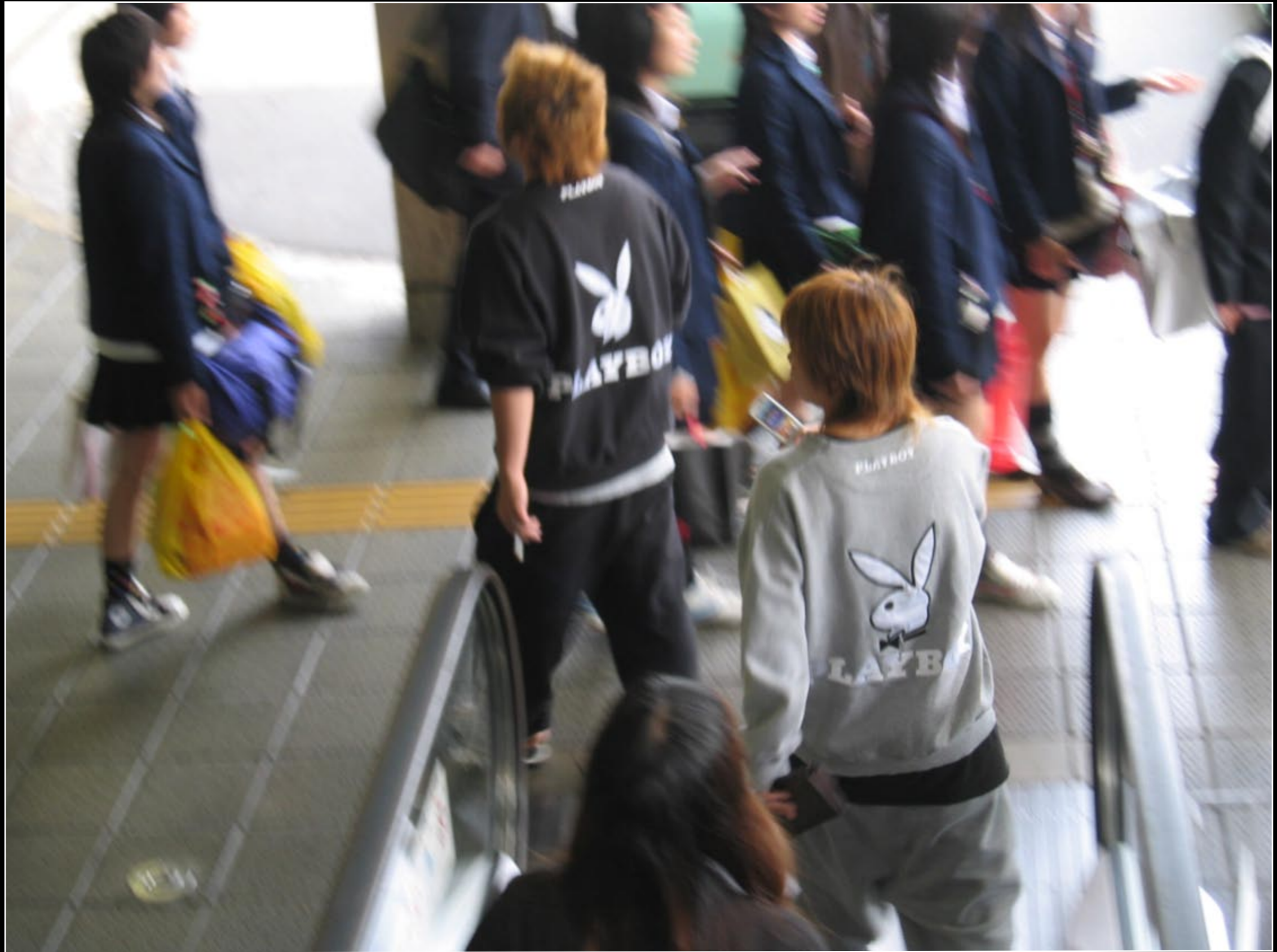
"Yanqui" boys complete with bleached hair and cell phones.