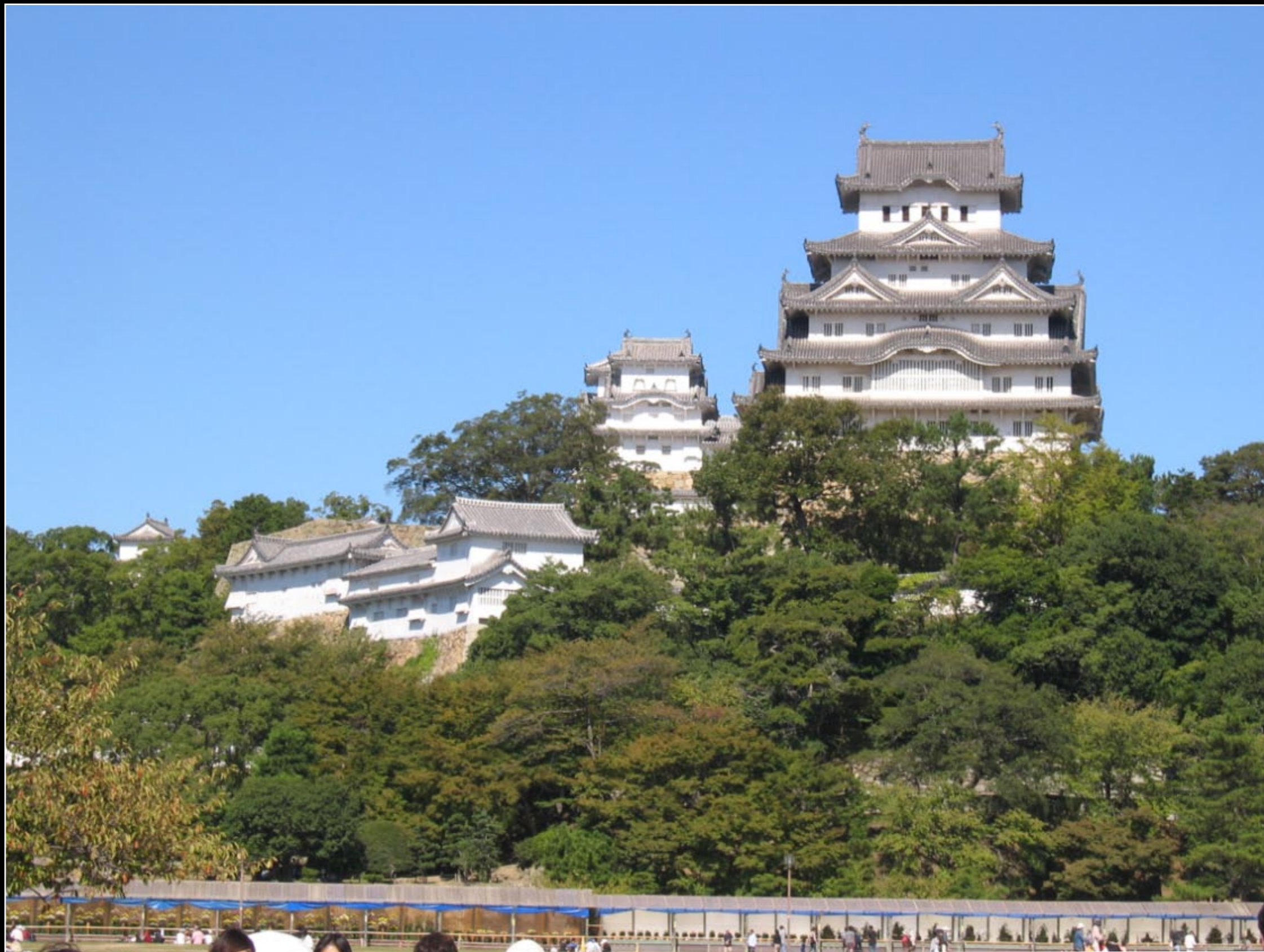
Green houses below the castle growing Chrysanthamums.