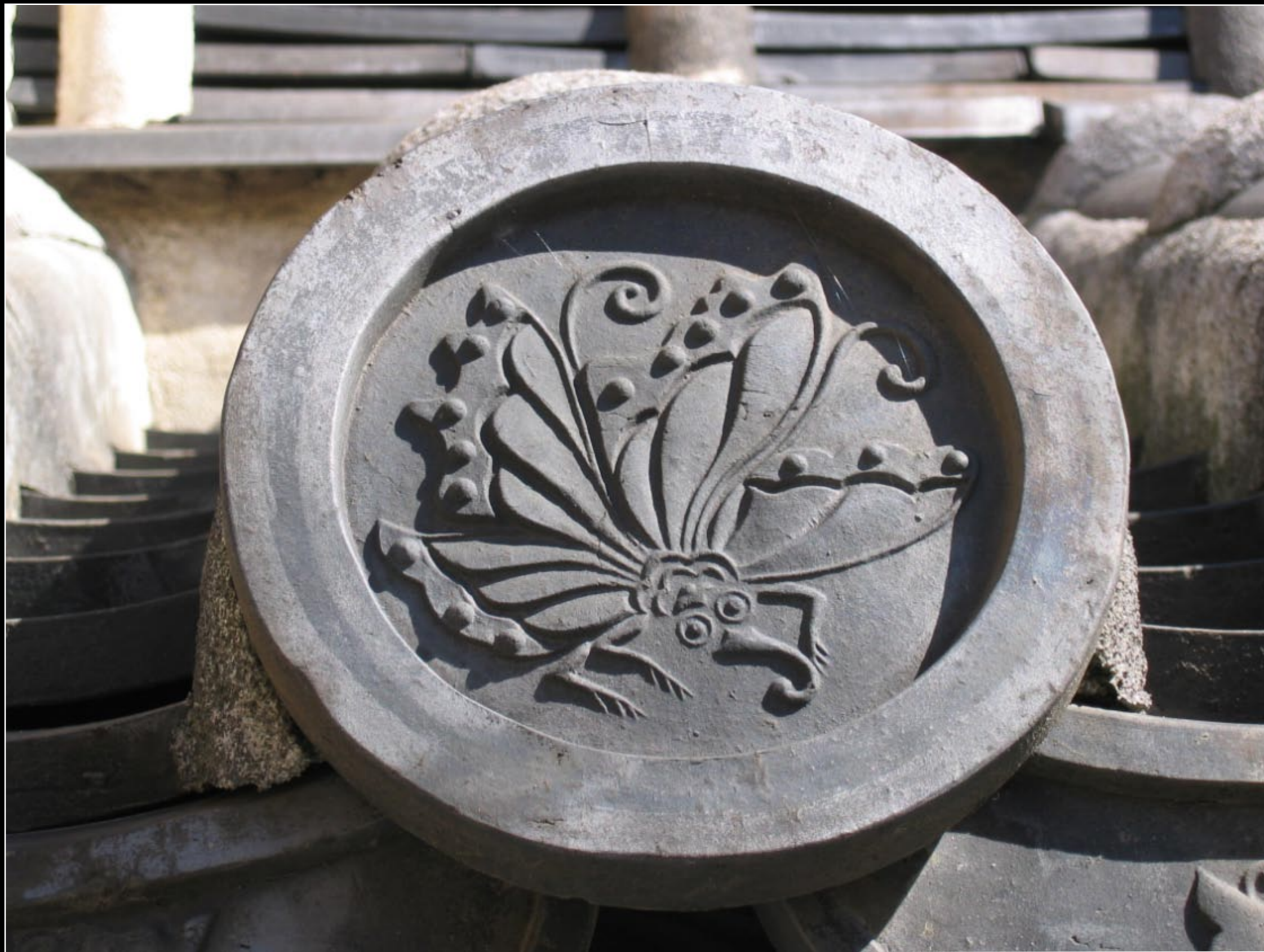
A family crest tile.