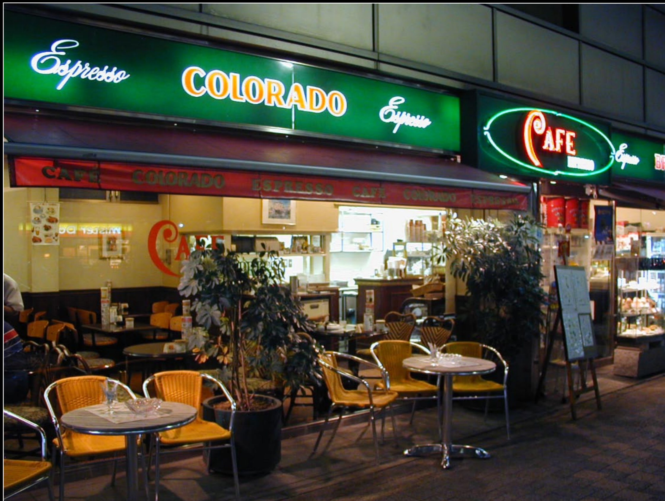
Colorado cafe in Kyoto. It turns out it was Colorado, Brazil!