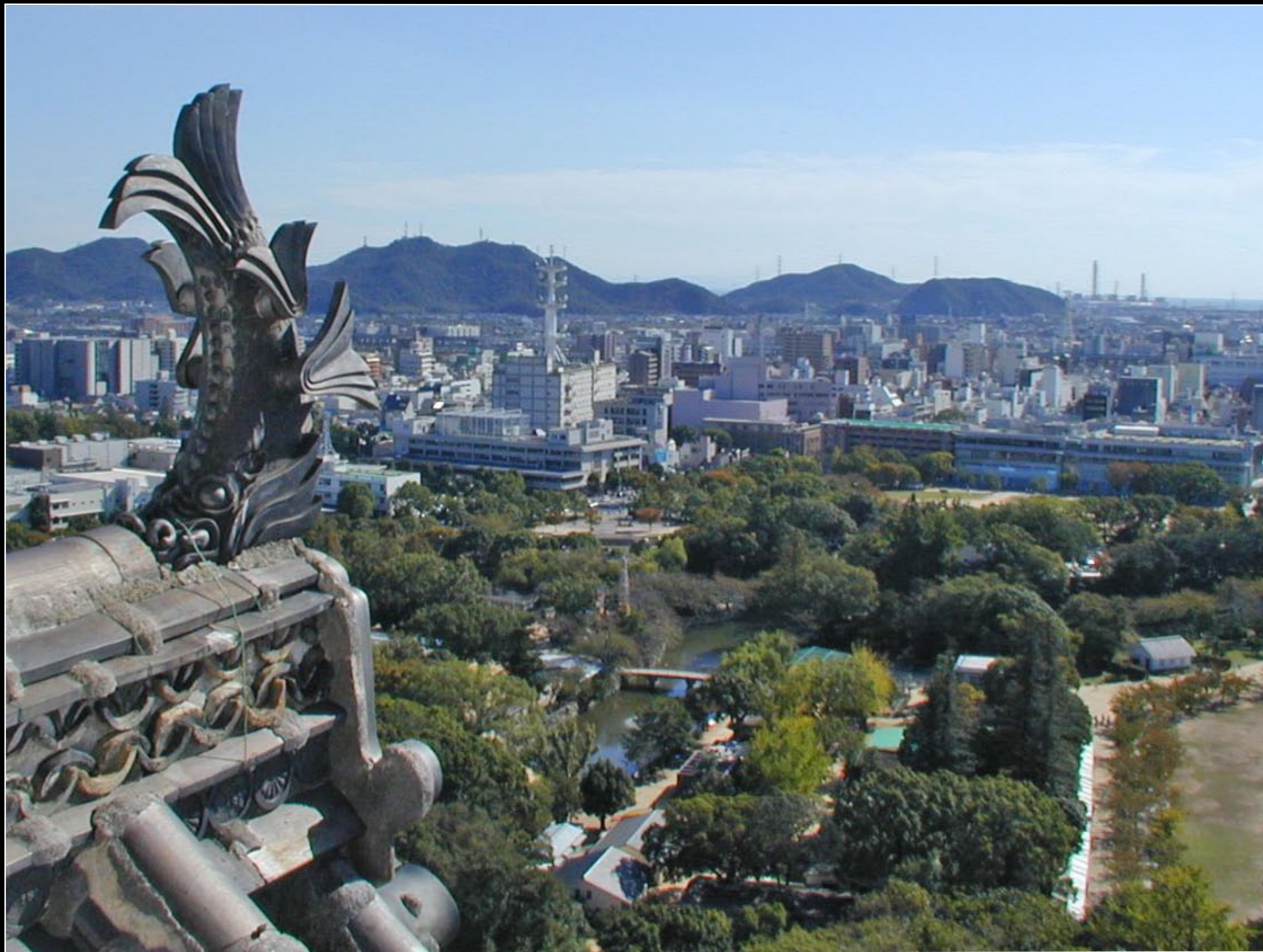
Shachihoko viewed from the top floor of the castle.