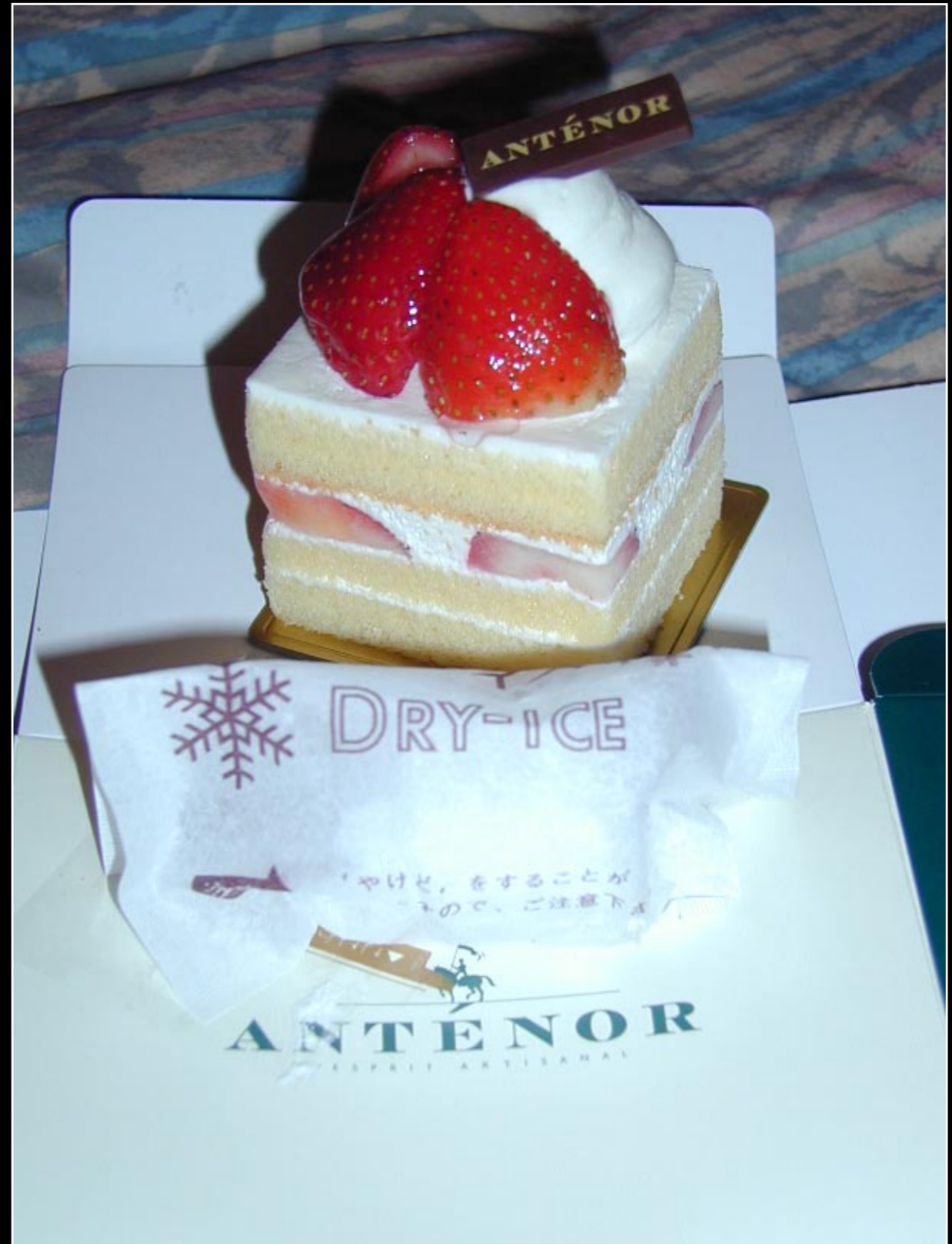
Yummy treat, but P unknowingly burned her finger on the "ice."