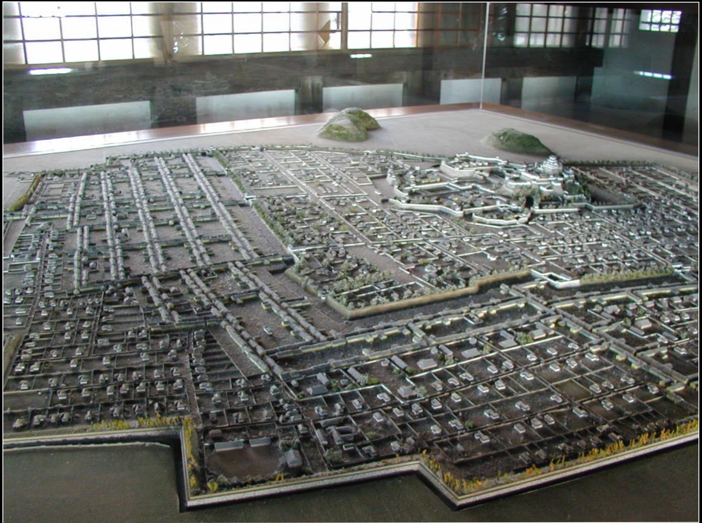
What Himeji used to look like.