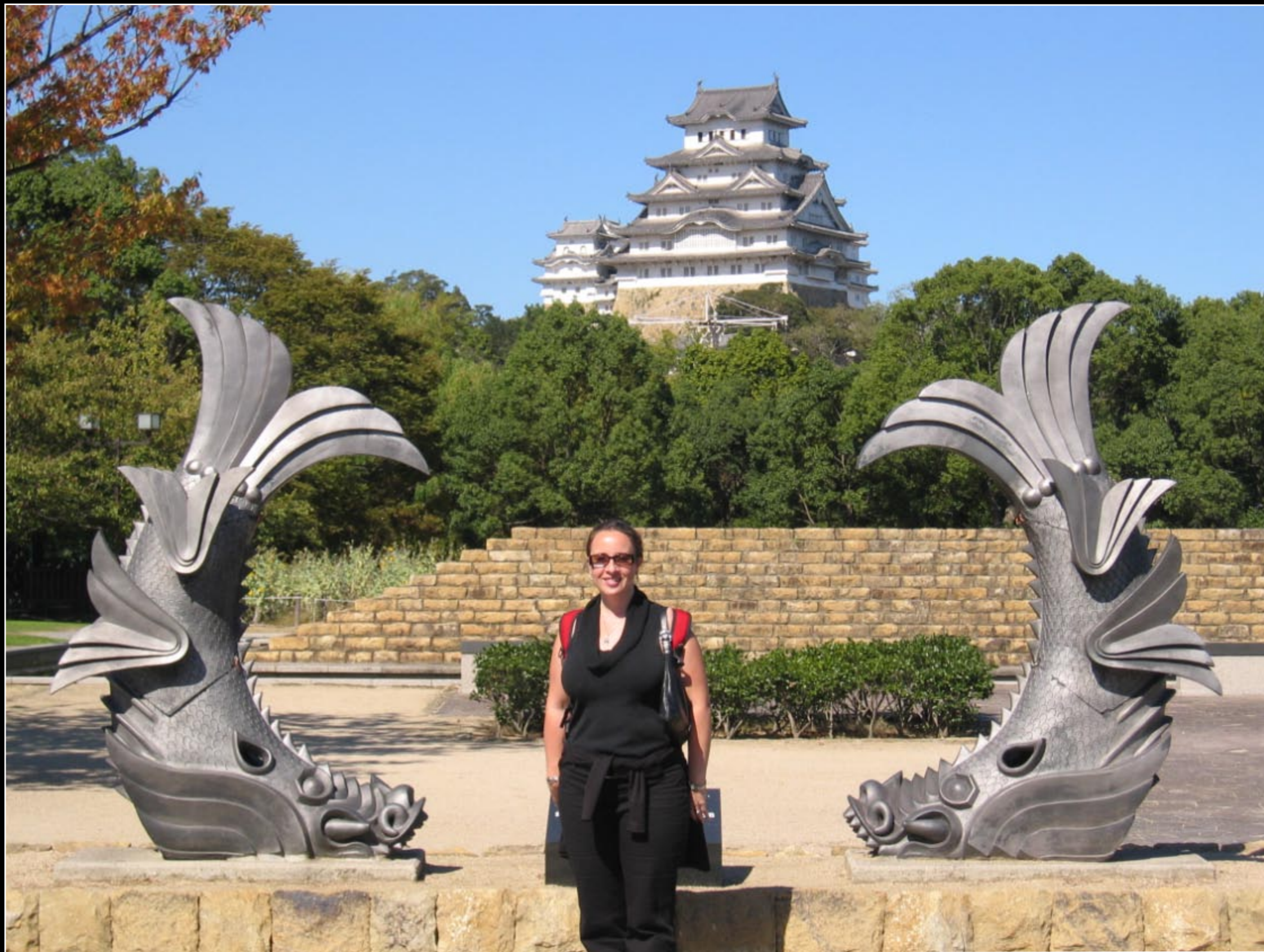
The "White Egret" Castle in Himeji