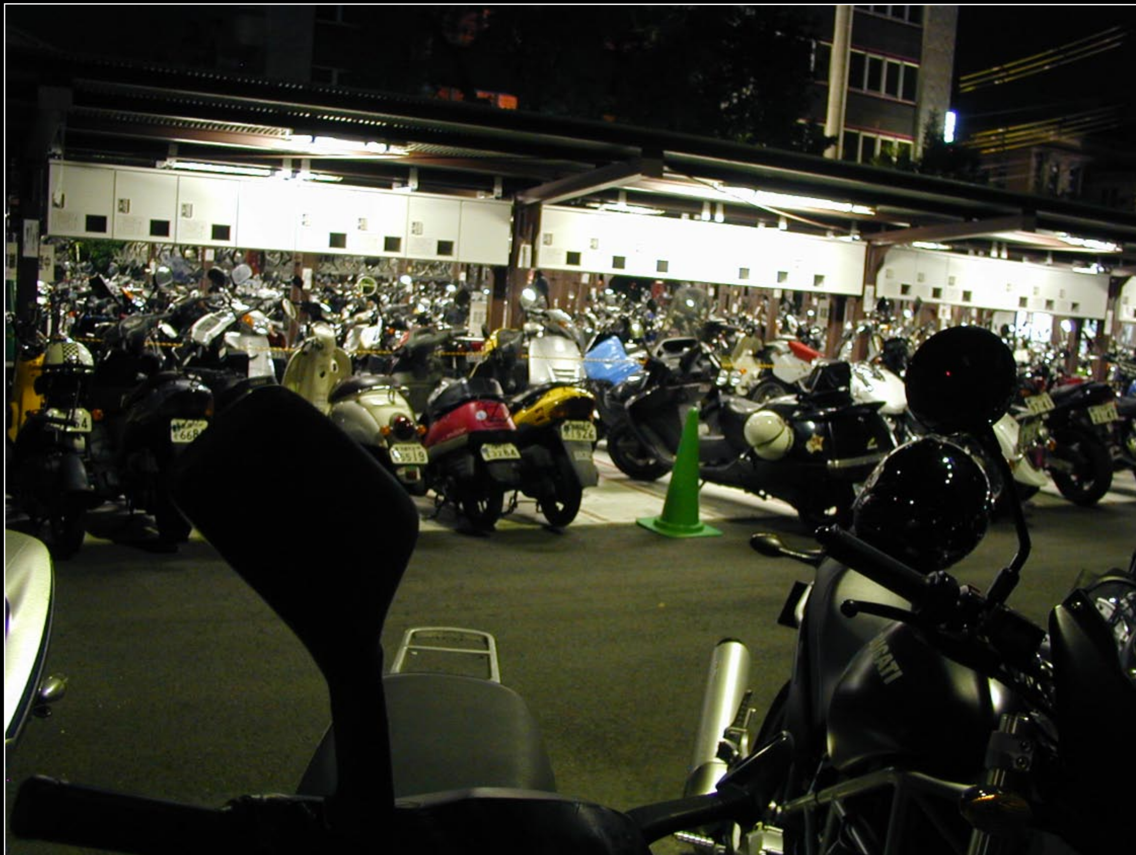
Scooter parking lot.