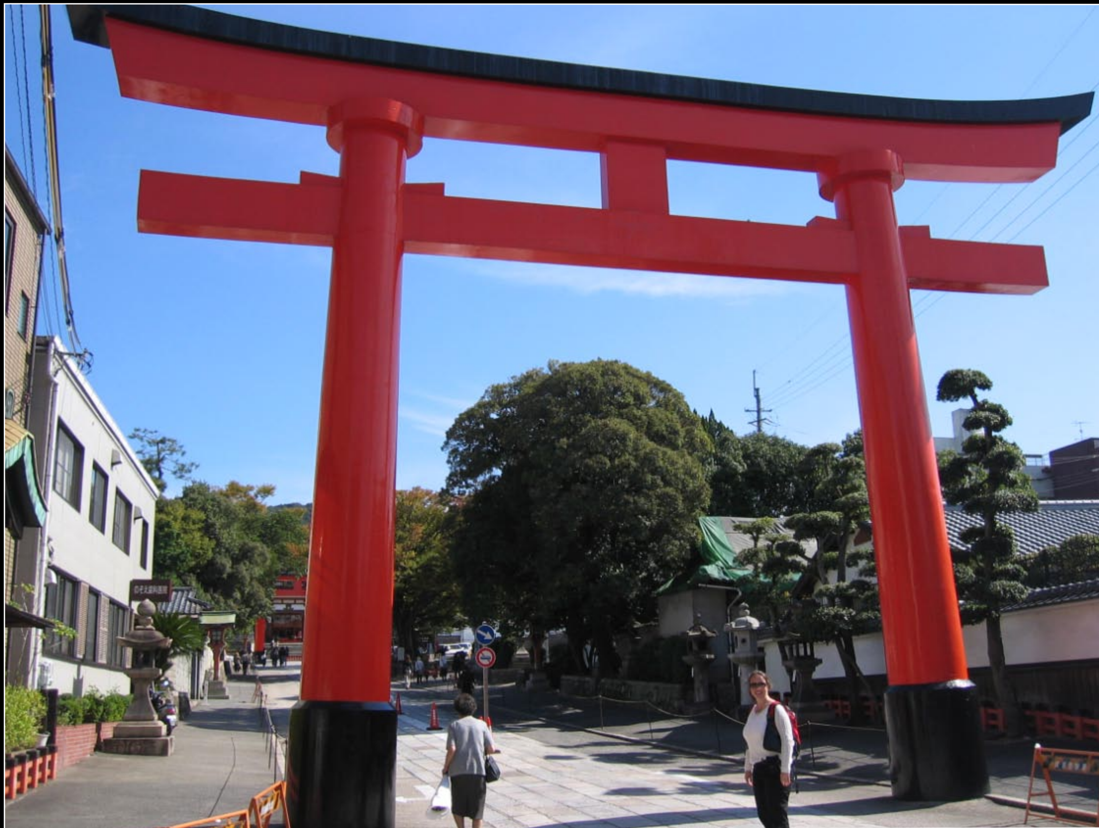
Day 10. Torii gate at the Fushimi-Inari Taisha in Kyoto.