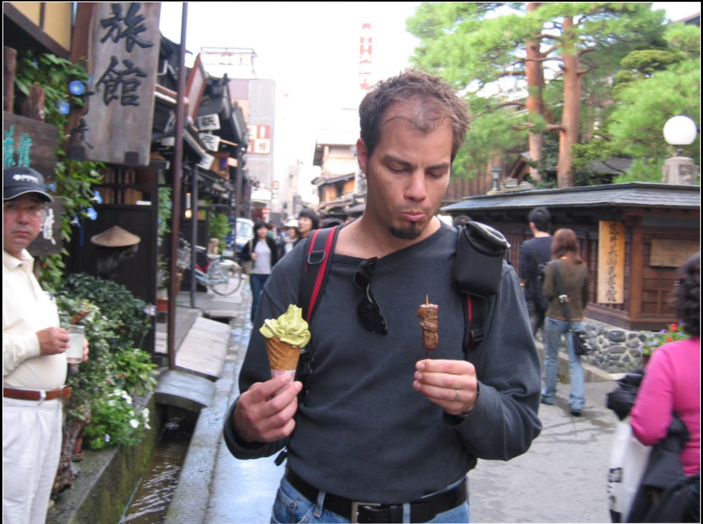
Day 8. Mmm. Green tea soft serve and Takayama Hida beef skewer.