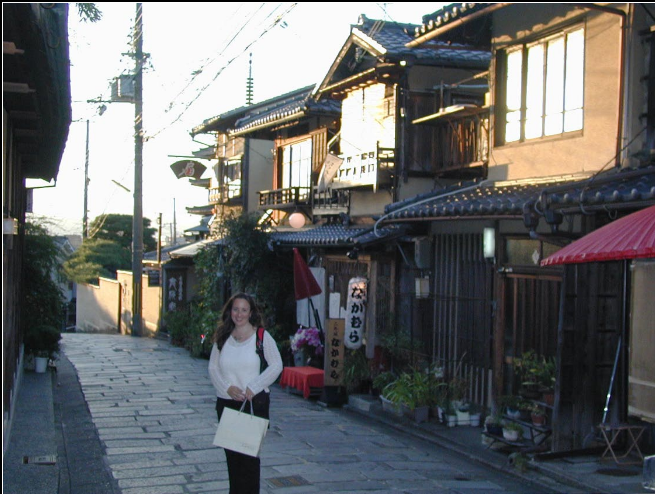
Sunset in Kyoto