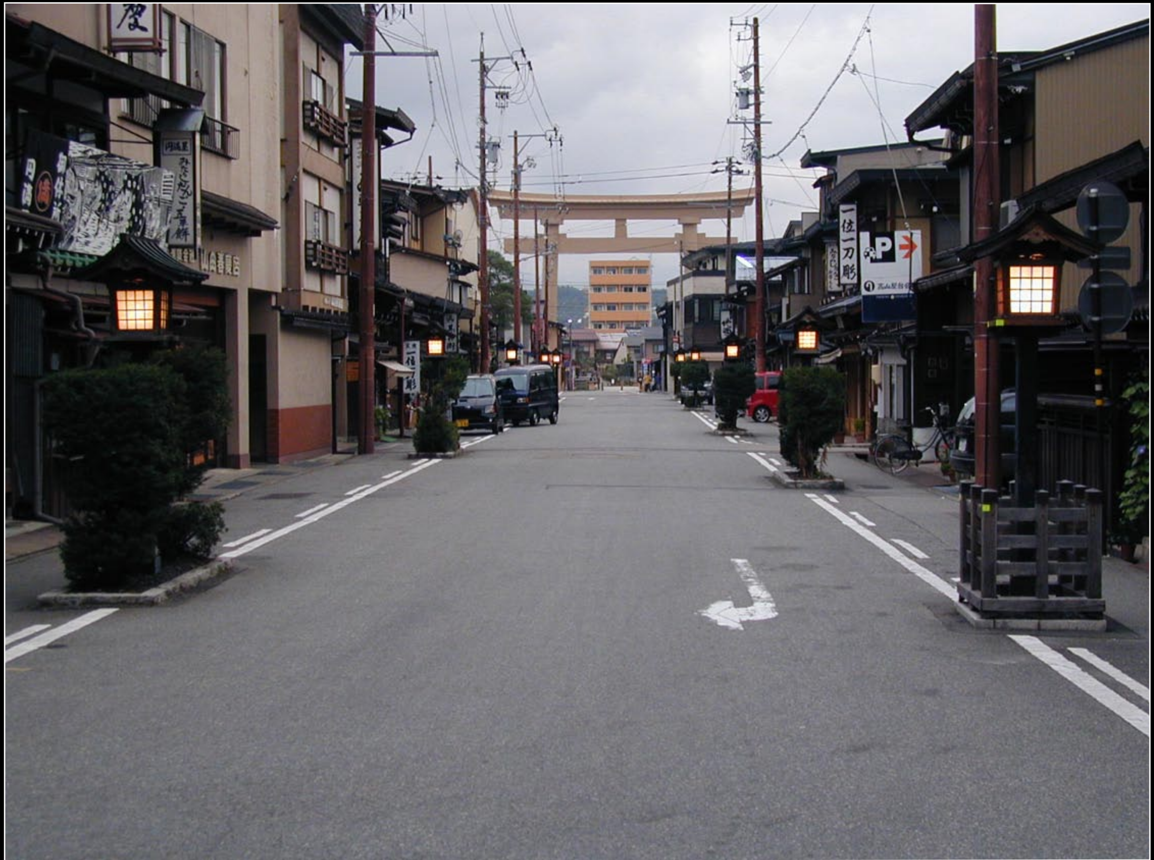
The back side of the temple gate.