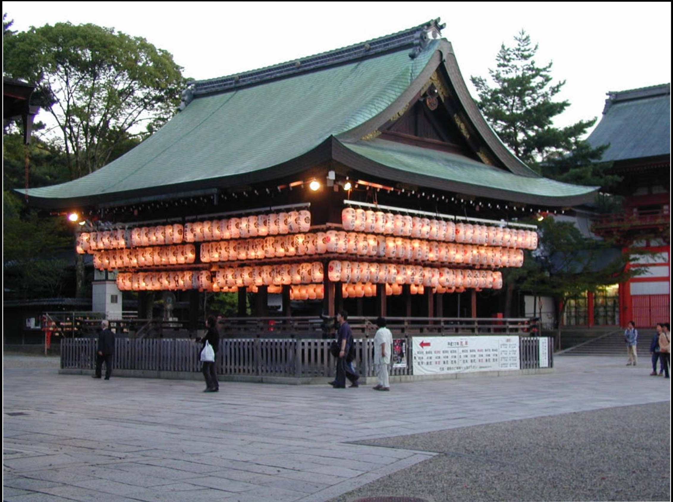
Part of the Yasaka Shrine in Kyoto.