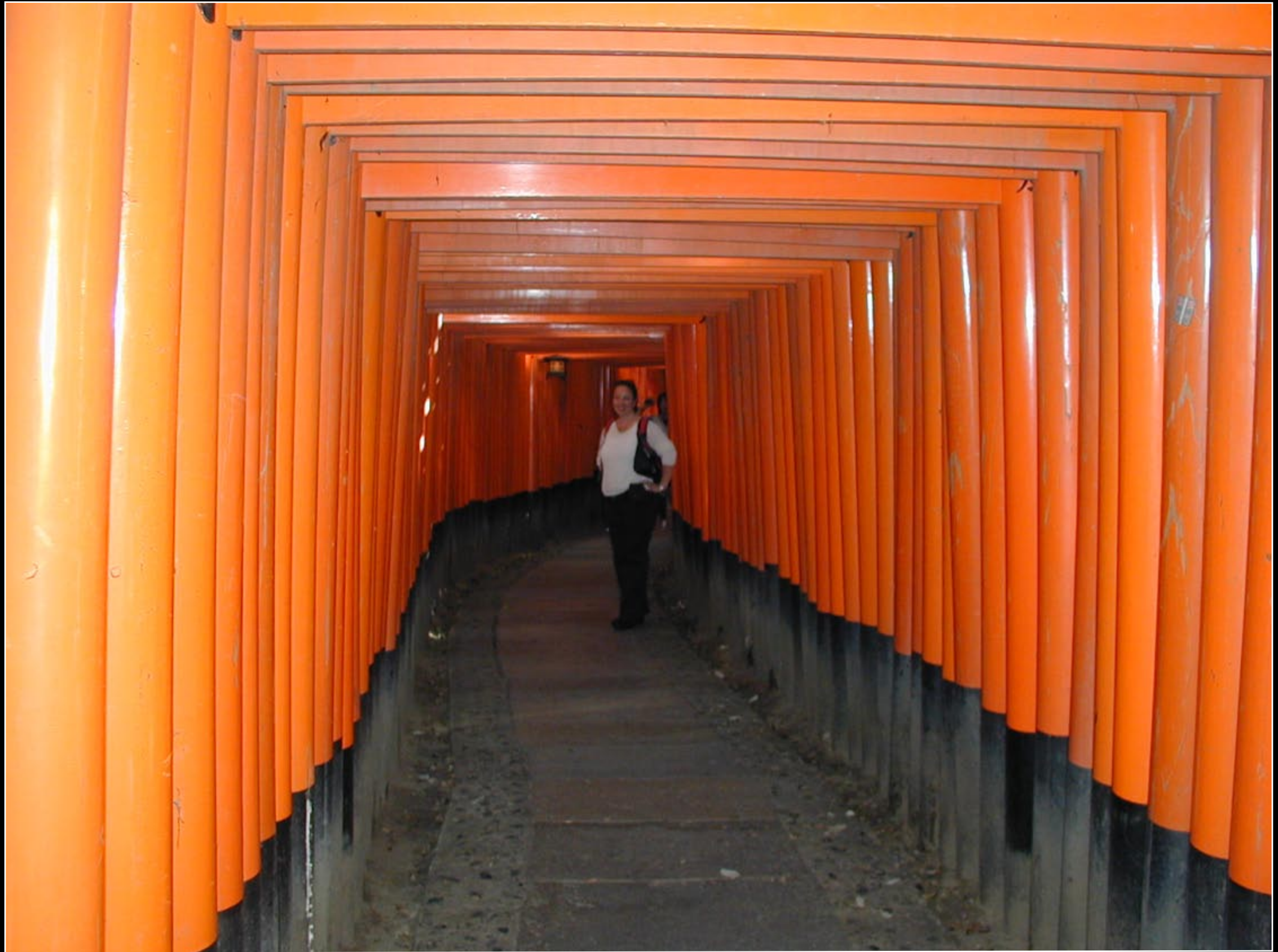
The first of hundreds of torii gates on the hike up the hill.