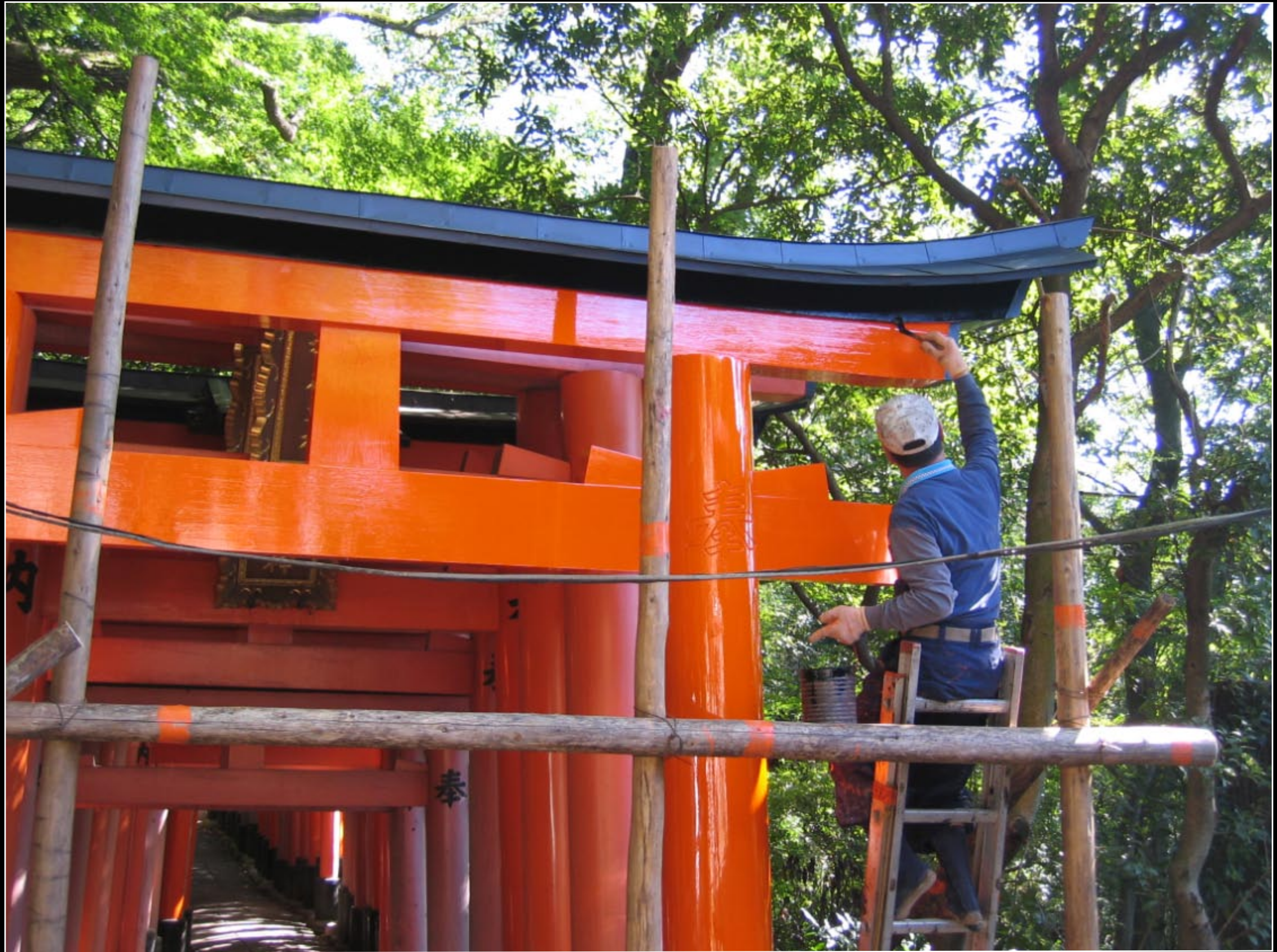
The gates require constant care and replacement.