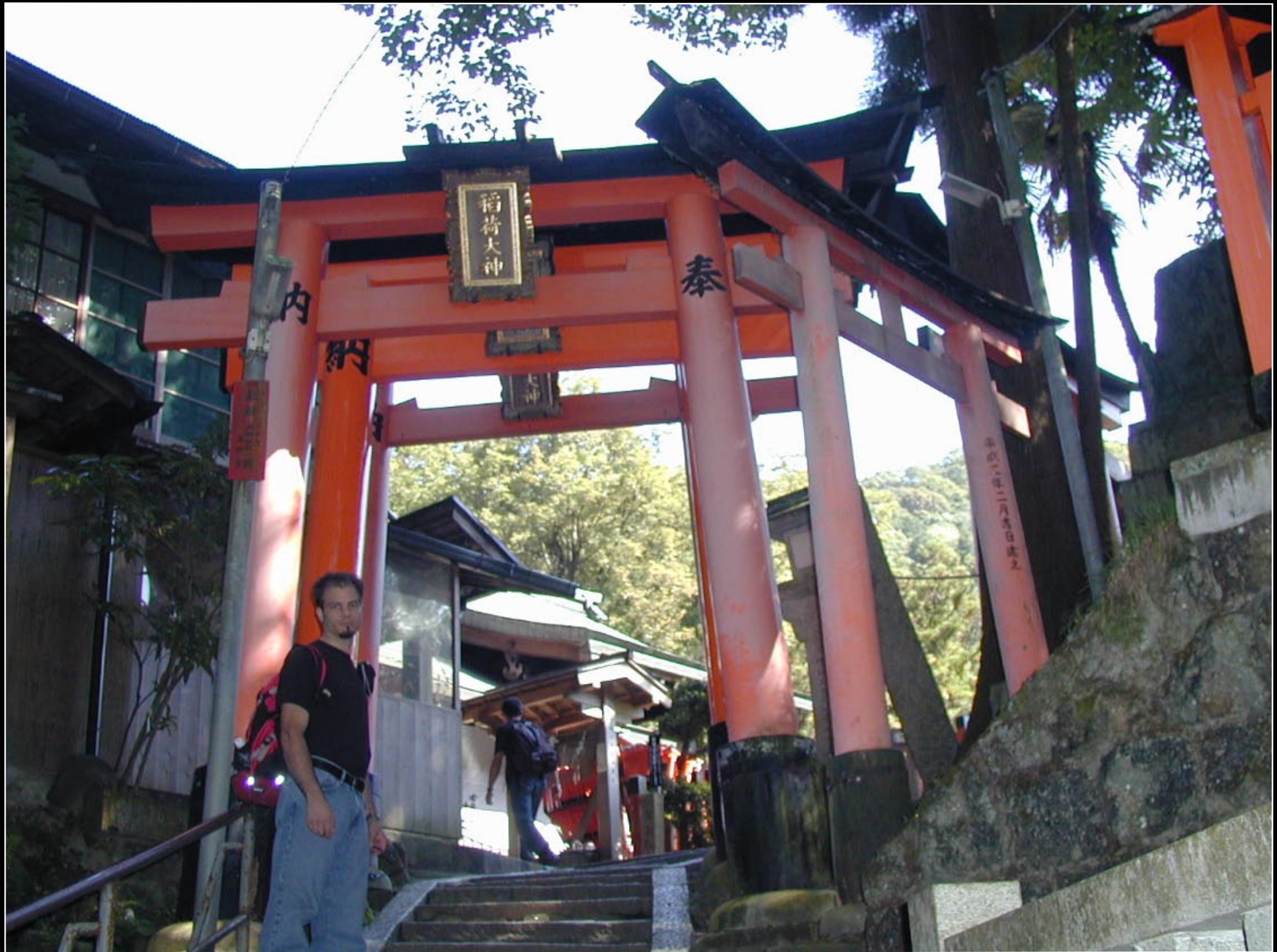
A shrine along the way to the top. Shops sold offerings.