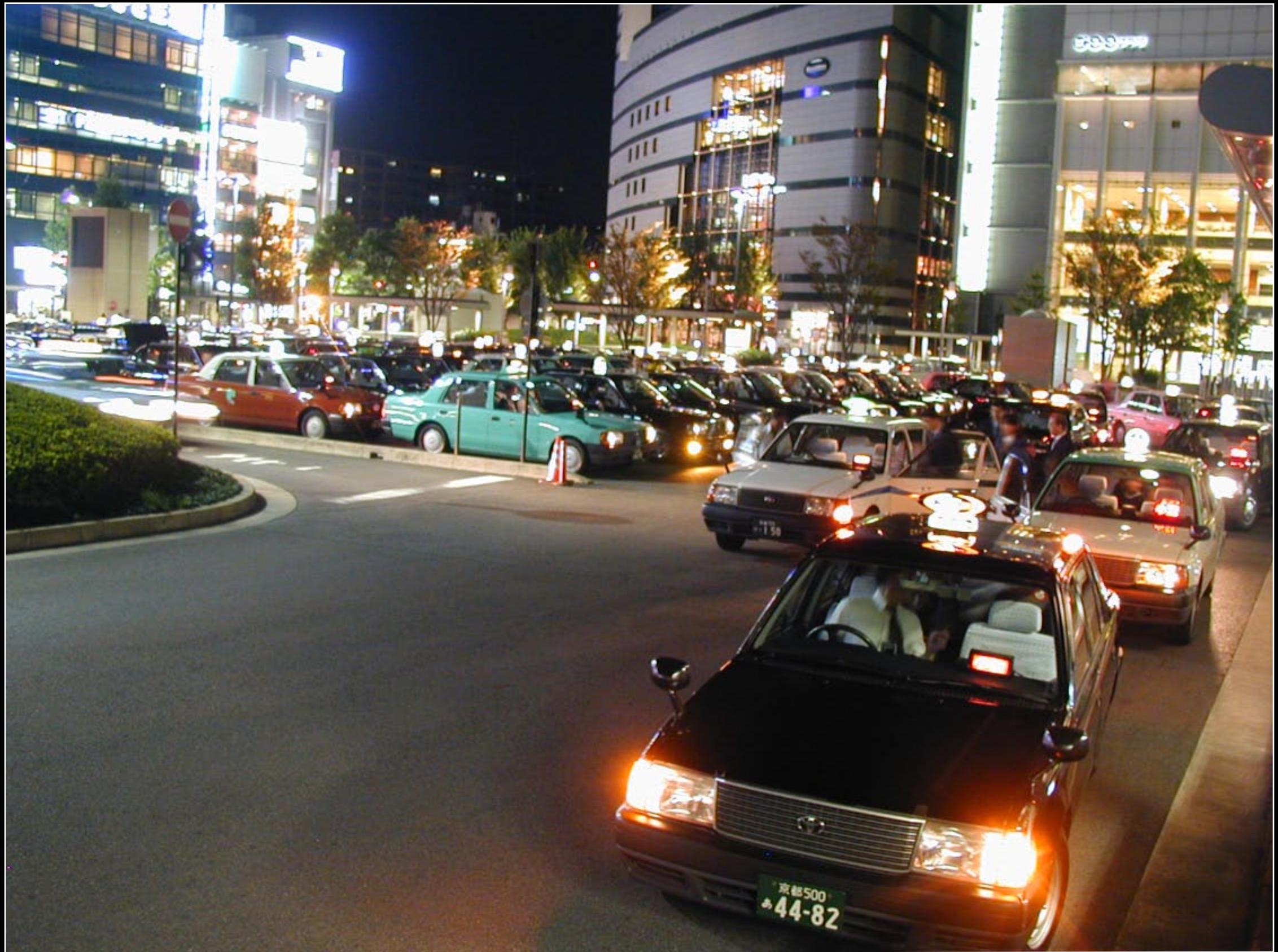
Whole lotta taxis at the Kyoto train station.