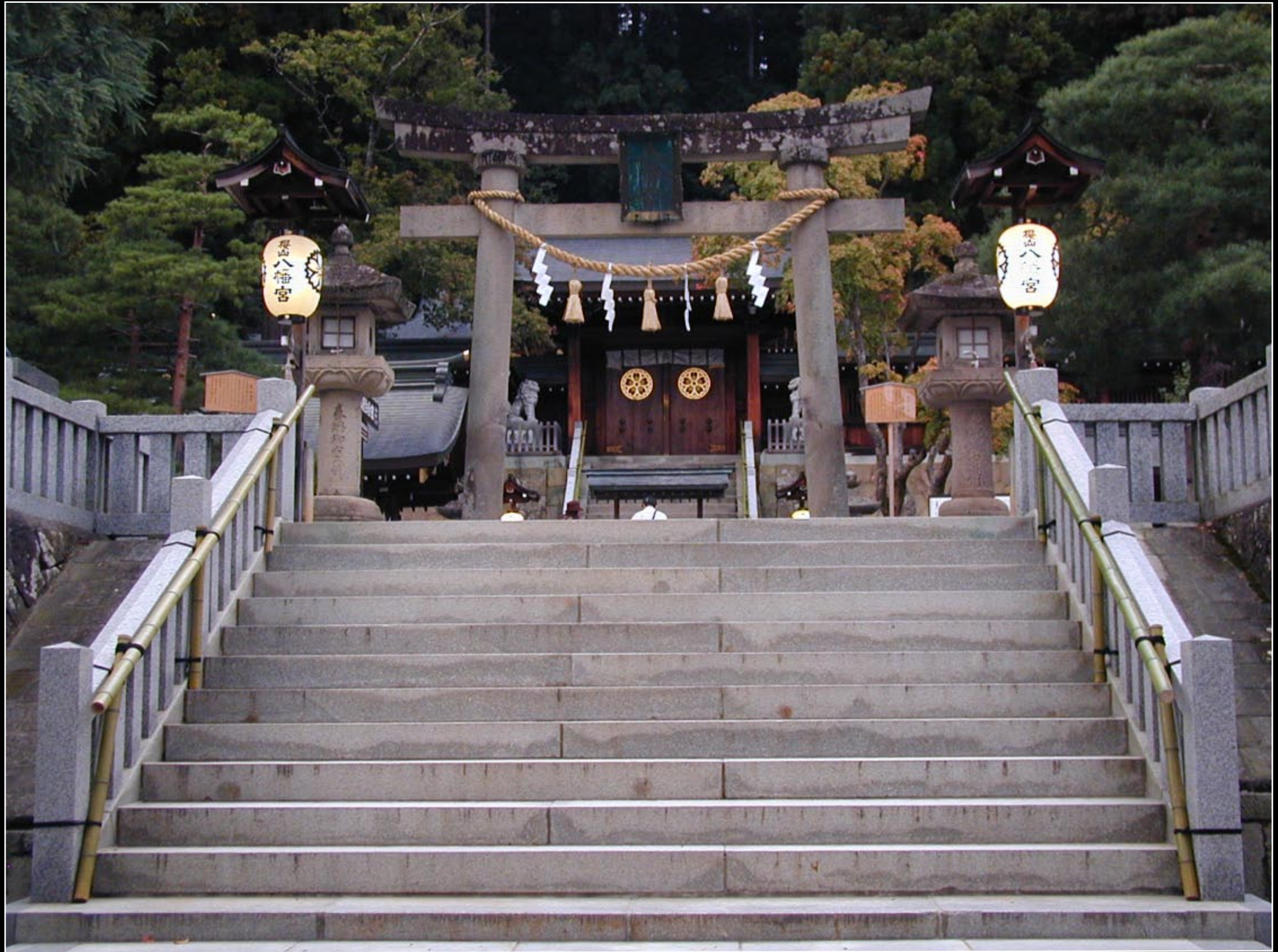
Dusk begins to fall.