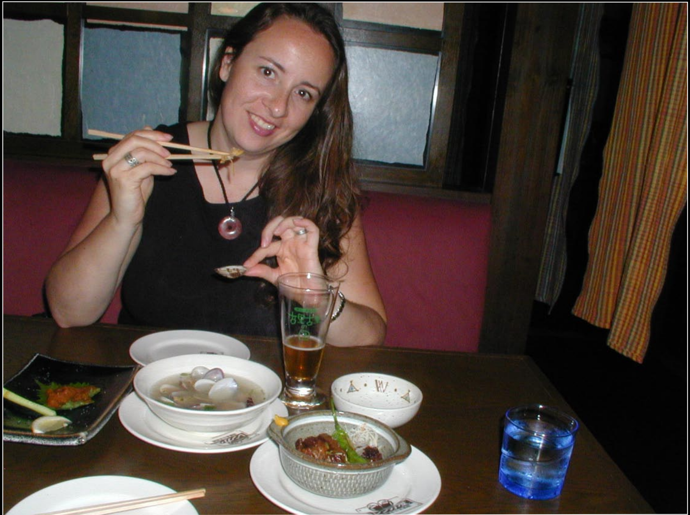
Delicious izakaya (pub) food. Clams in sake and BBQ pork.