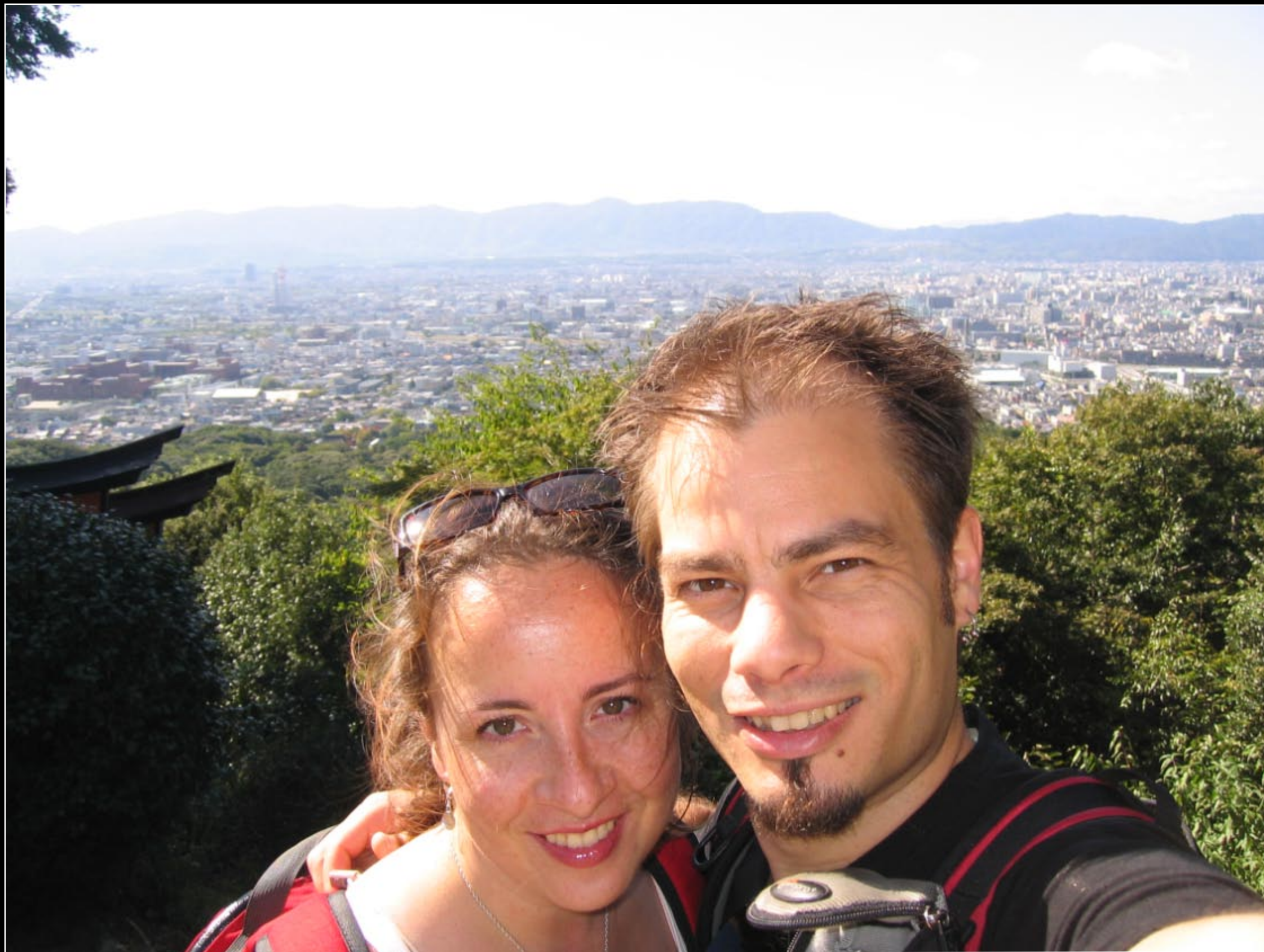
View near the top.