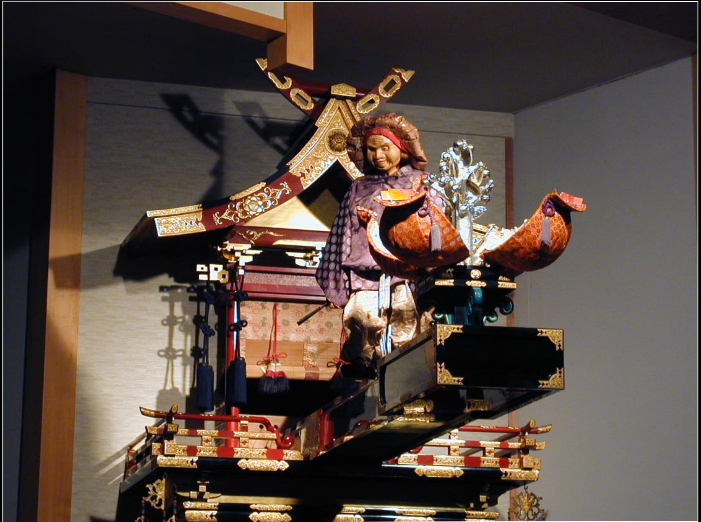
Karakuri puppets for traditional parade floats.