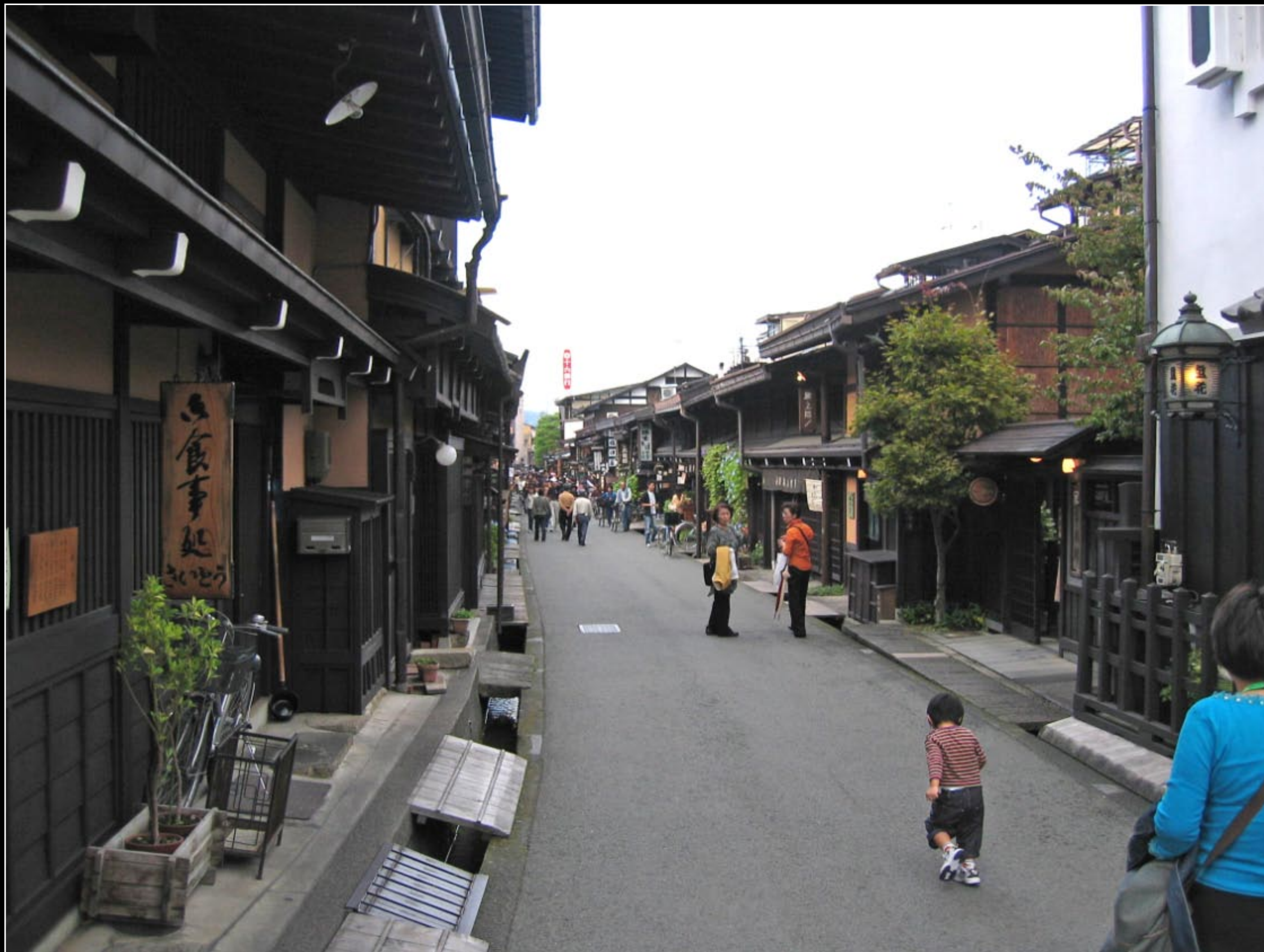
Another view of the shop street.