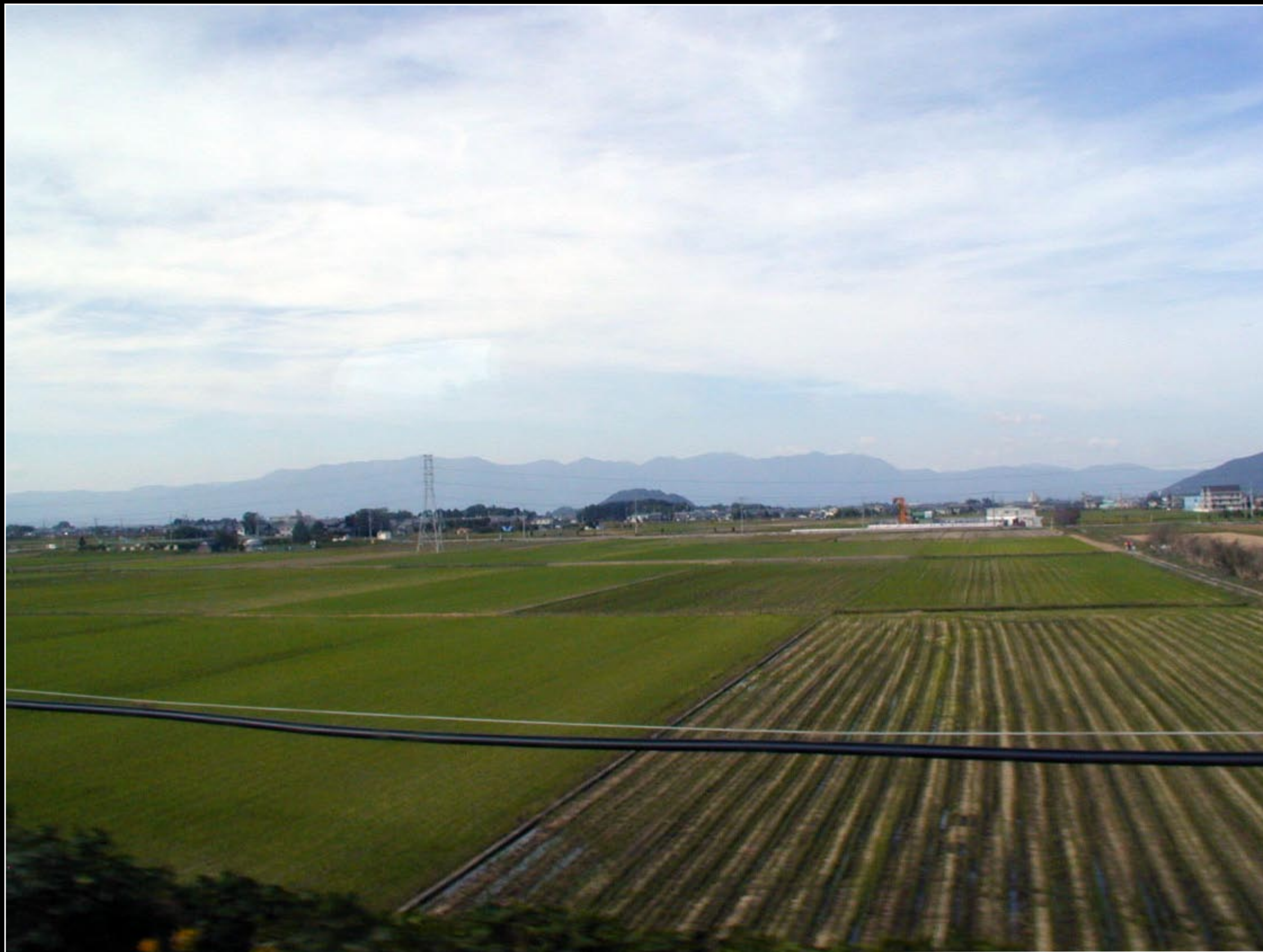
Rice fields as viewed from the train. We passed lots of these.