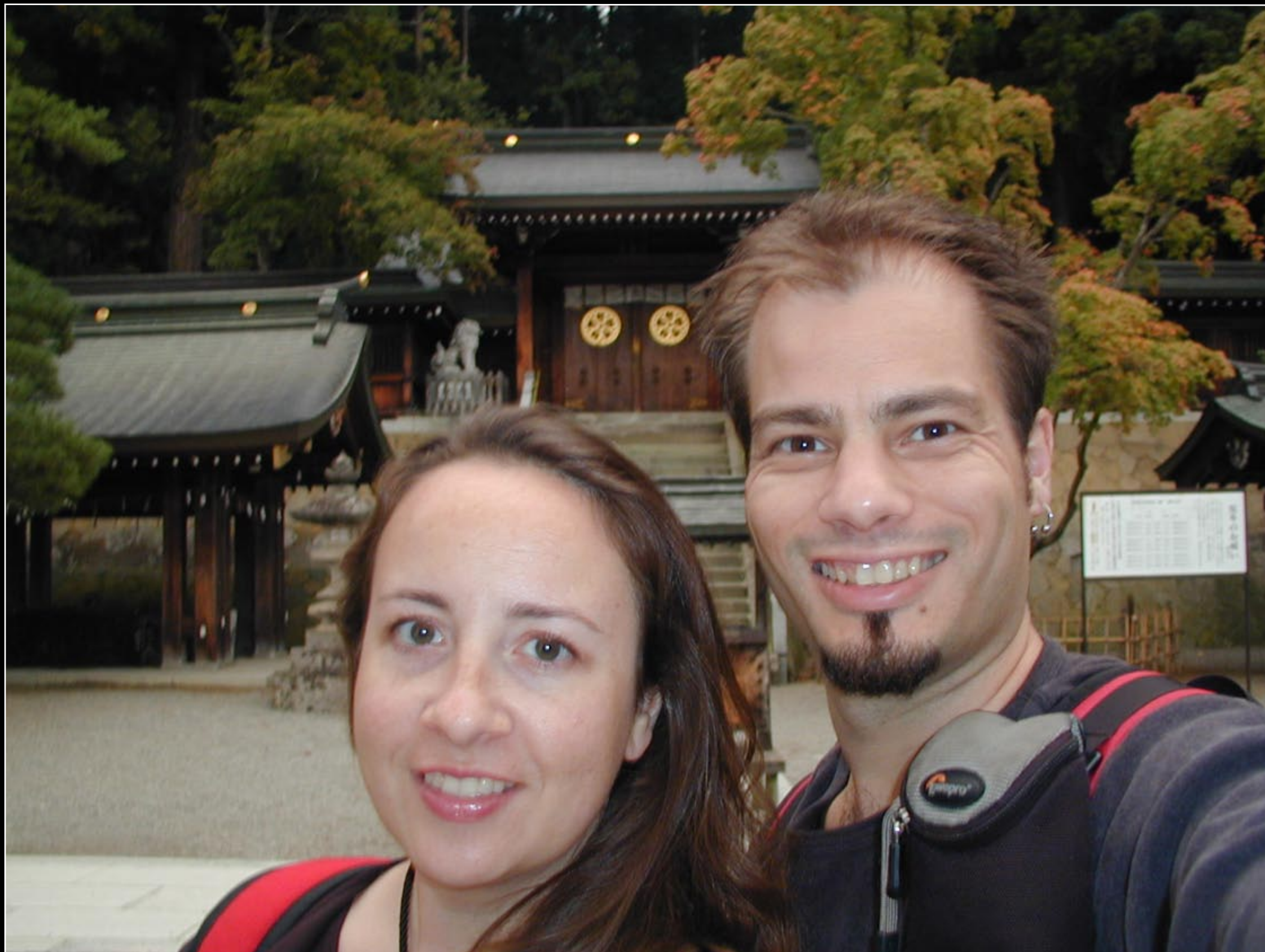
In Takayama, a full scale model of a Nikko shrine