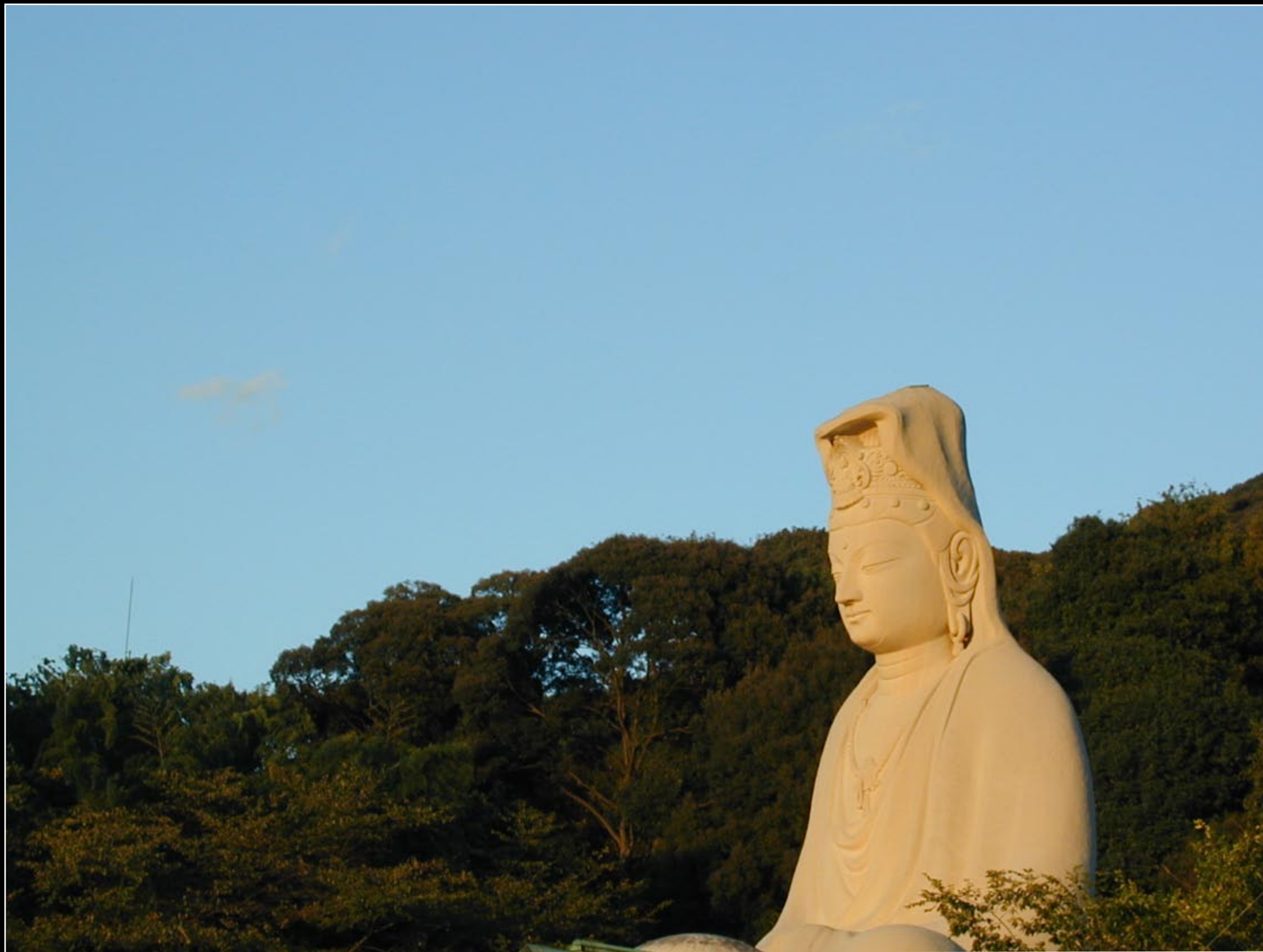
Buddha at the Higashi Otani Museum.