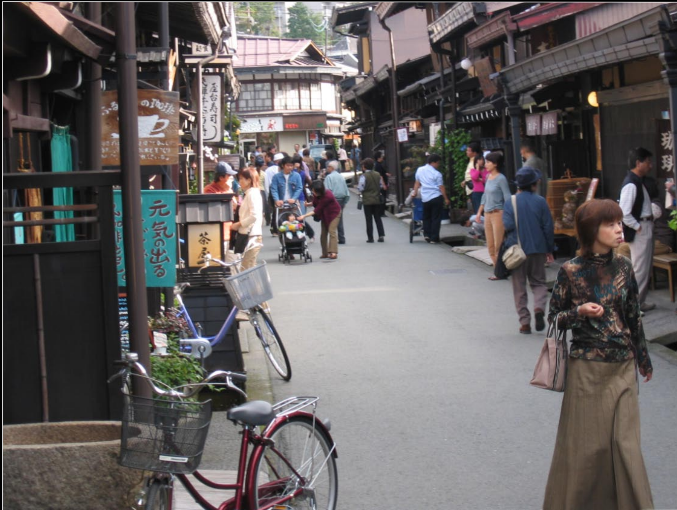
Sanmachi District shops in Takayama with sake and miso shops.