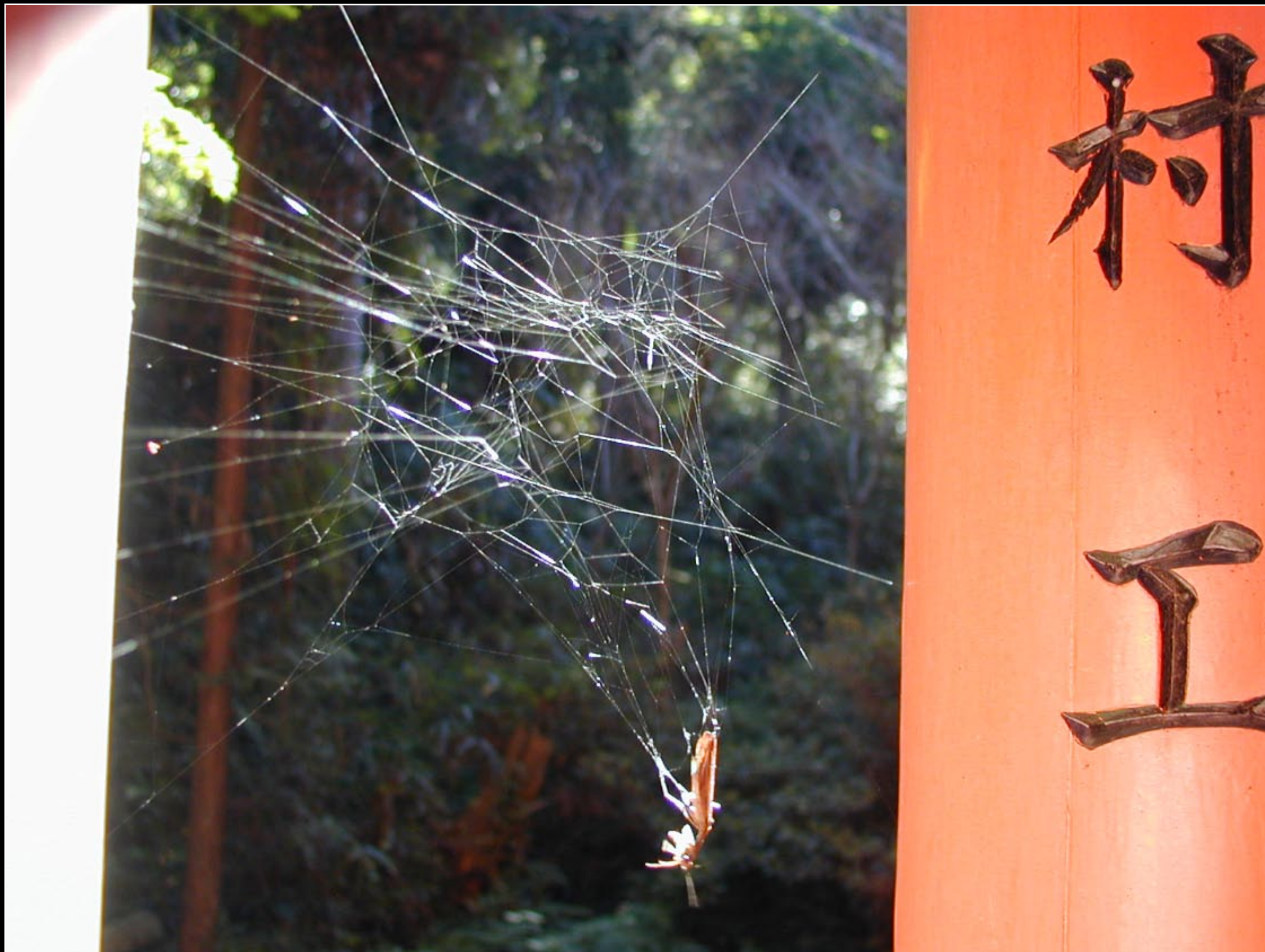
Live bug caught in an old net. We saved it.