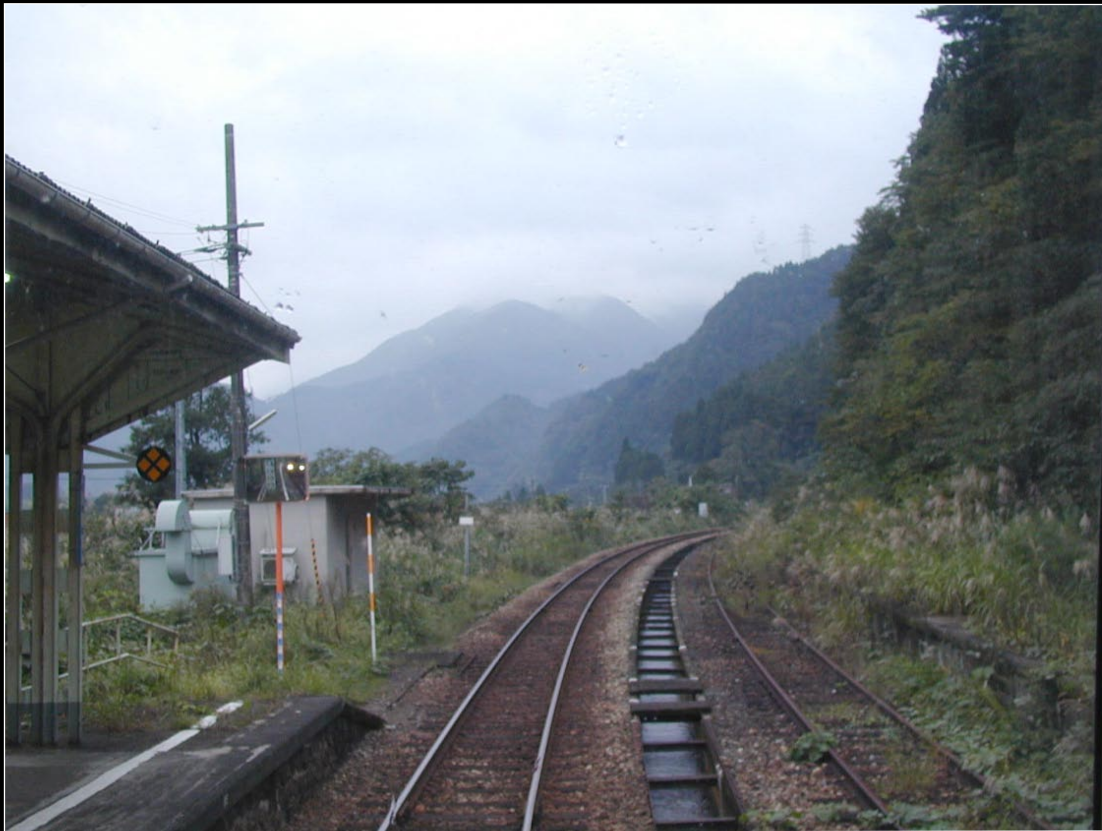
Train thru the mountains to Takayama. Almost missed this train!