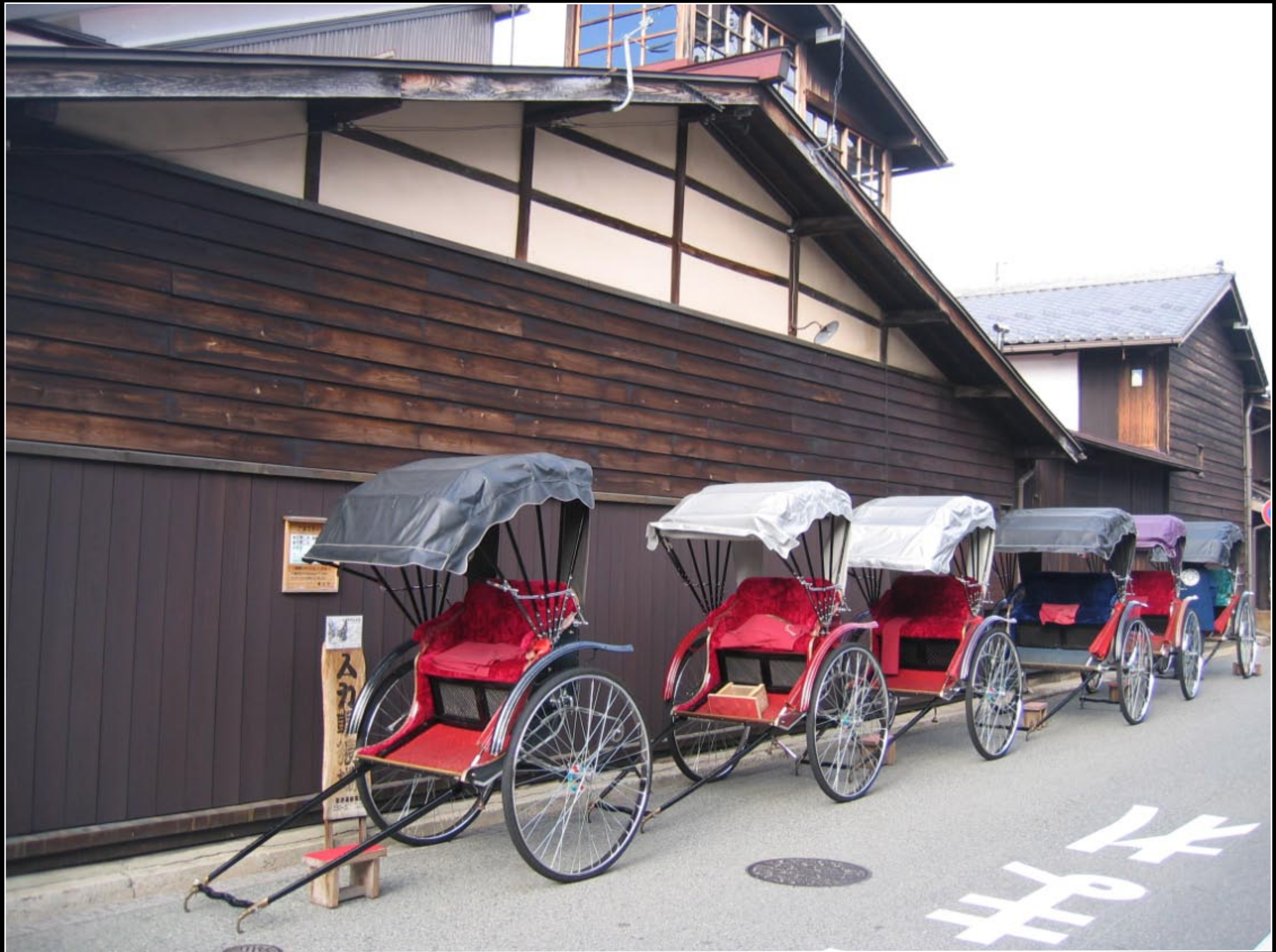
Rickshaws. The drivers wore special lobster-toe shoes.