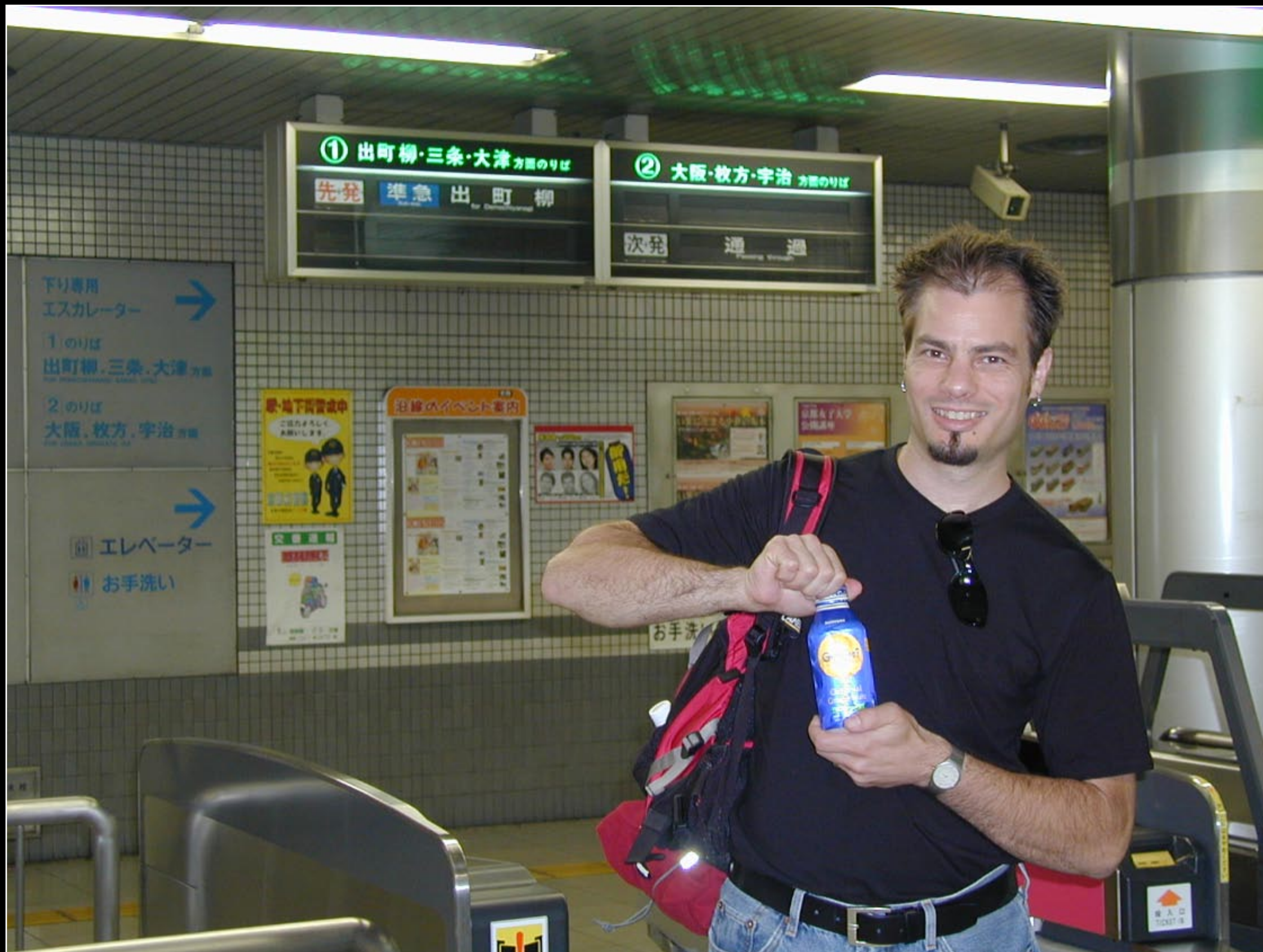
I finally found a drink machine with the good grapefruit juice!