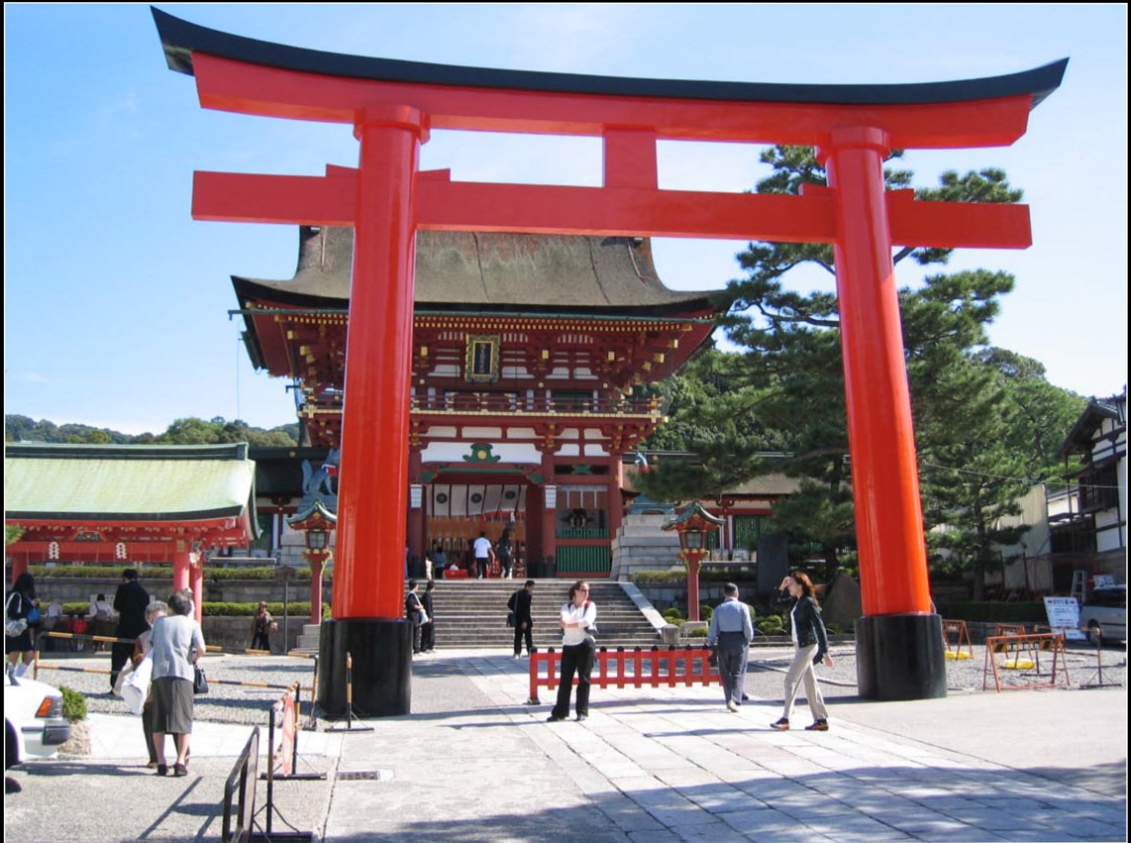
The temple at the bottom of the hill.