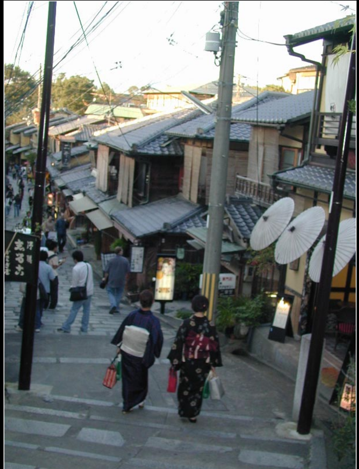
Women in formal kimonos.