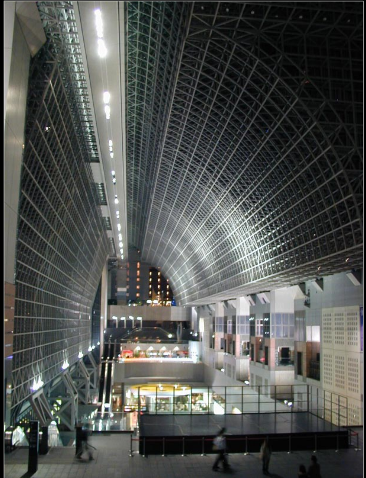
Kyoto train station