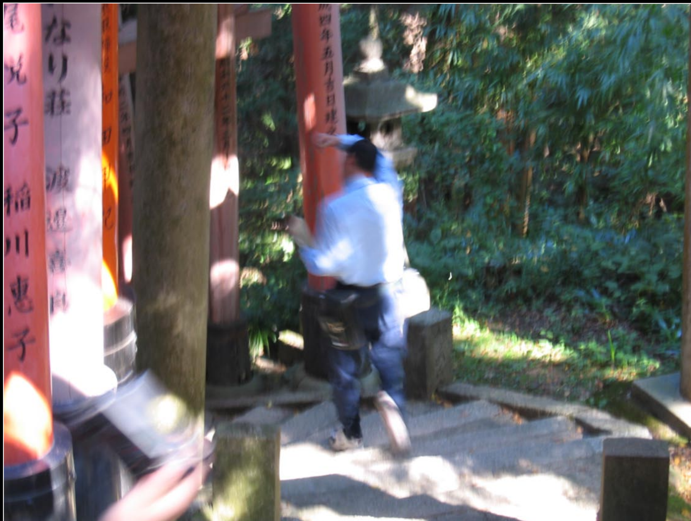
Mailman. Tough route!