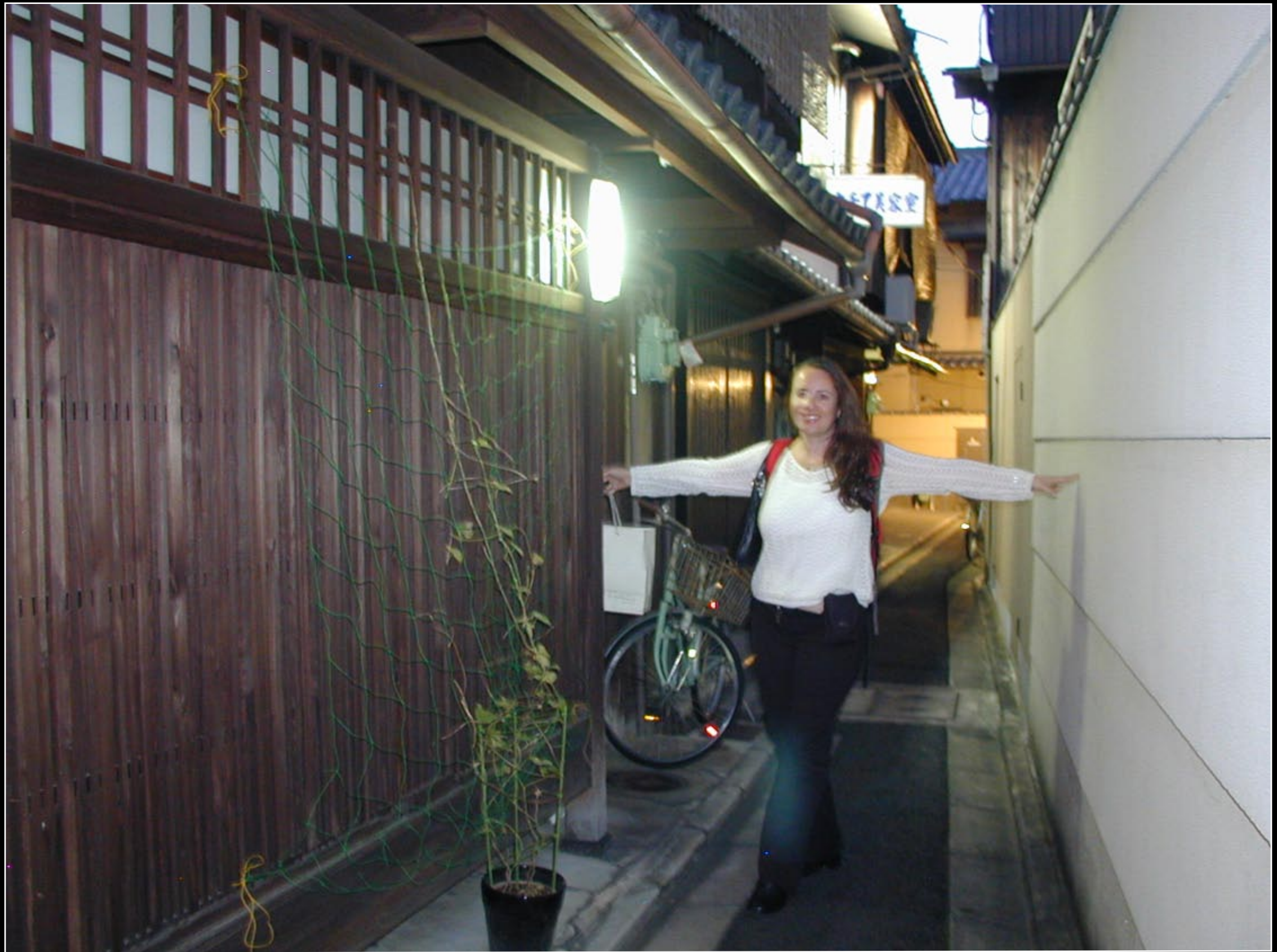
Really narrow street in the Gion district.