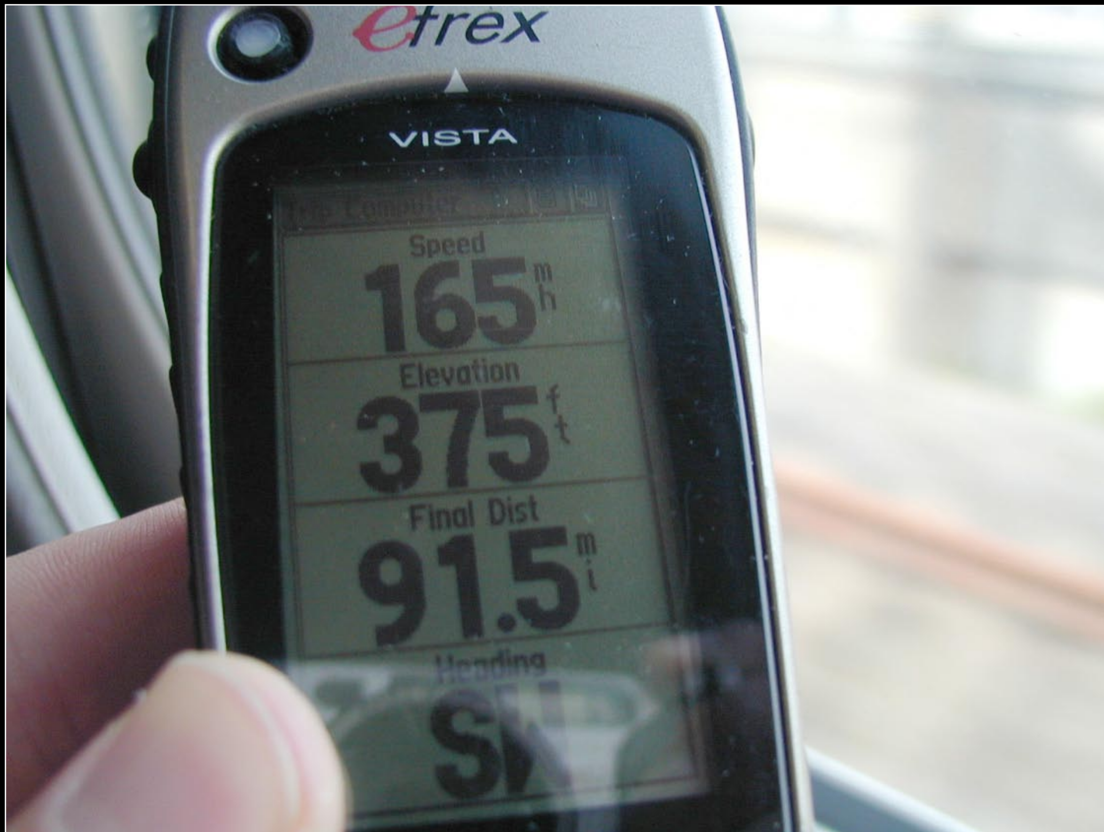
Cruising right along on the shinkansen to Kyoto.