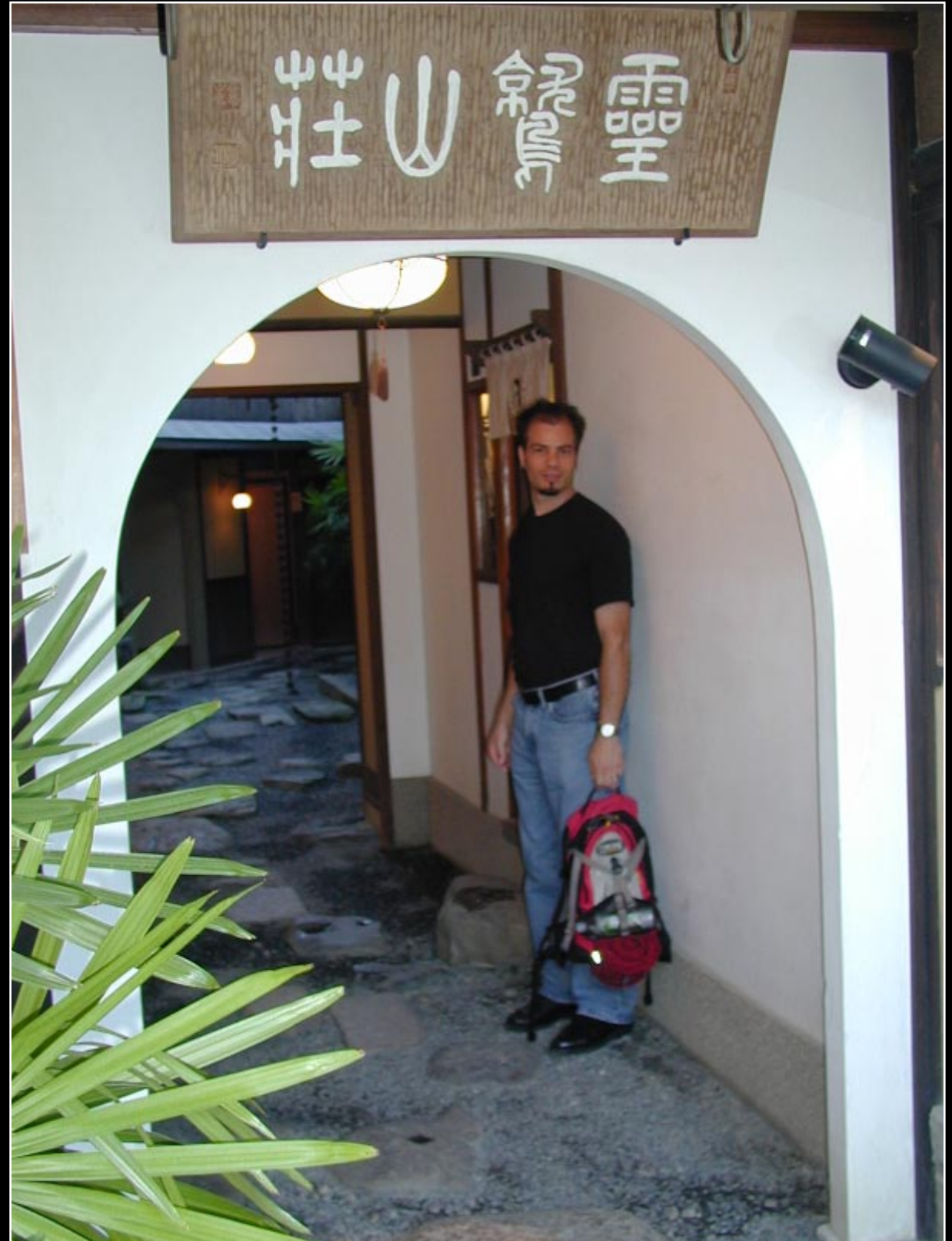
Small side street in Kyoto