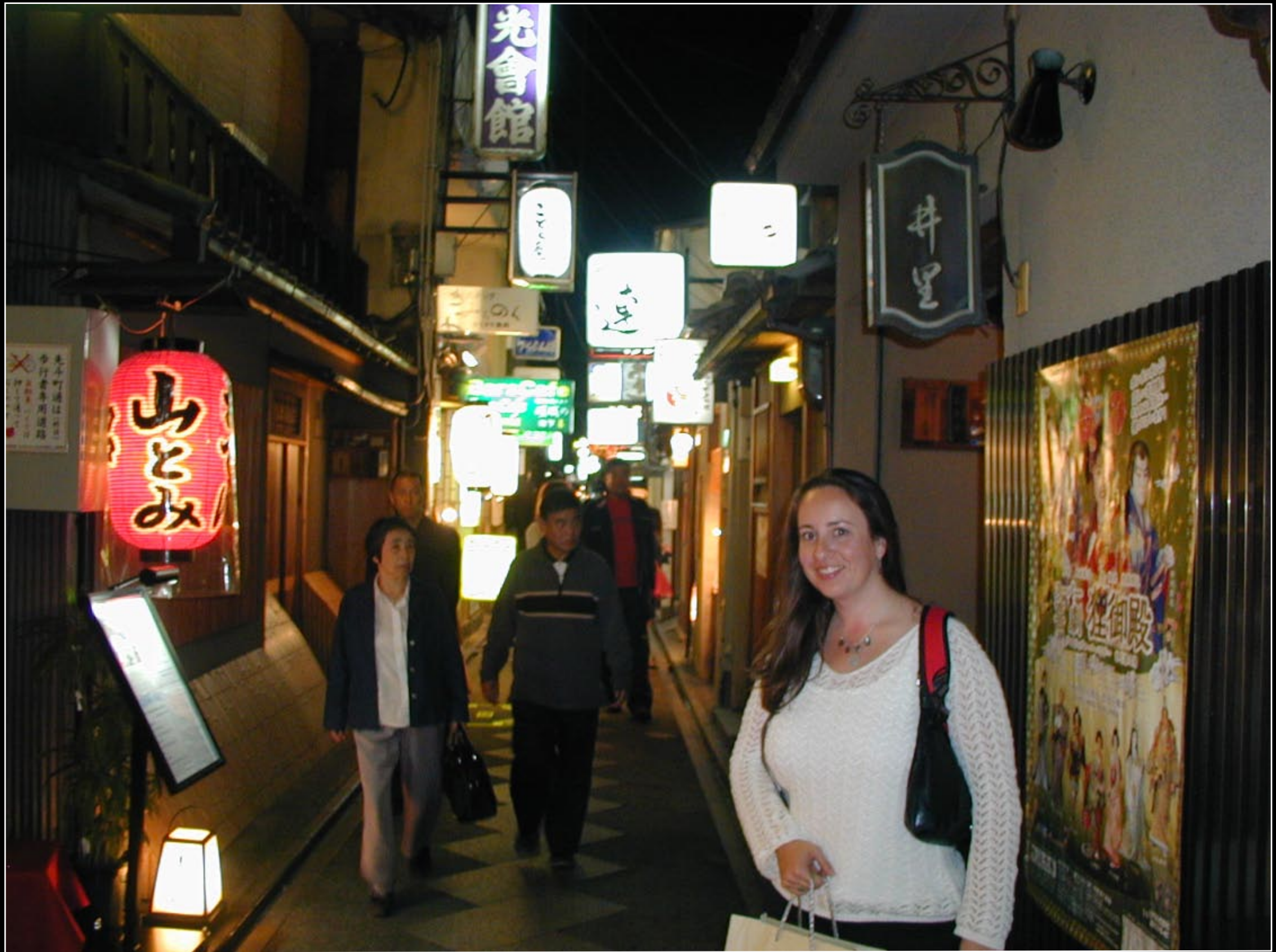
Lots of food on this Kyoto street.