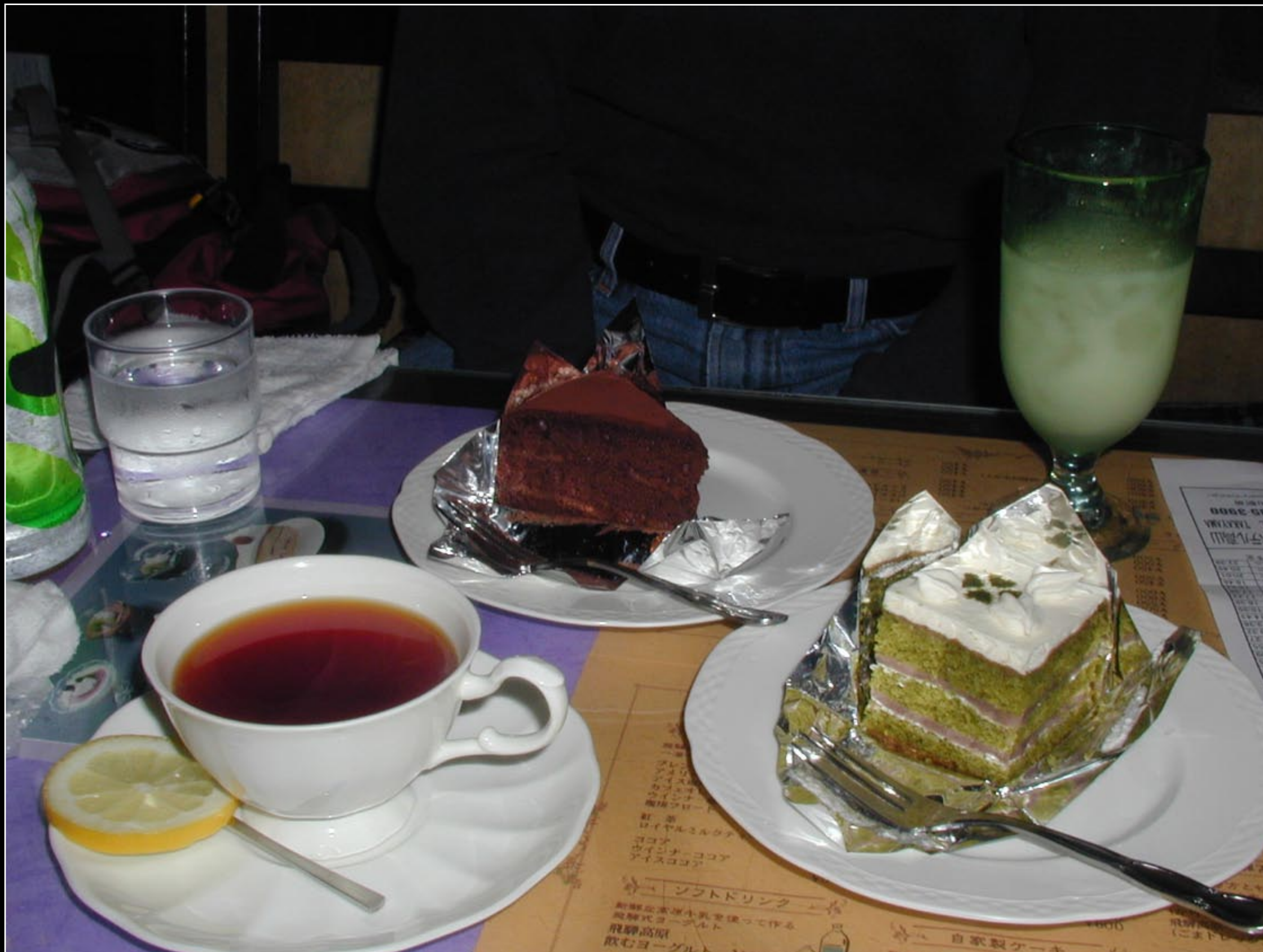
Green tea cake with red bean paste and yummy pear drink.