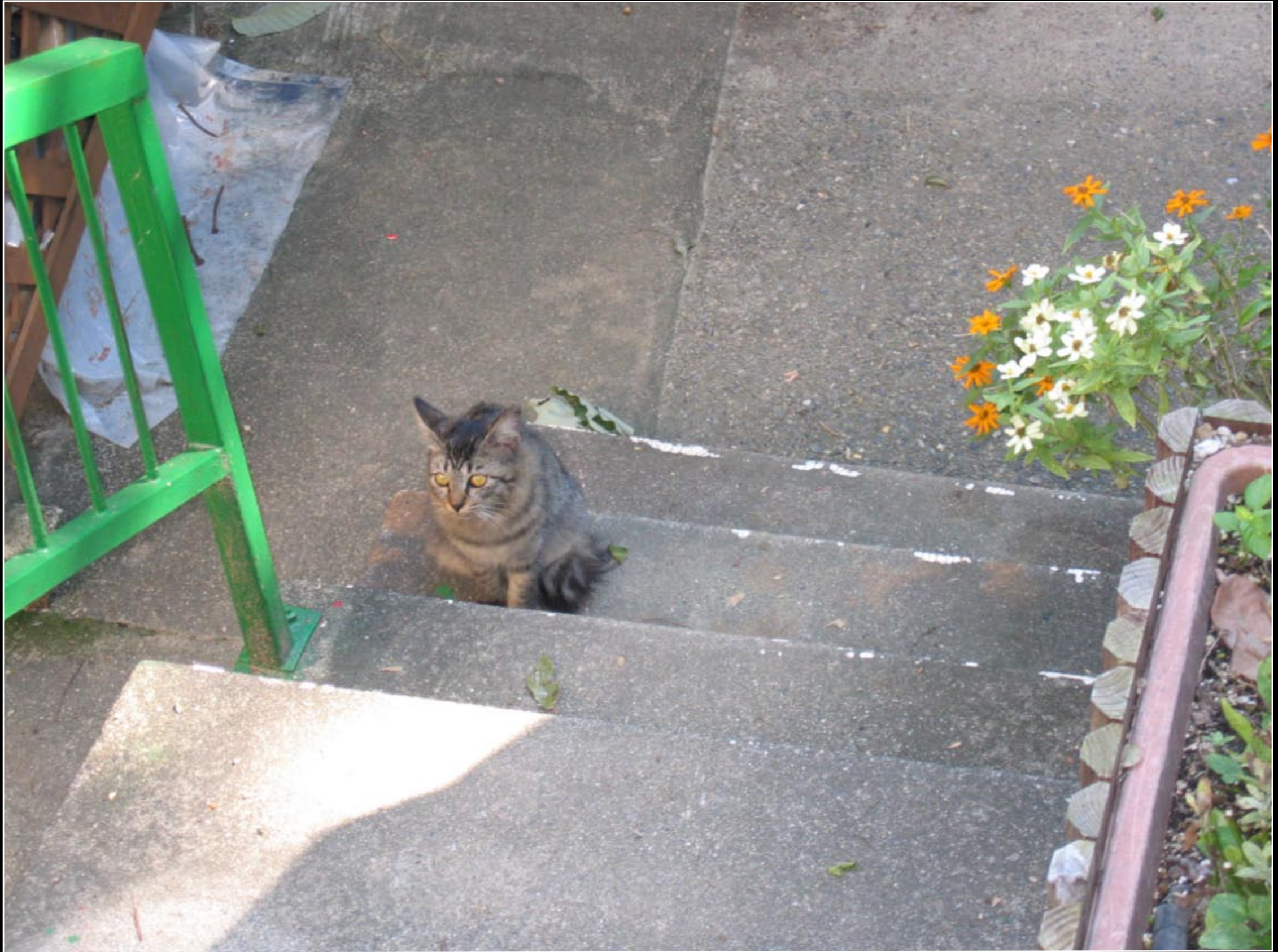
Lots of cats wandering around the shrines.