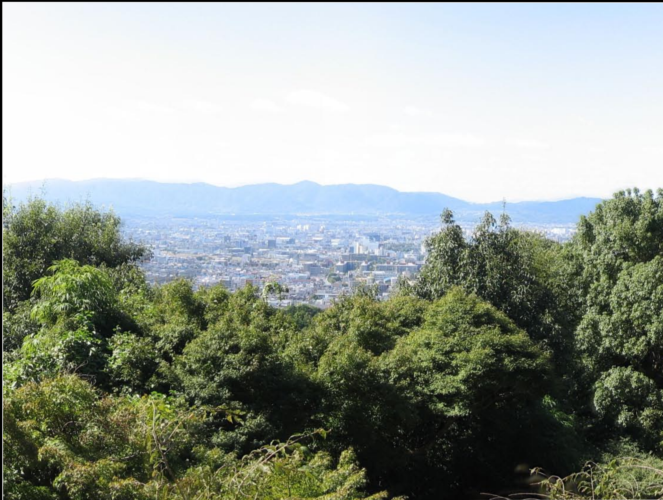
View of Kyoto on the way up.