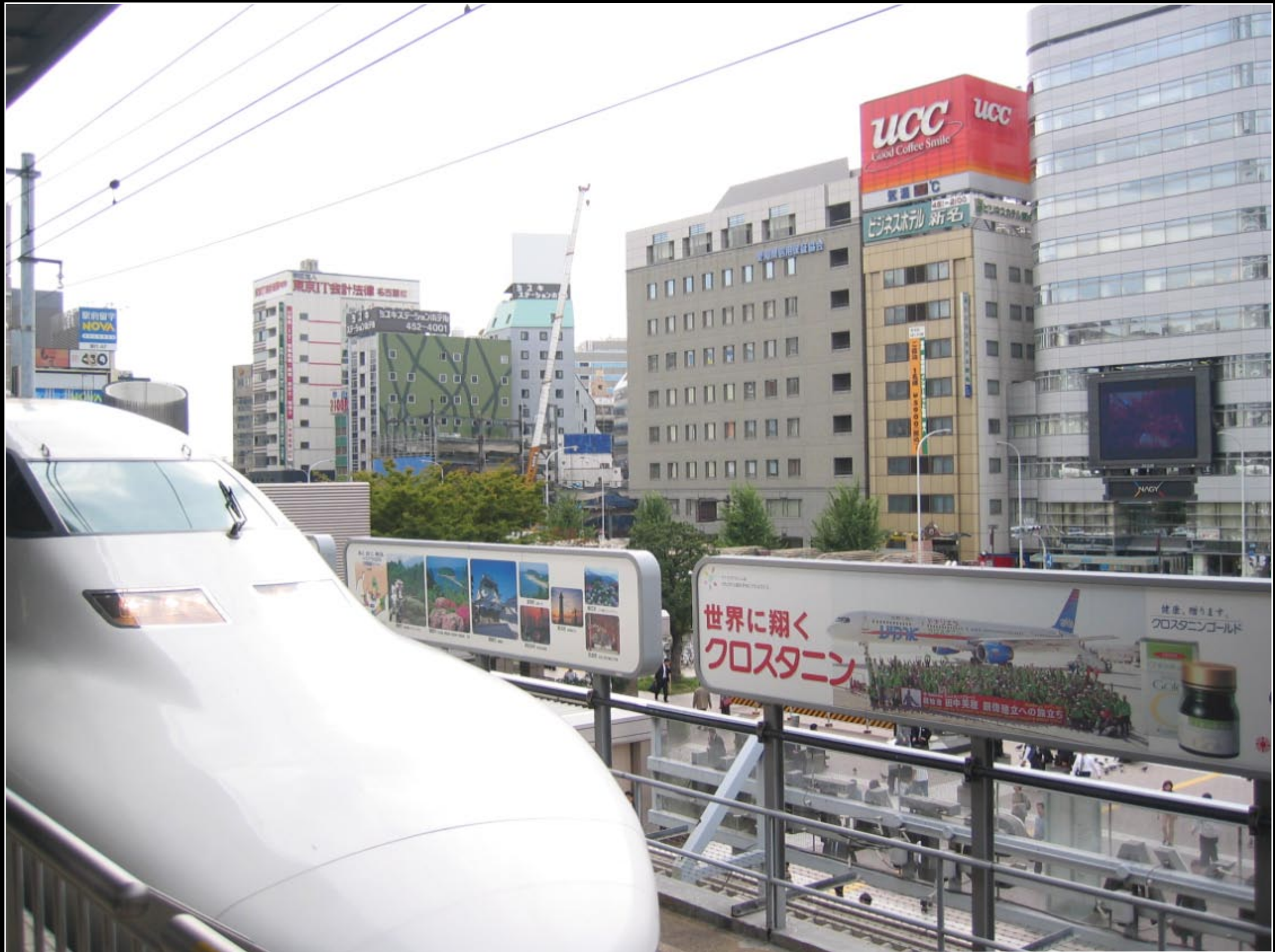
Day 9. Front of a shinkansen (bullet) train in Nagoya.