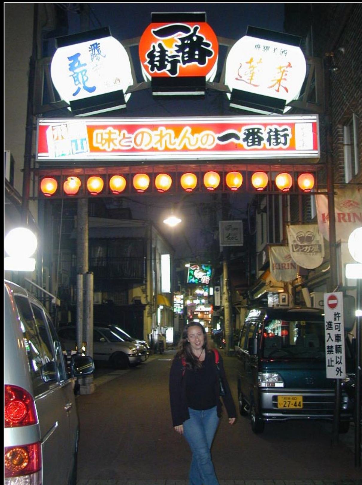
Night in Takayama