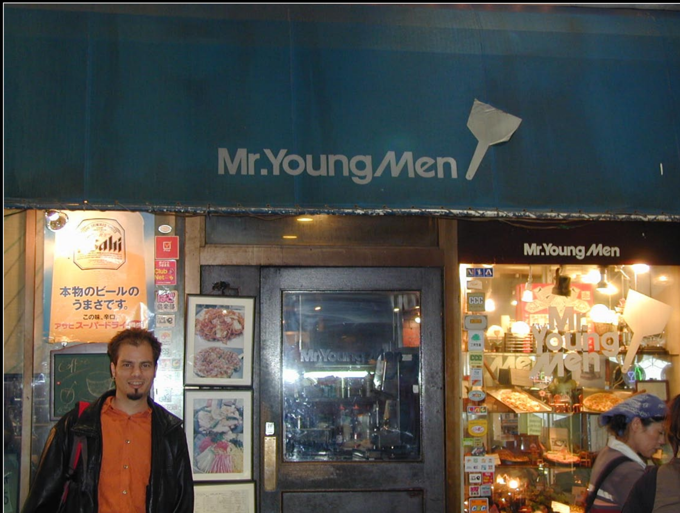
More amusing names.