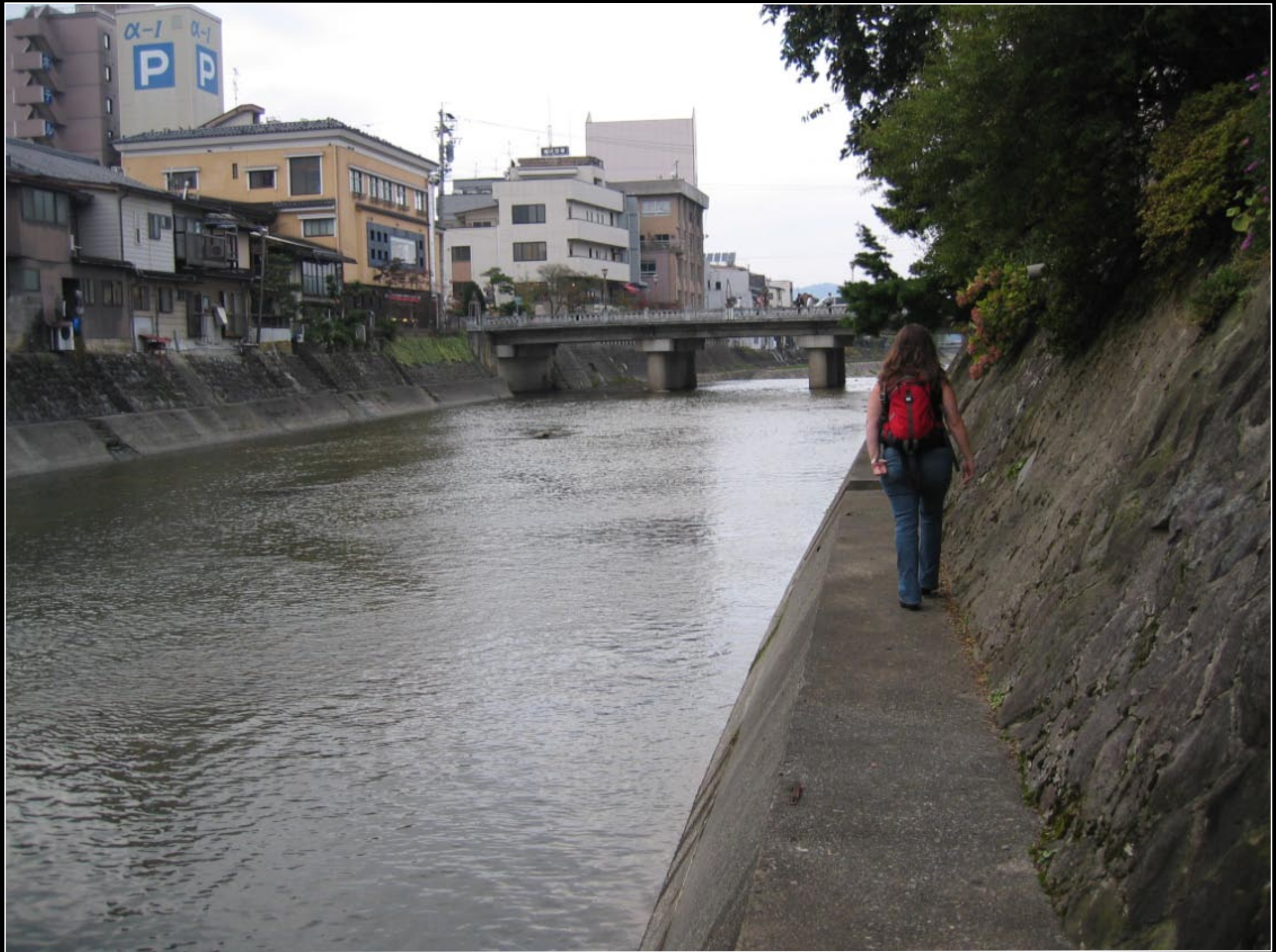
Miya River. Not sure if this is supposed to be a sidewalk.