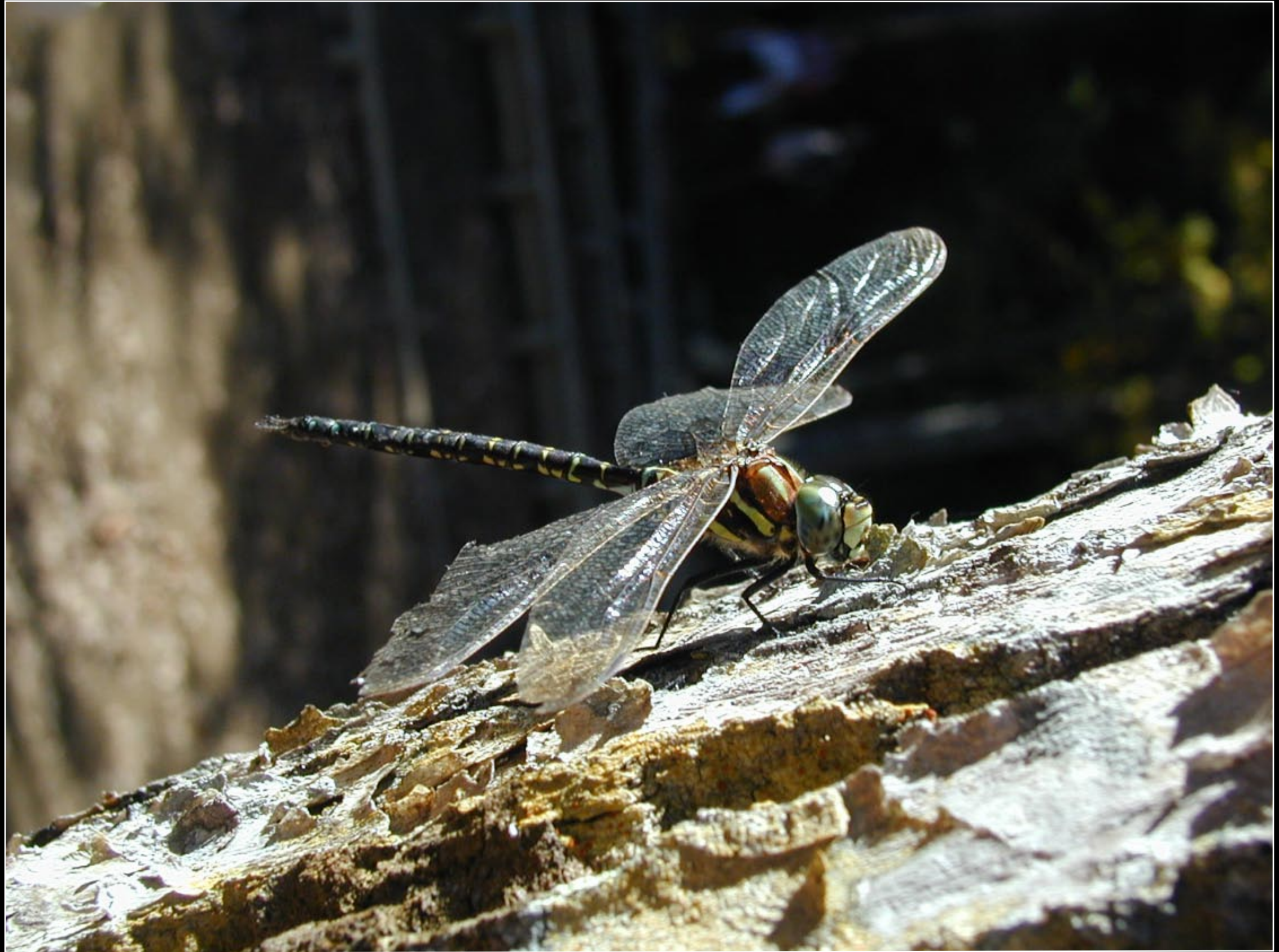
Big dragon fly