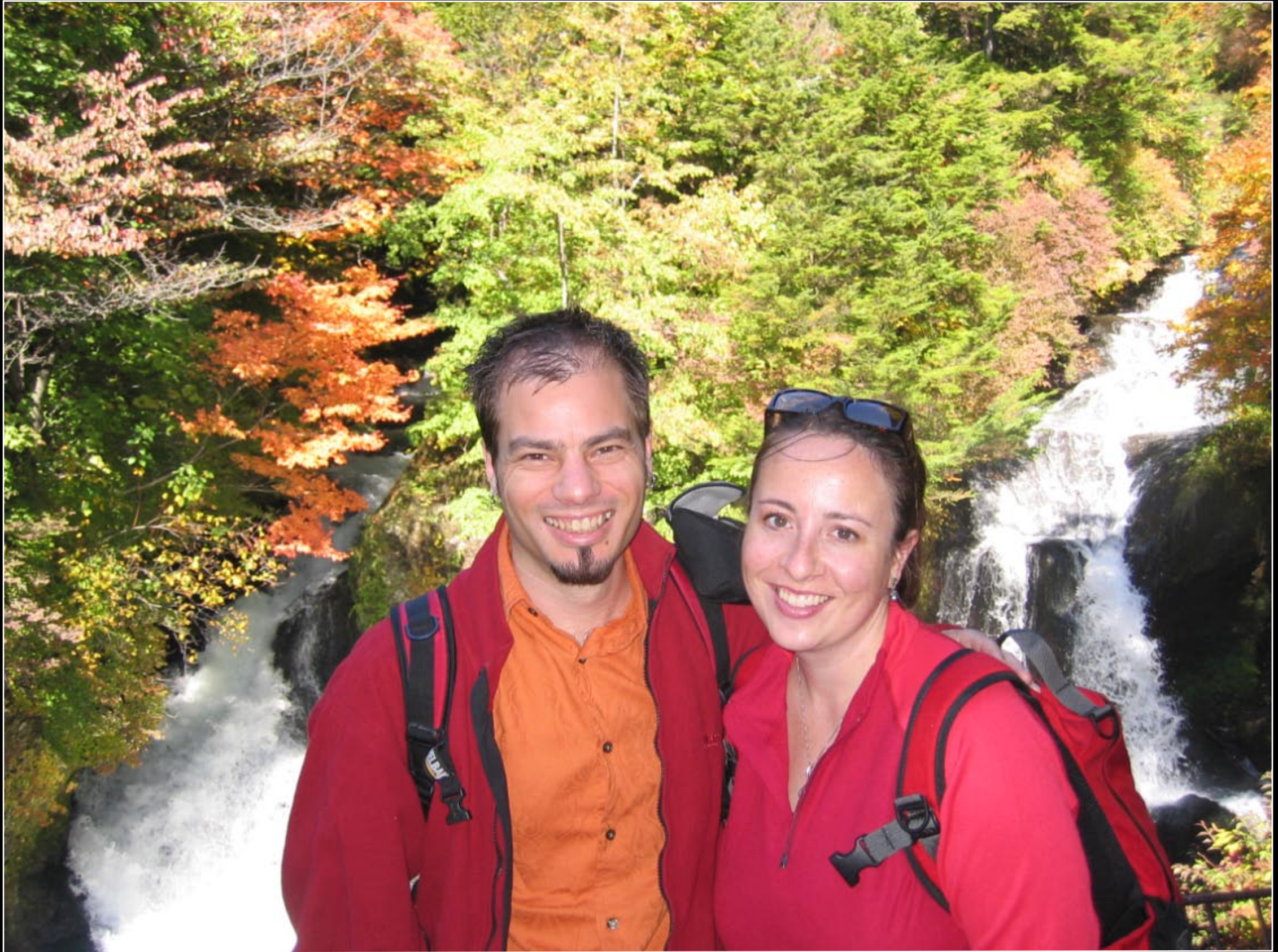
The fall colors were just getting going.