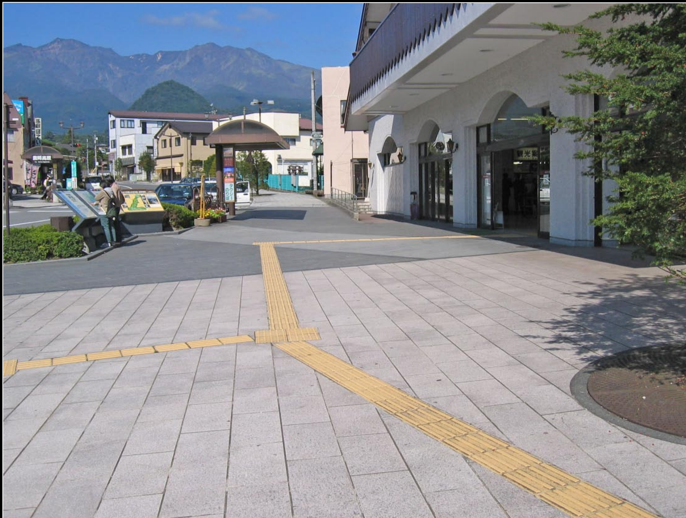
Yellow paths with embedded chips for the blind lead to stations