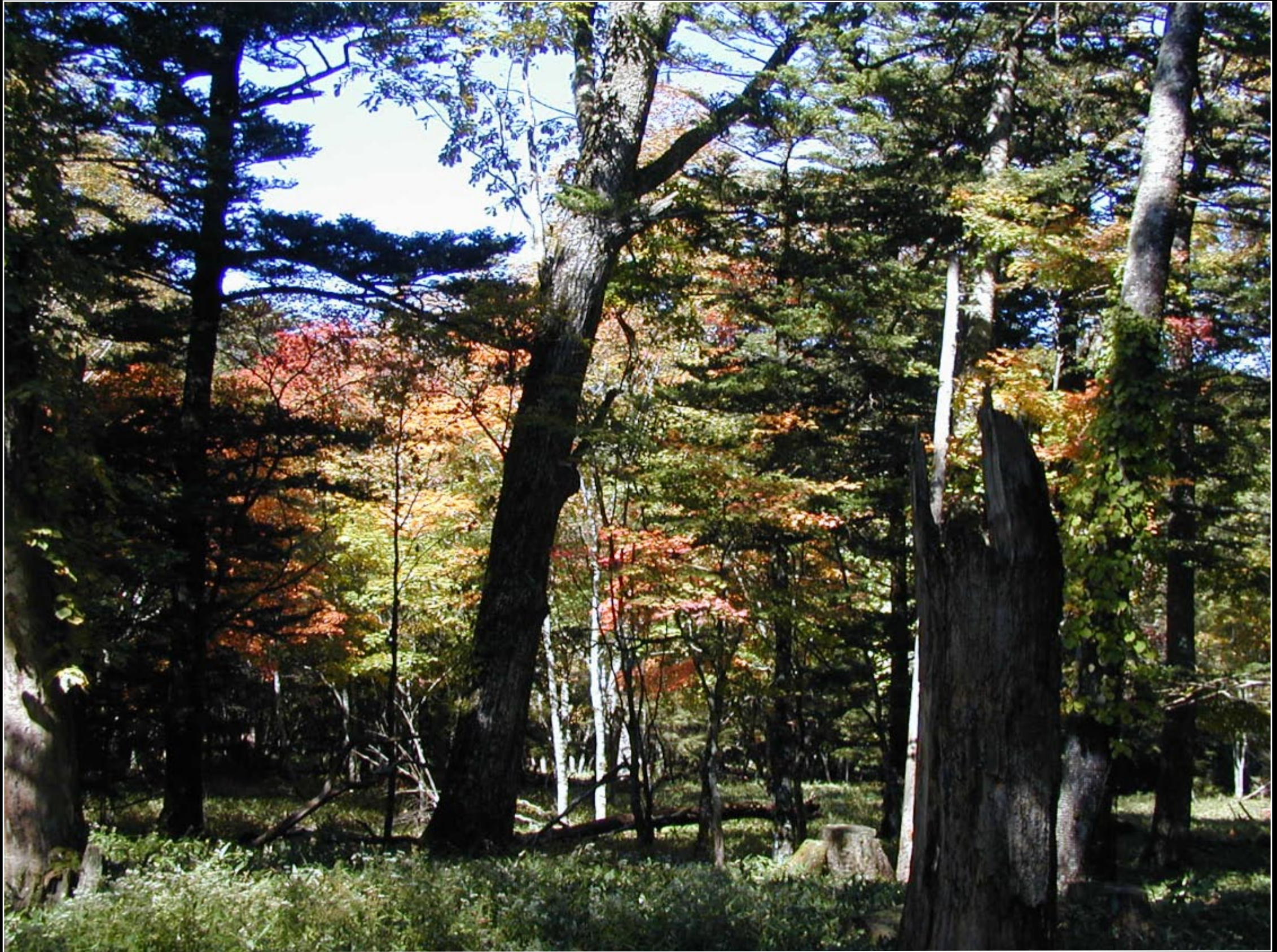
Some fall color.