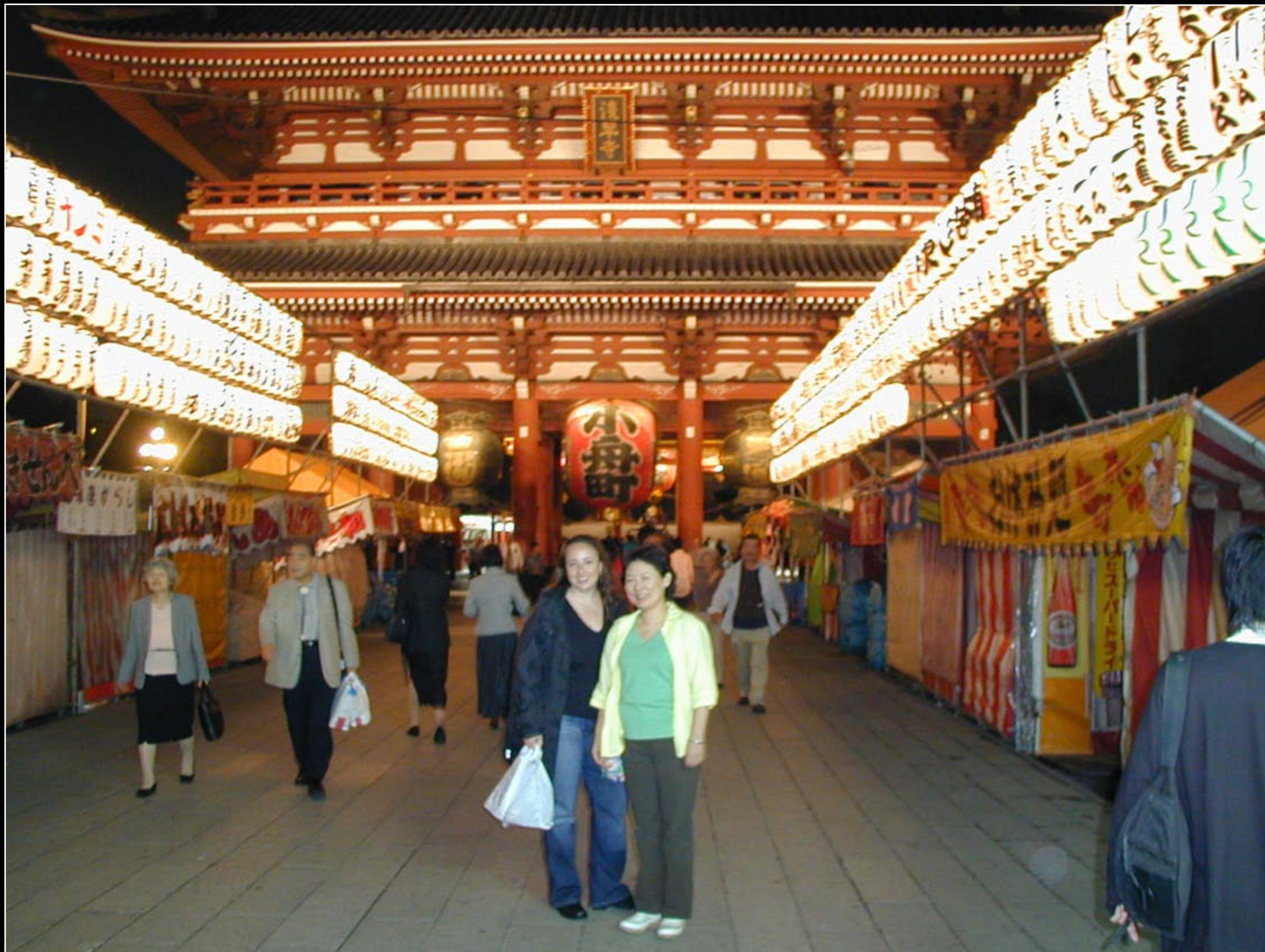
The Asakusa Temple Gate, still day 1.