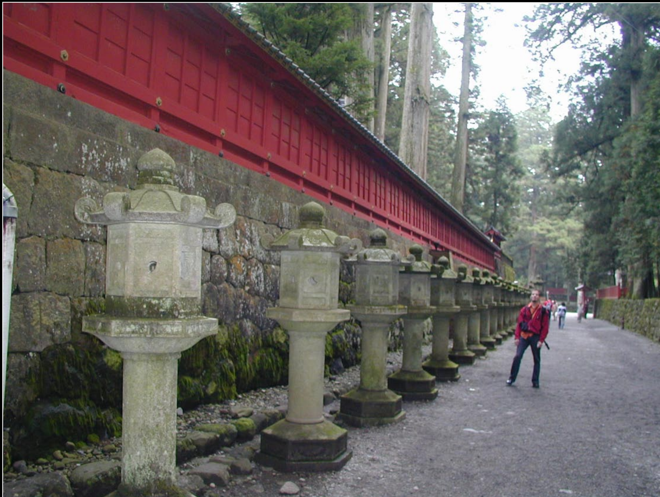
The path leading to the Toshogu Shrine.