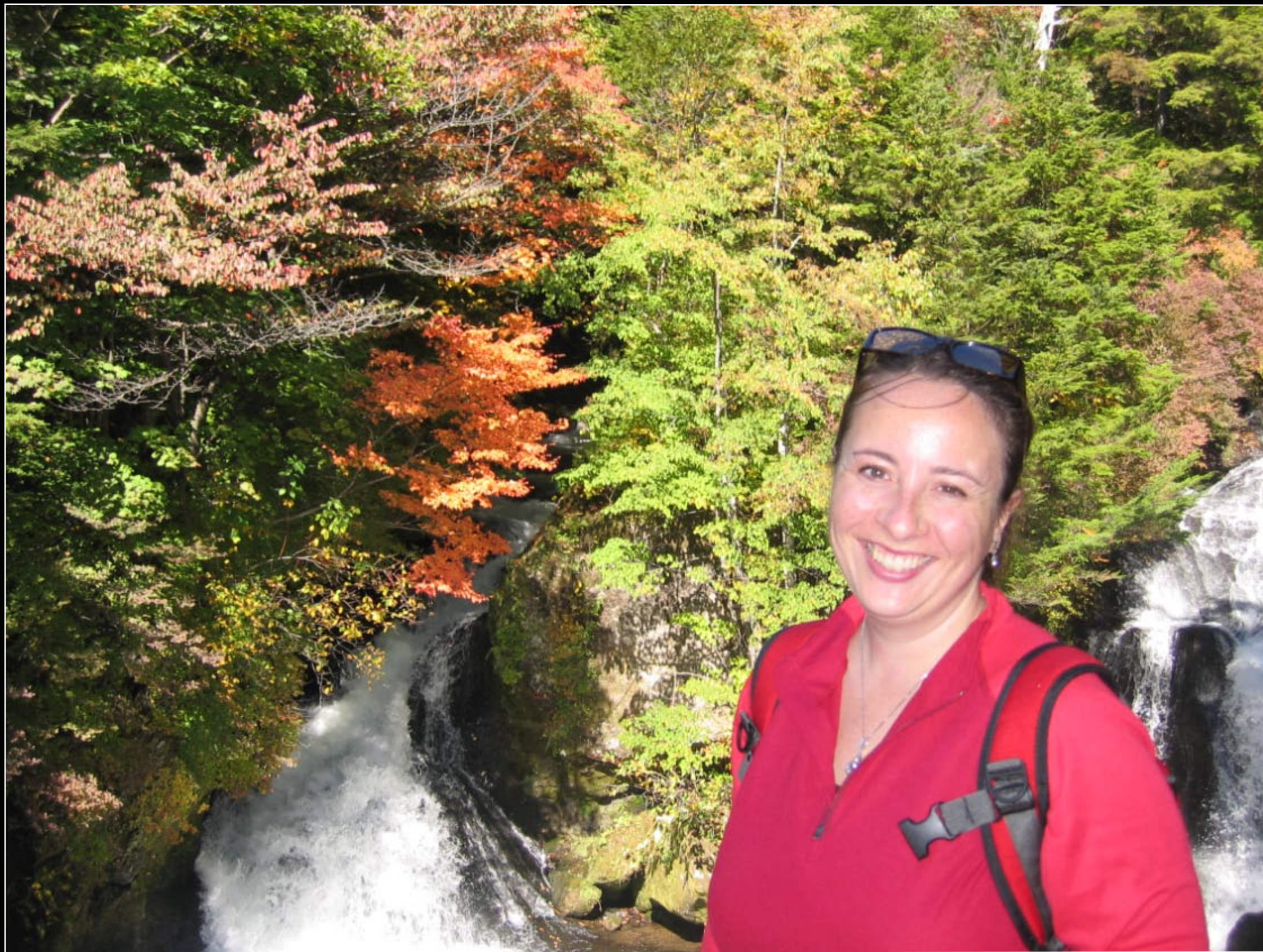
Getting ready to hike near Lake Chuzenji.