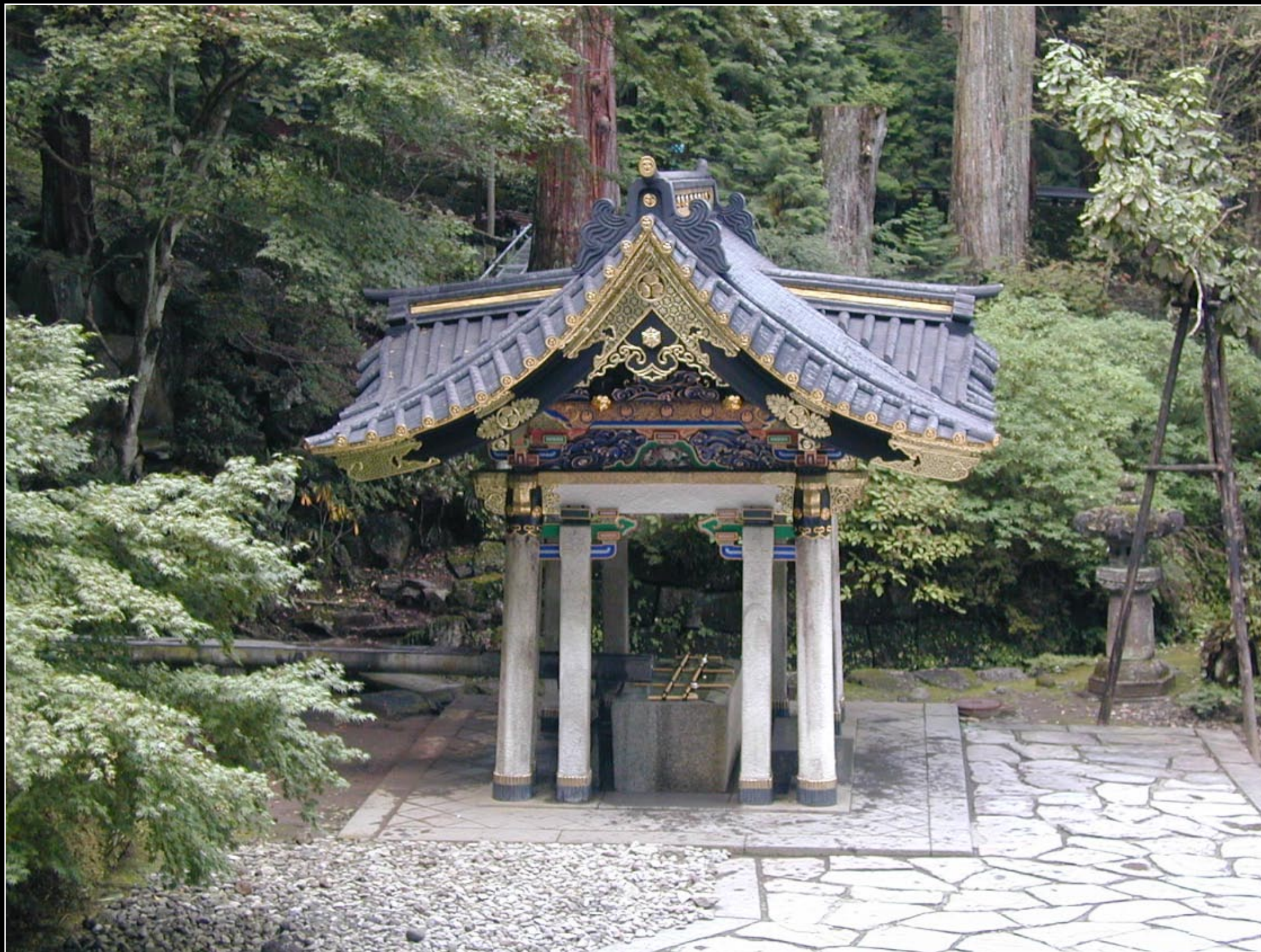
Water for purifying your hands and rinsing your mouth.