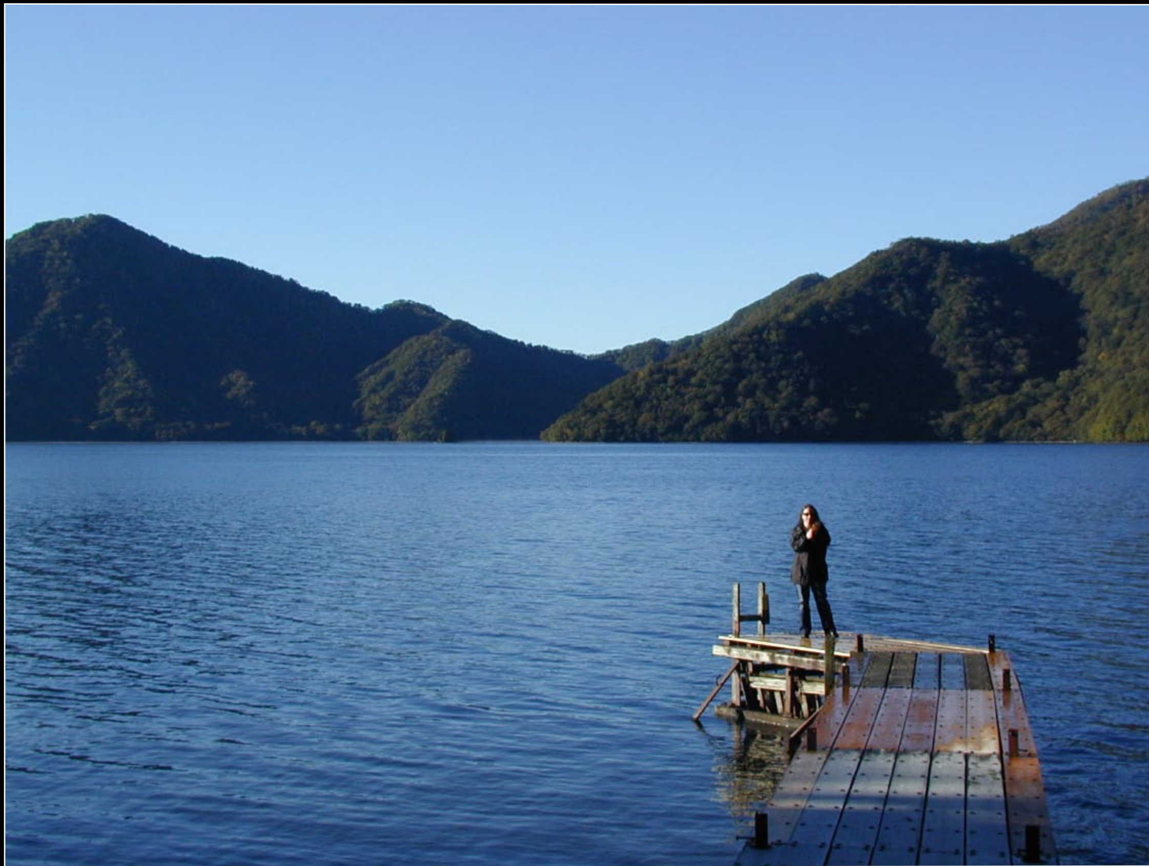
This is the OOCL house's pier.