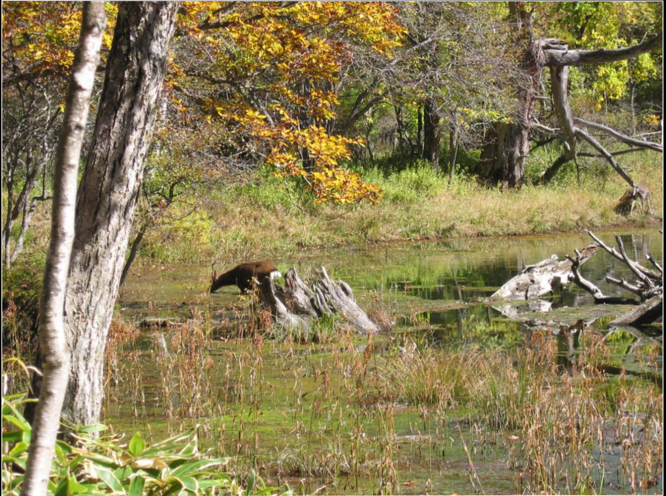
Deer eating pond weeds at our lunch spot.