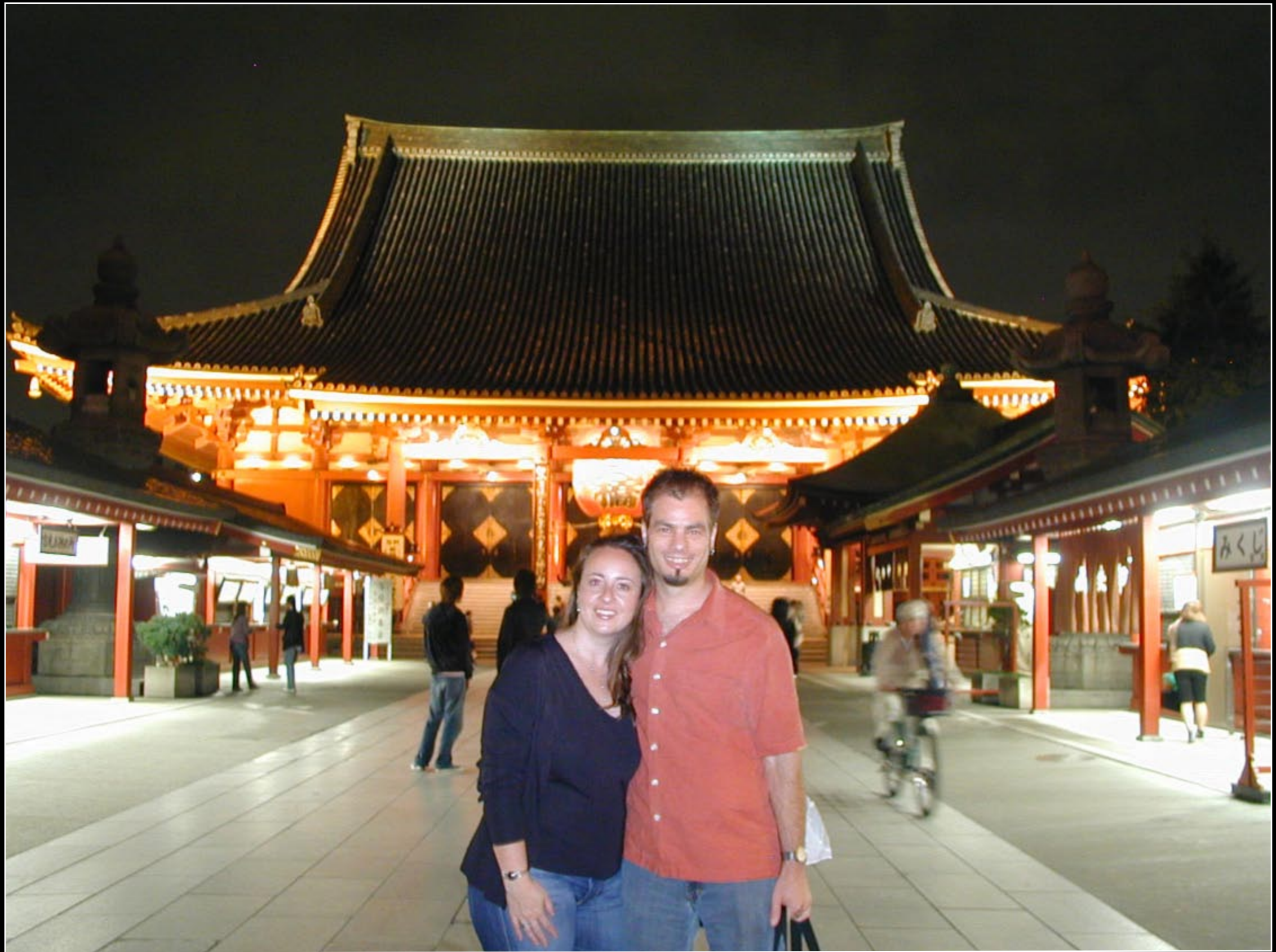
The Asakusa Temple, a short walk once inside the gate.