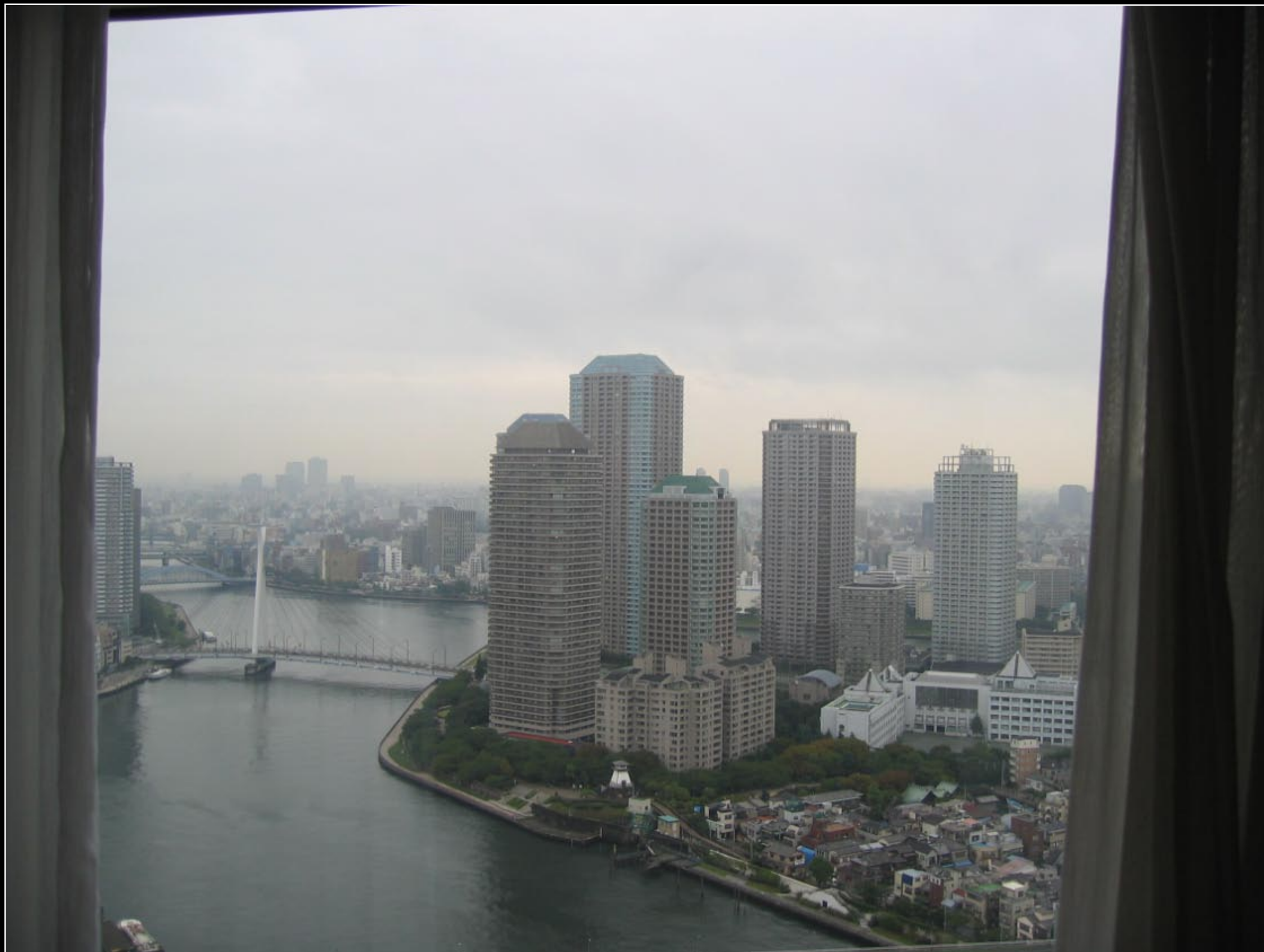
View of the Sumida River from our 32nd floor hotel room.