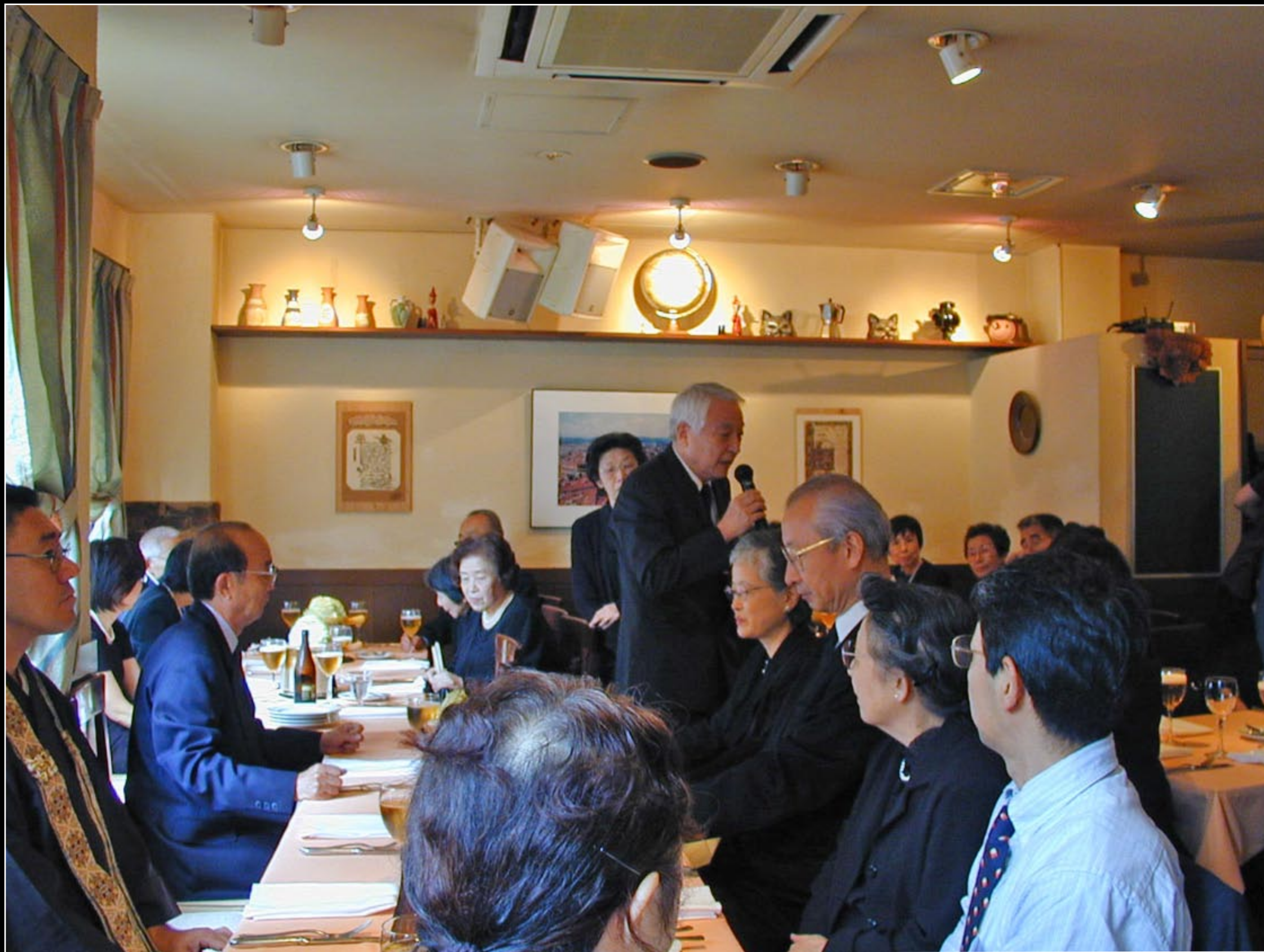
Day 2. Italian lunch after the memorial service for Kei-san.