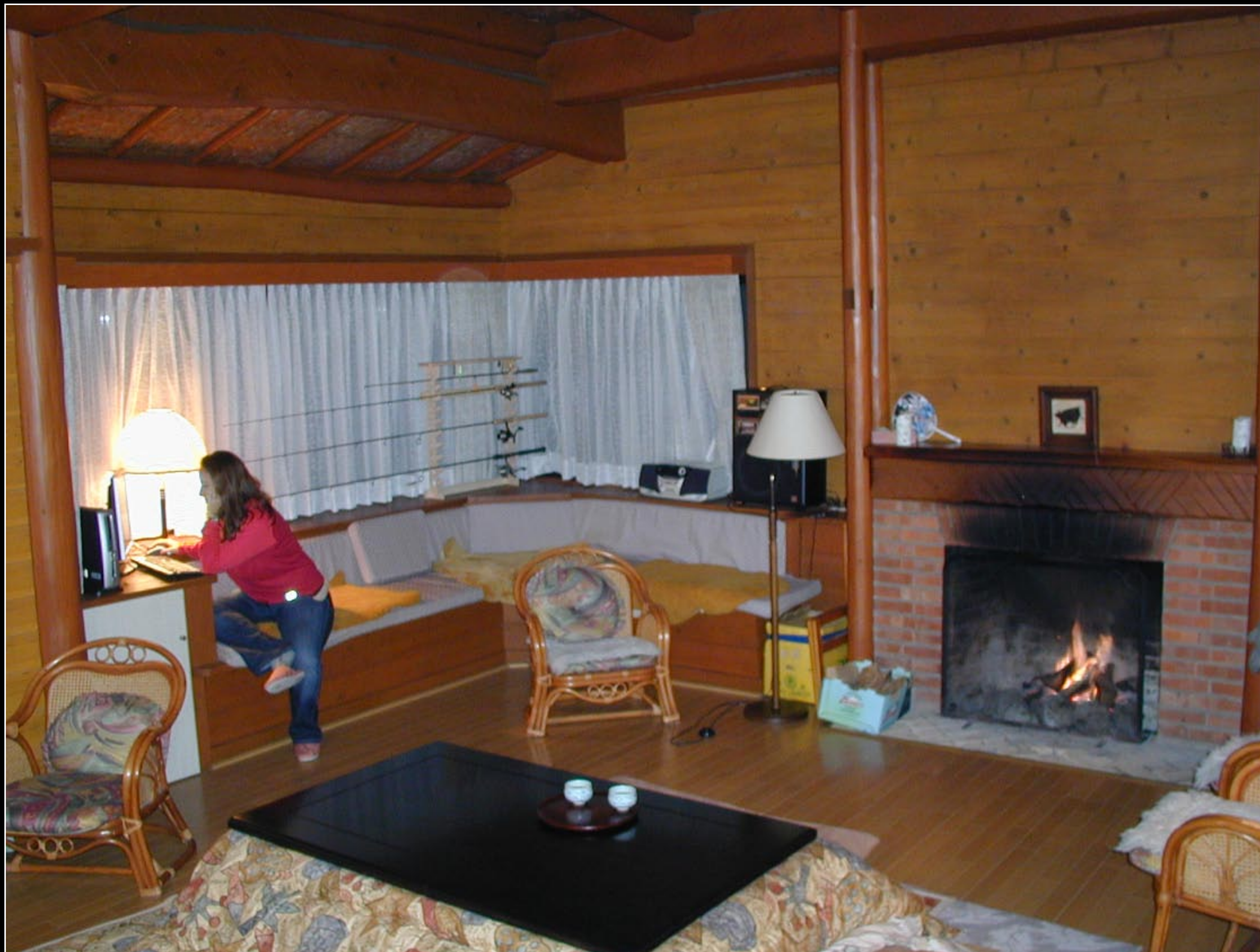
Internet access inside the OOCL house after a long day!