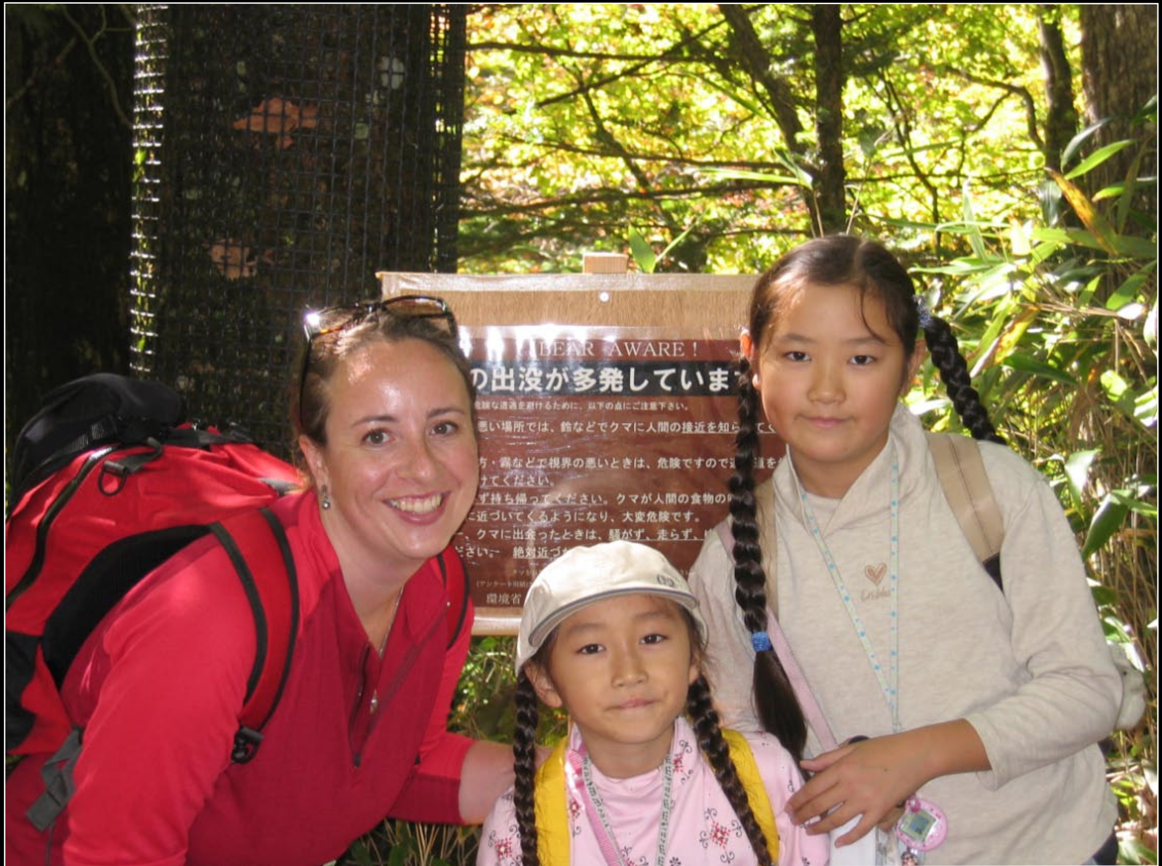
Kids of the friendly Yoshino family we hiked with.