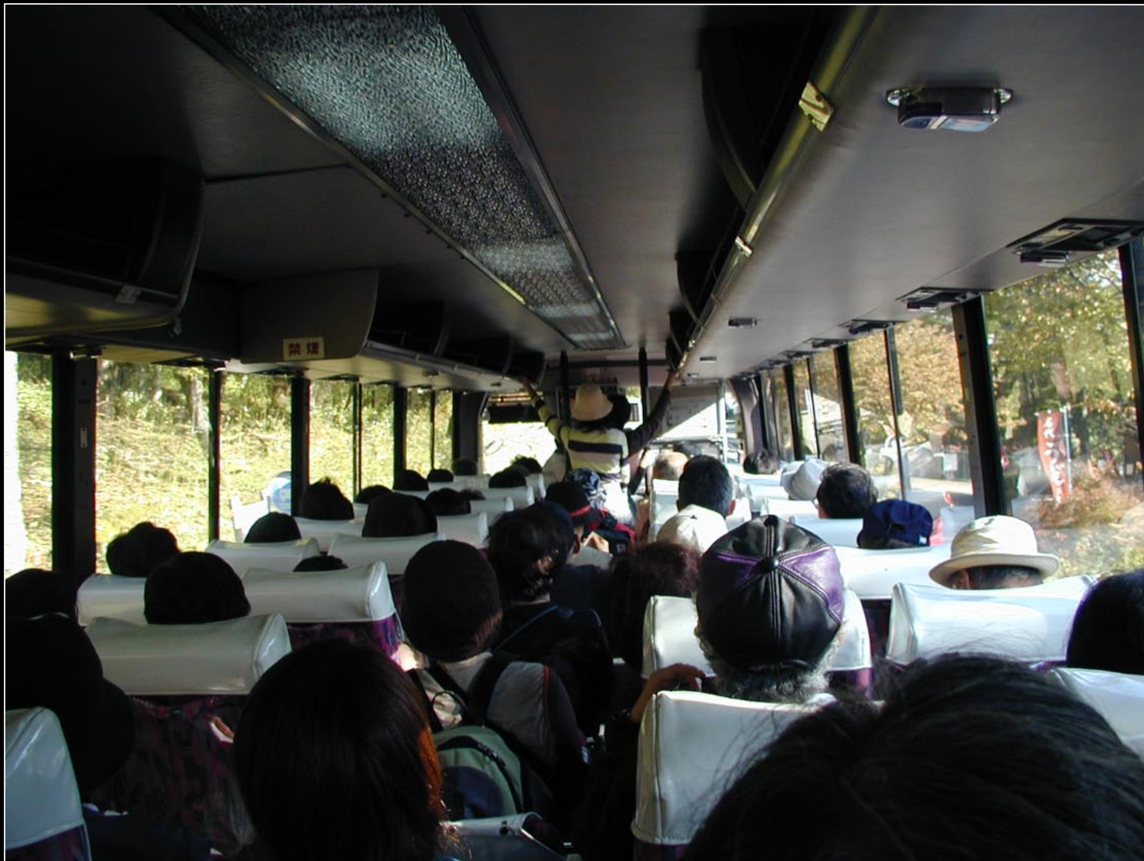
The bus down the hill with all jump seats filled!