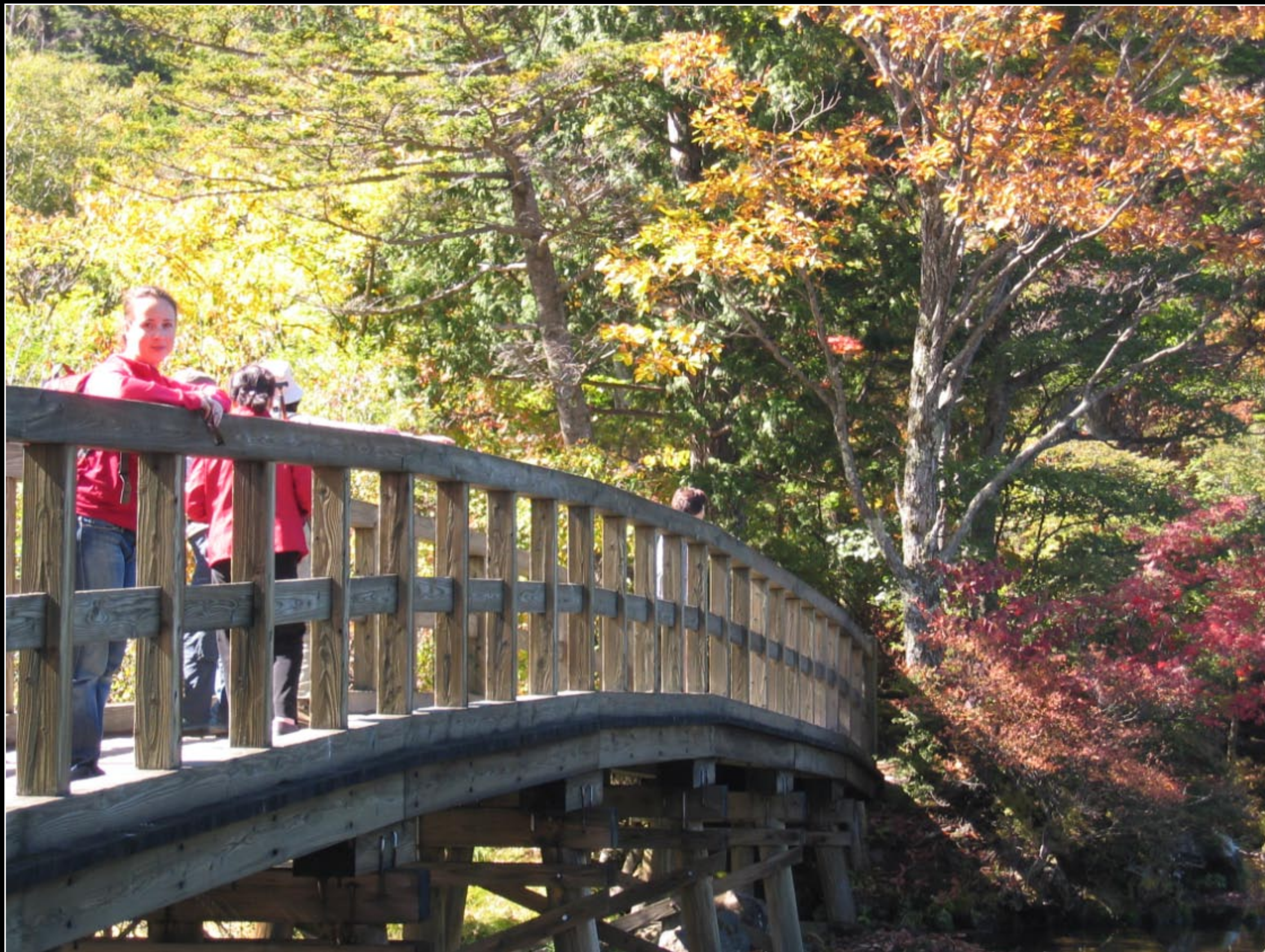
Over a lake at the start of our hike.