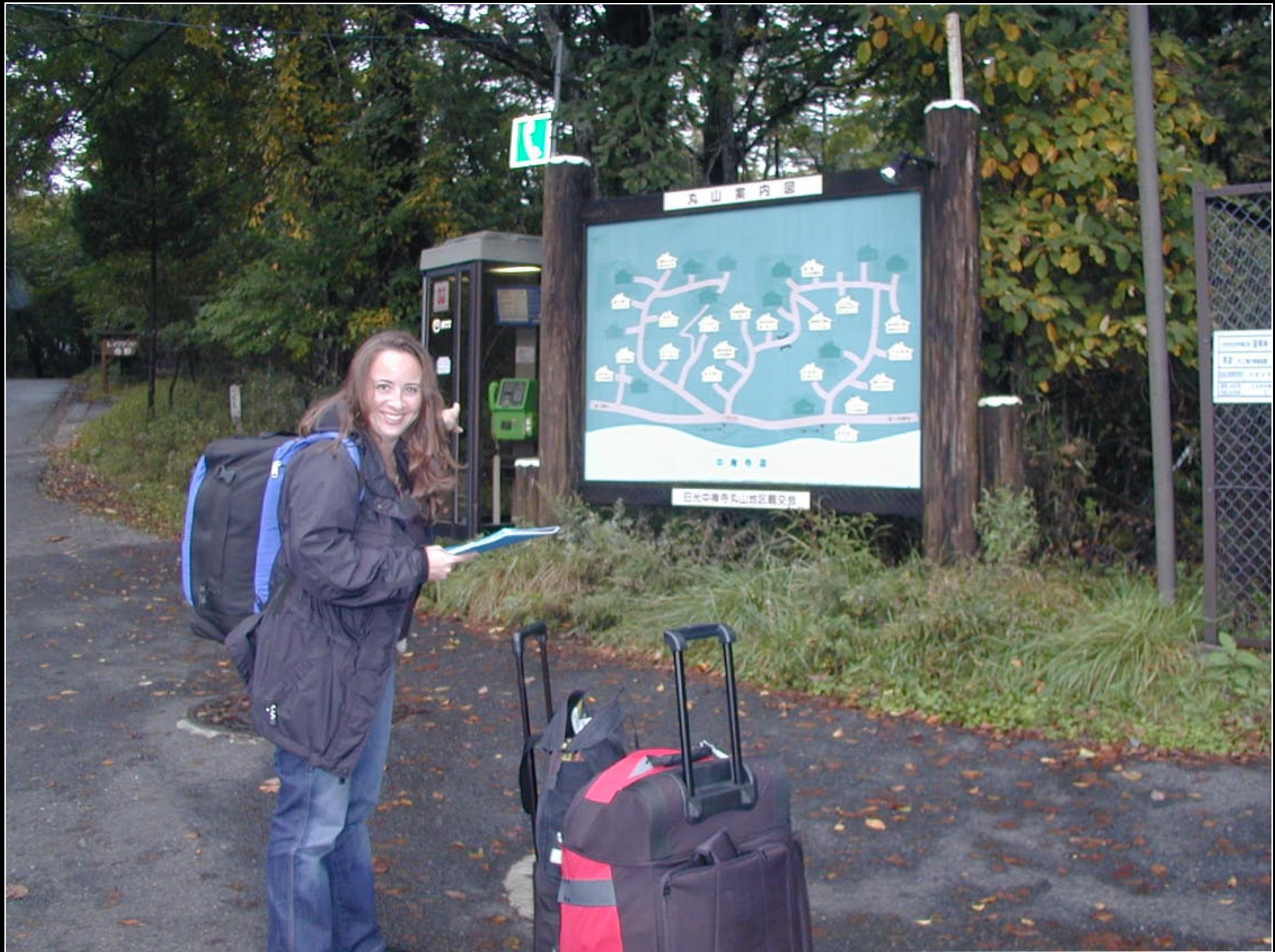
Onsen (hot spring hotel) map at Lake Chuzenji above Nikko.