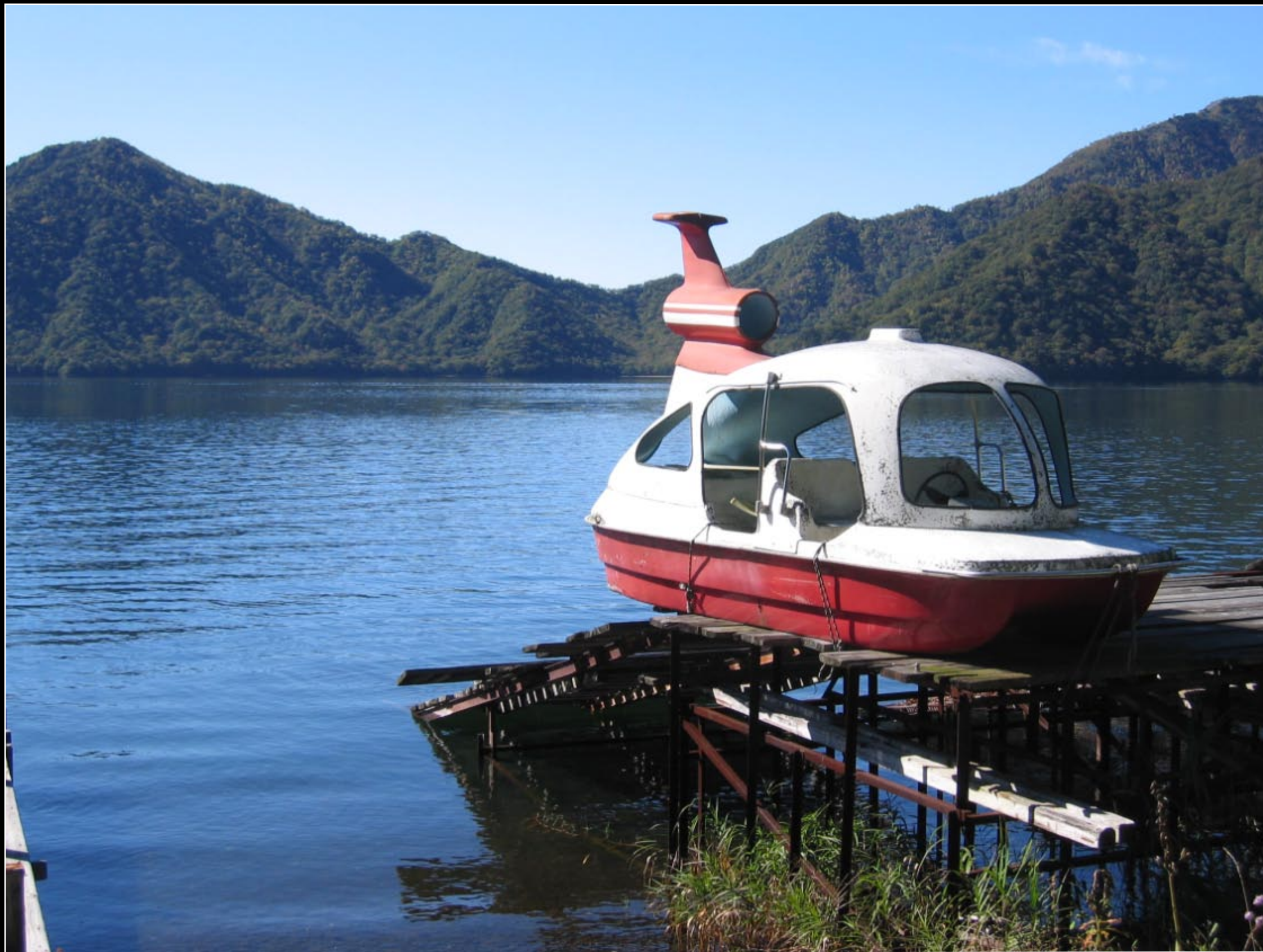
Super fast jet boat. Actually, pedal powered. And broken.