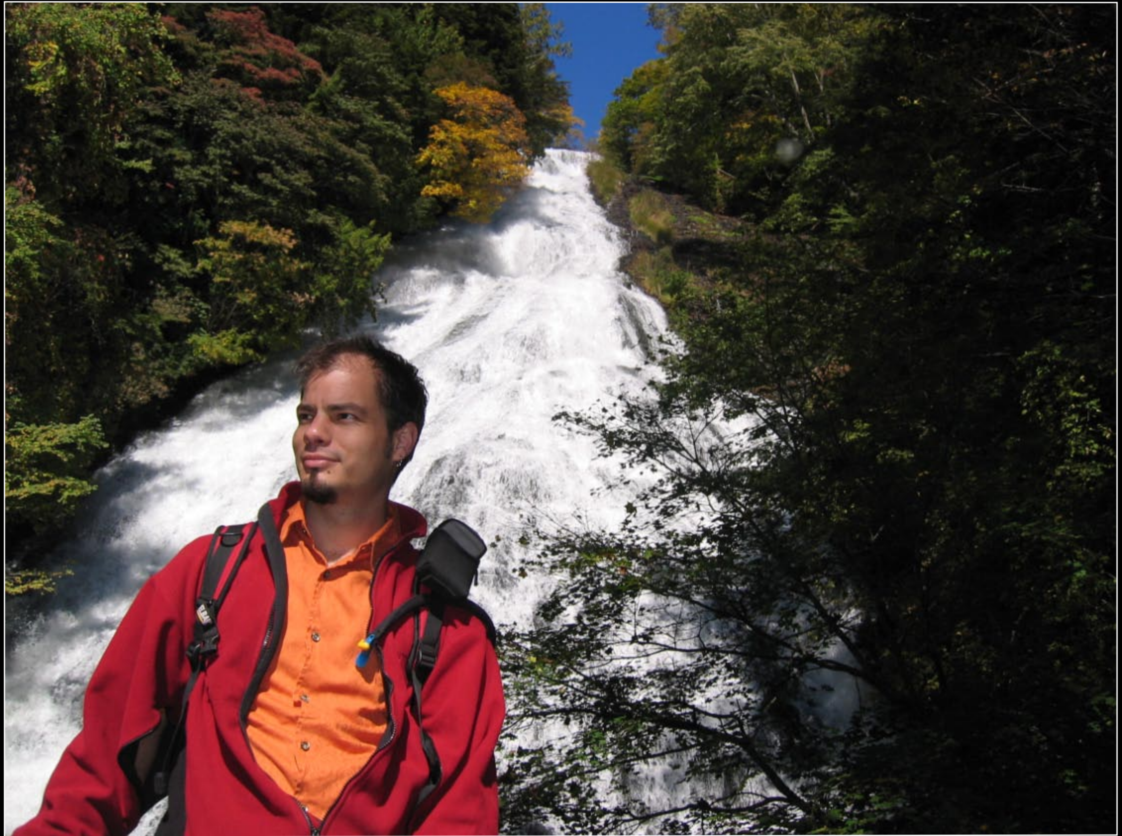
Falls coming from the trailhead lake.