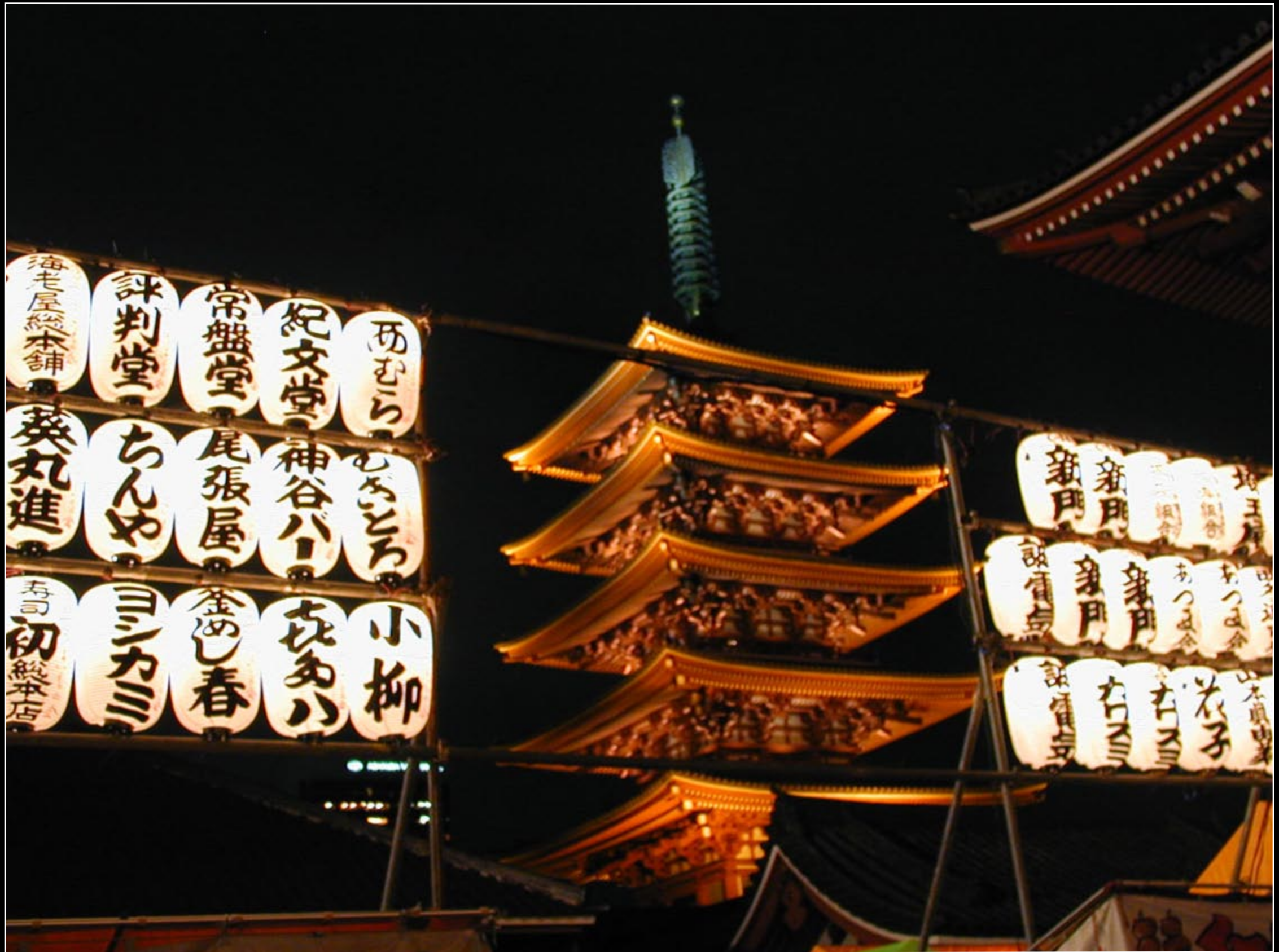
The Pagoda at the Asakusa Temple.