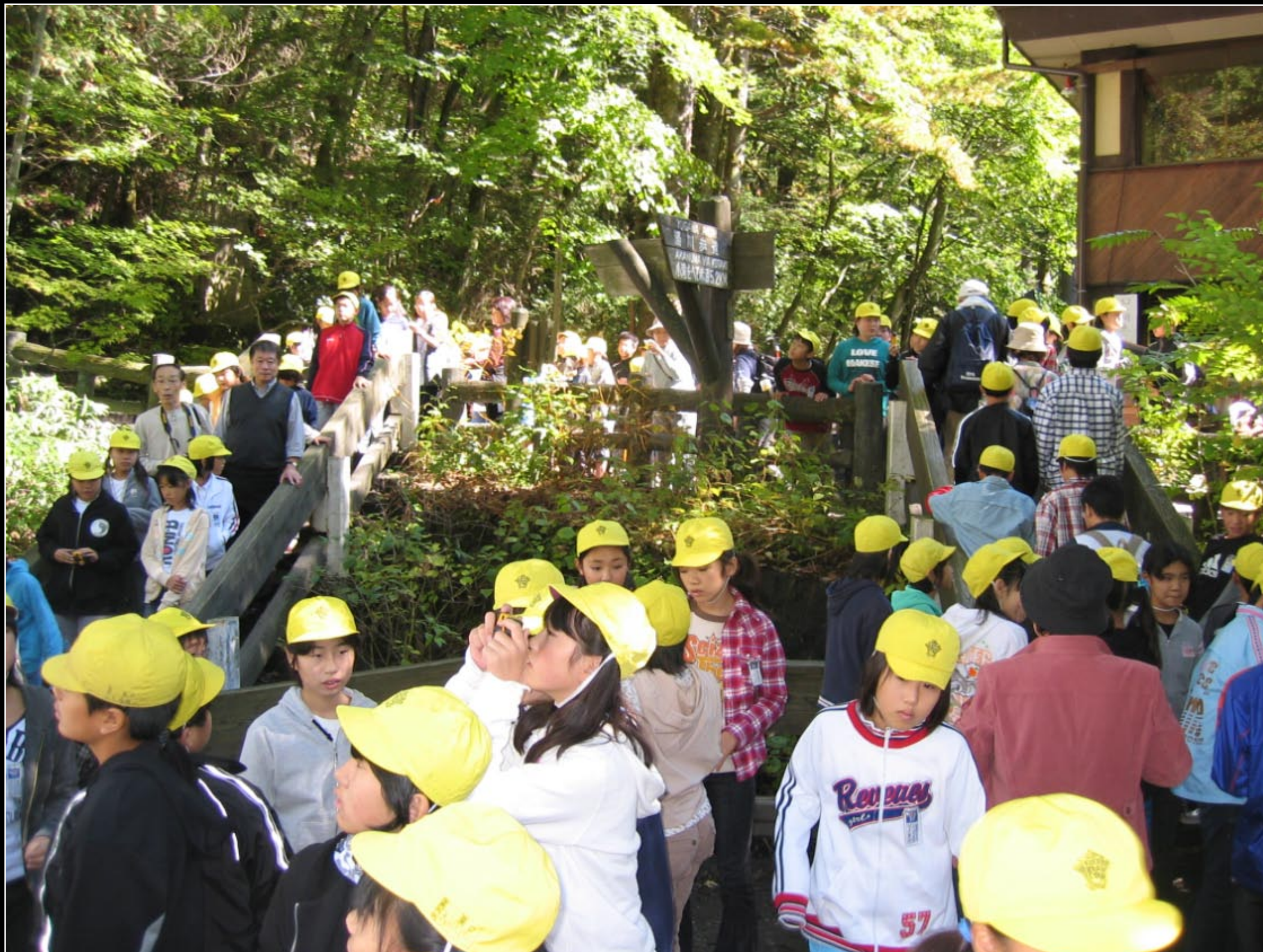
The first of hundreds of school children.