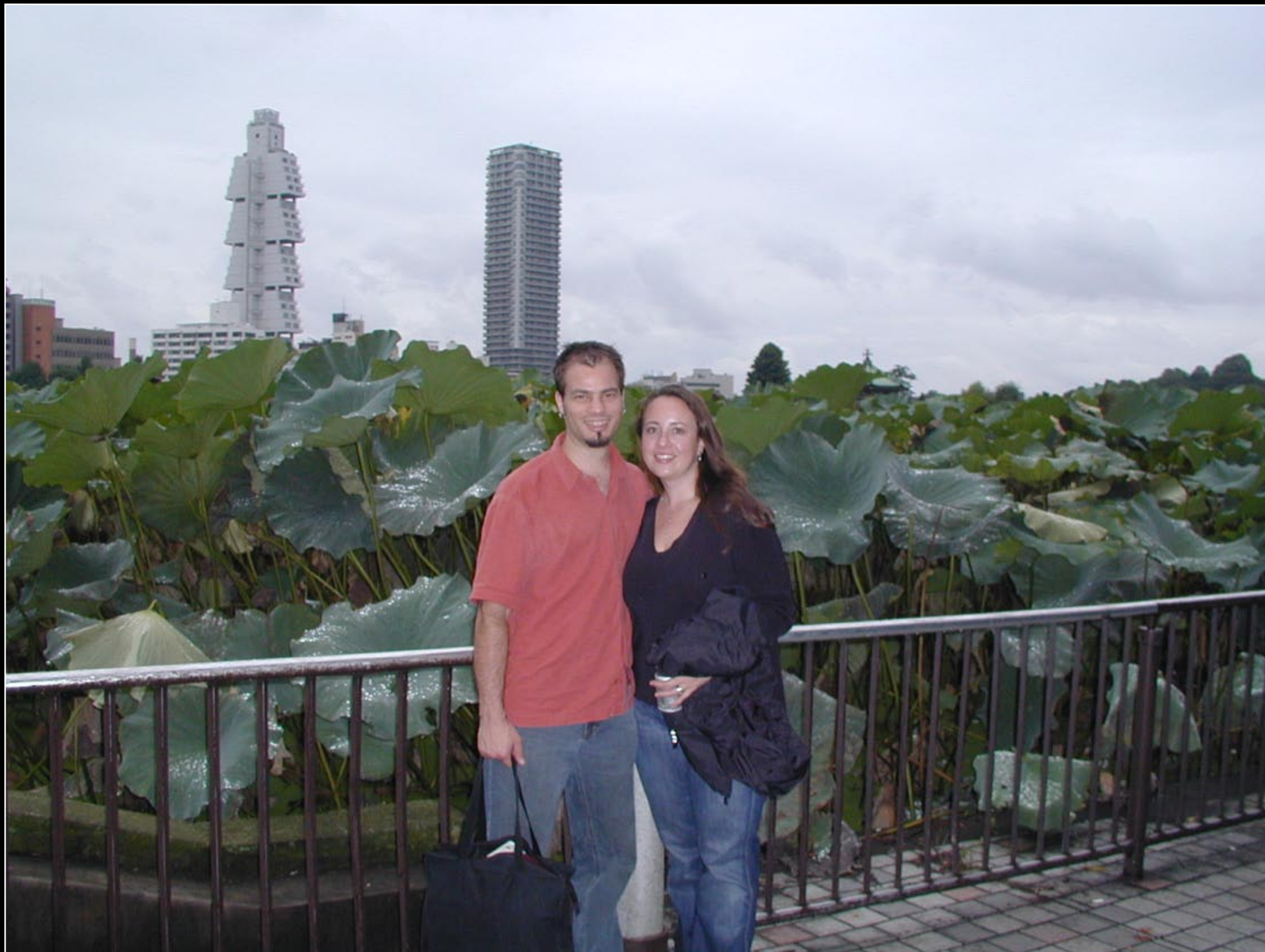
Yea, it was humid and warm in October.