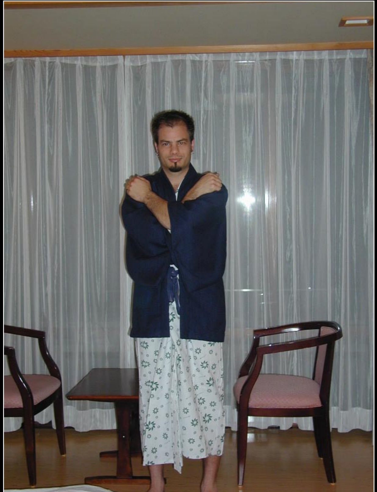
Preparing for the hot spring wearing Yukata and coat.