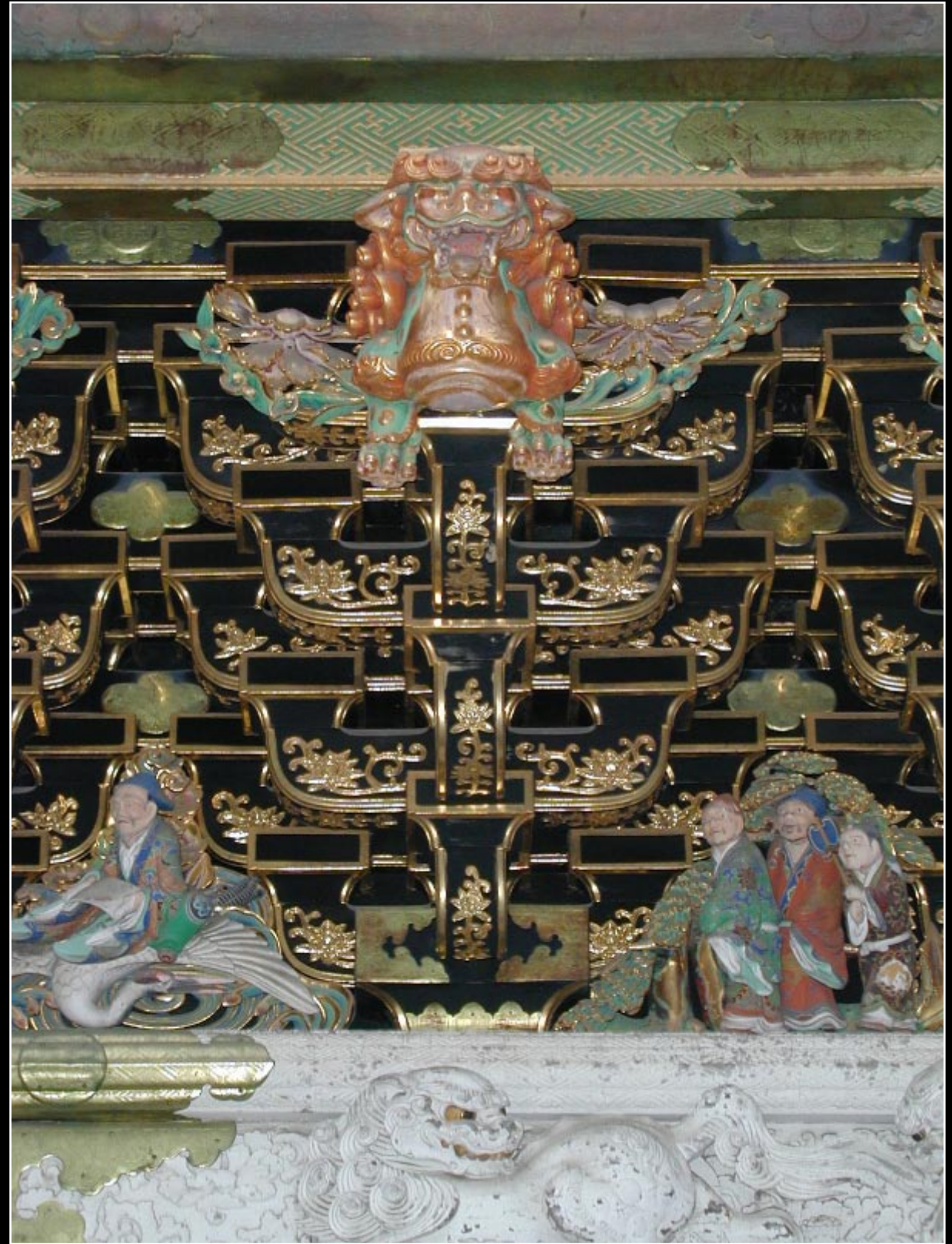
Detail of a temple gate