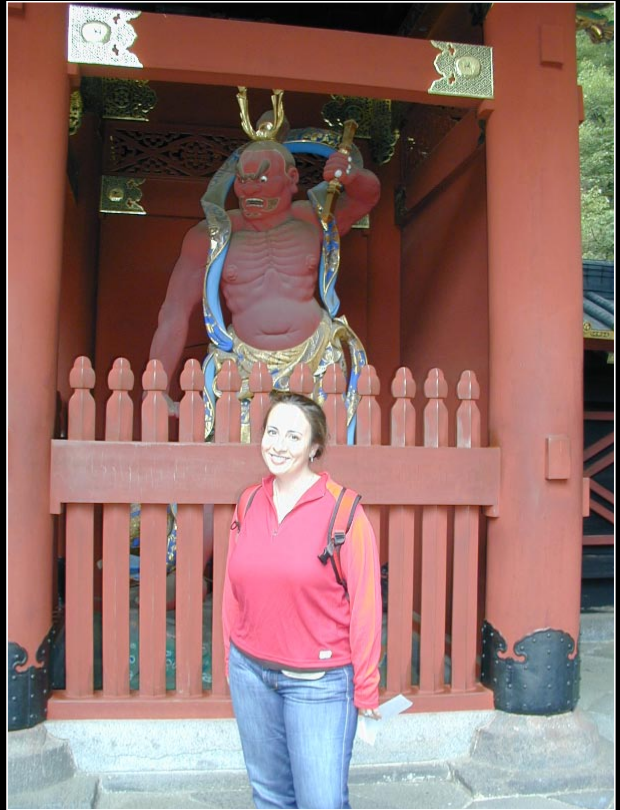
Deva guardian warding off evil in the Nikko temple grounds.