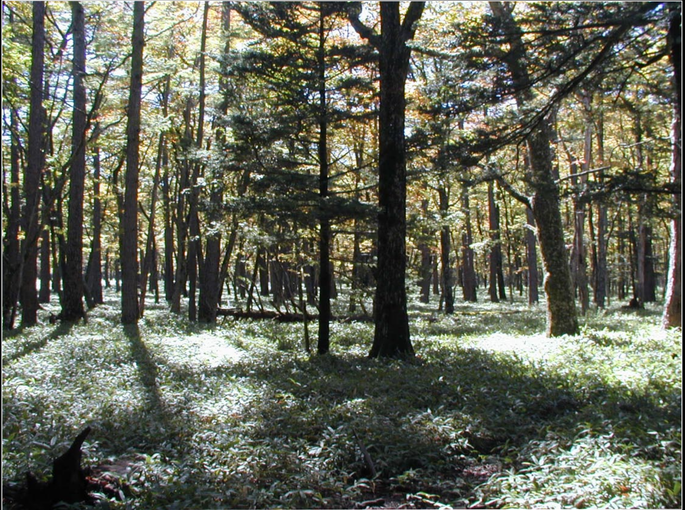
The light was nice in the woods.