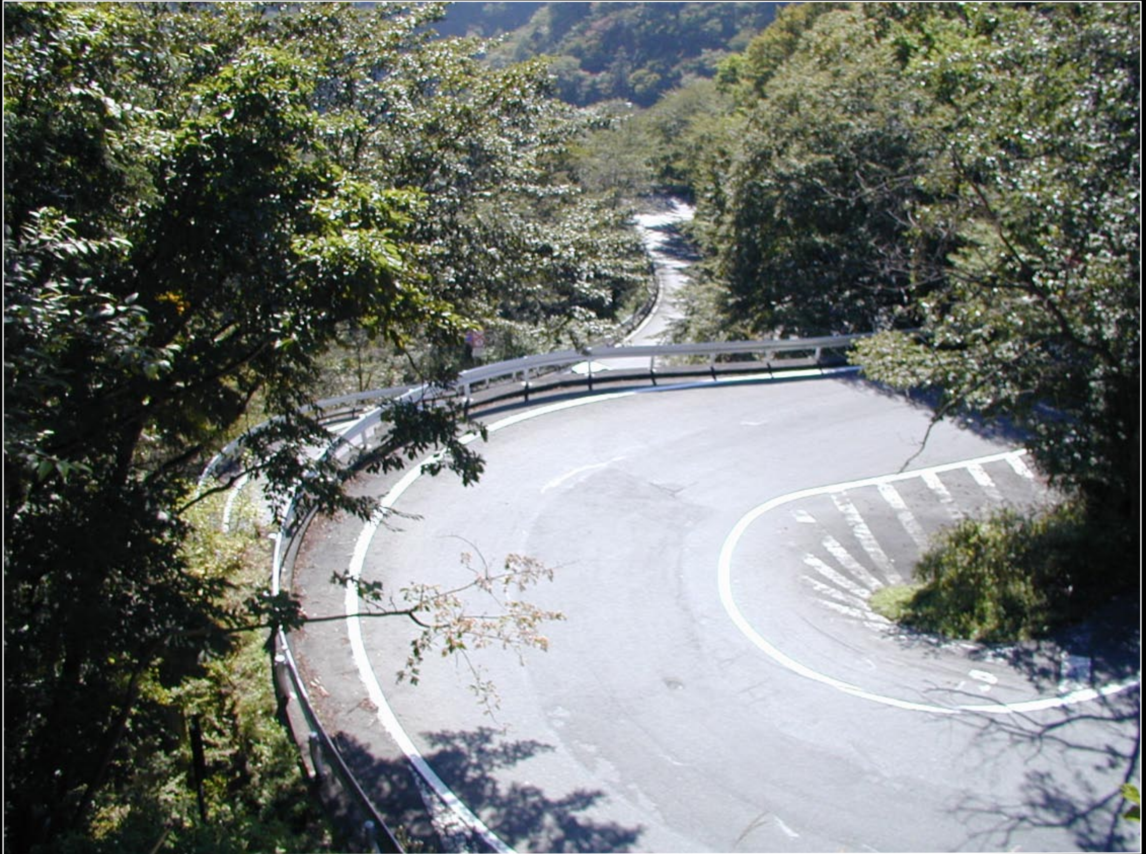
Steep bus ride down to Nikko. Three levels are visible.