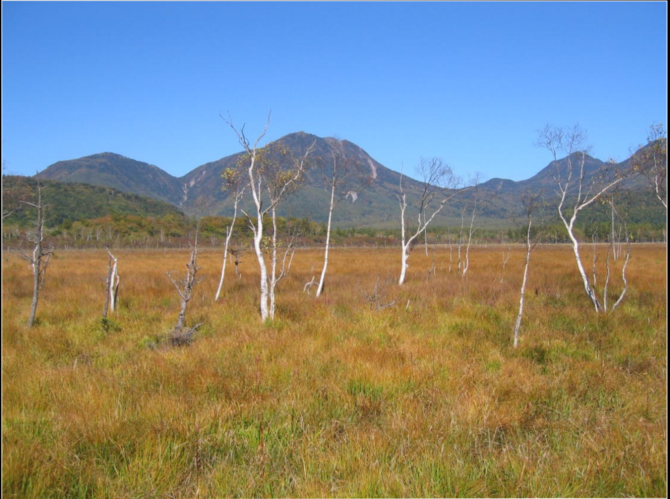
Beautiful meadows along the hike.