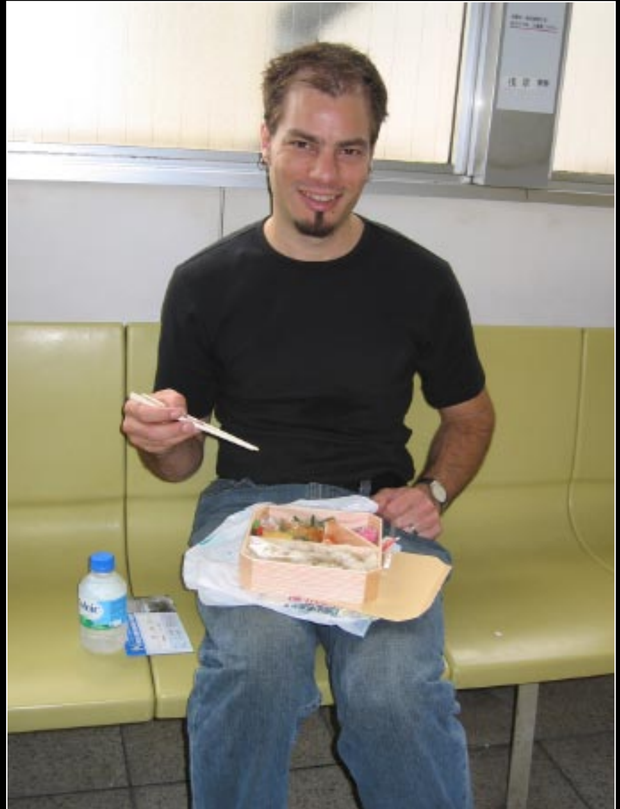
Train station bento box on the way to Nikko.