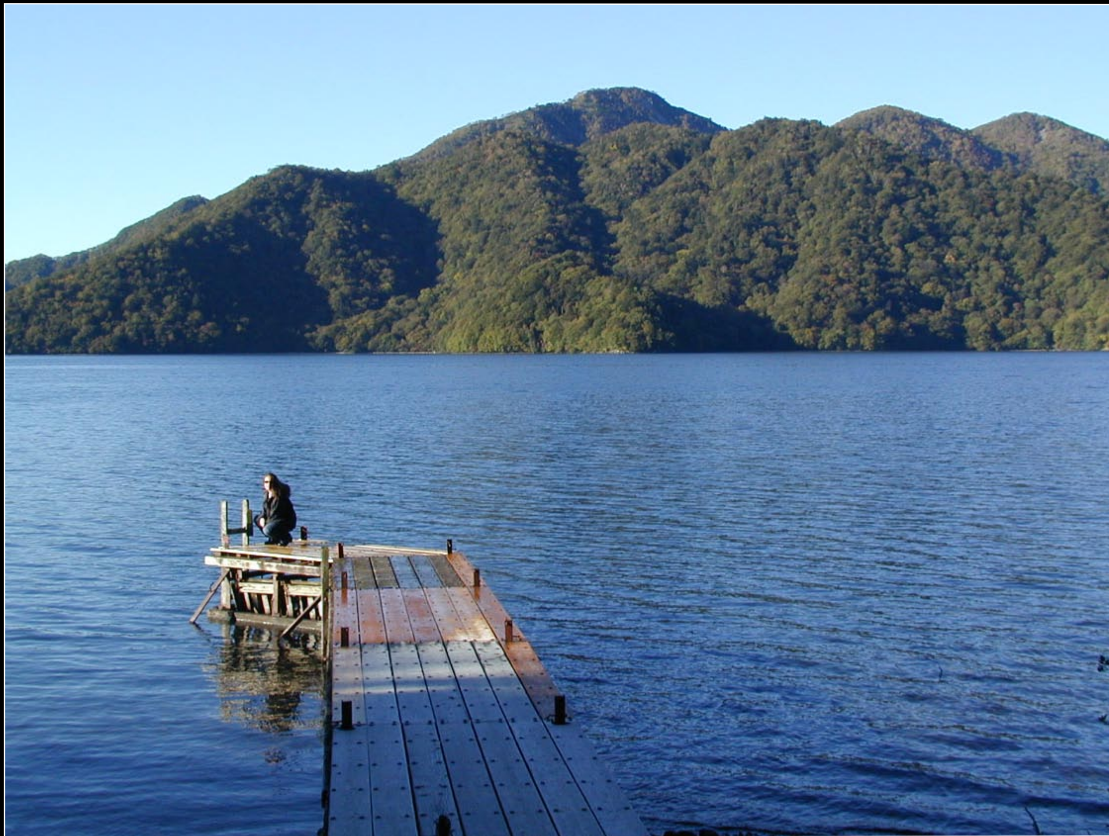
Beautiful morning on Lake Chuzenji, day 5.