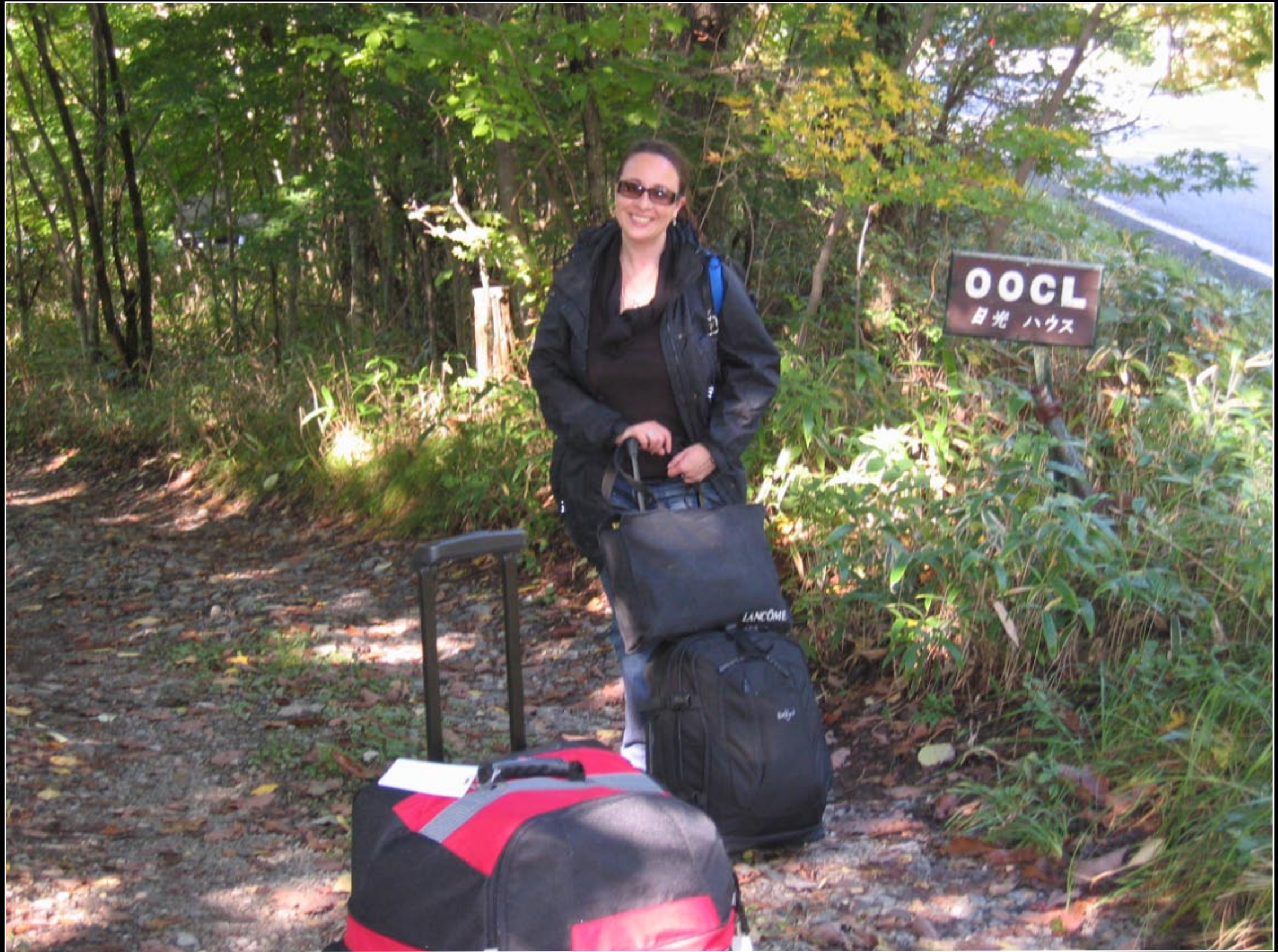
Day 4. Heading across the street to the OOCL lake house.