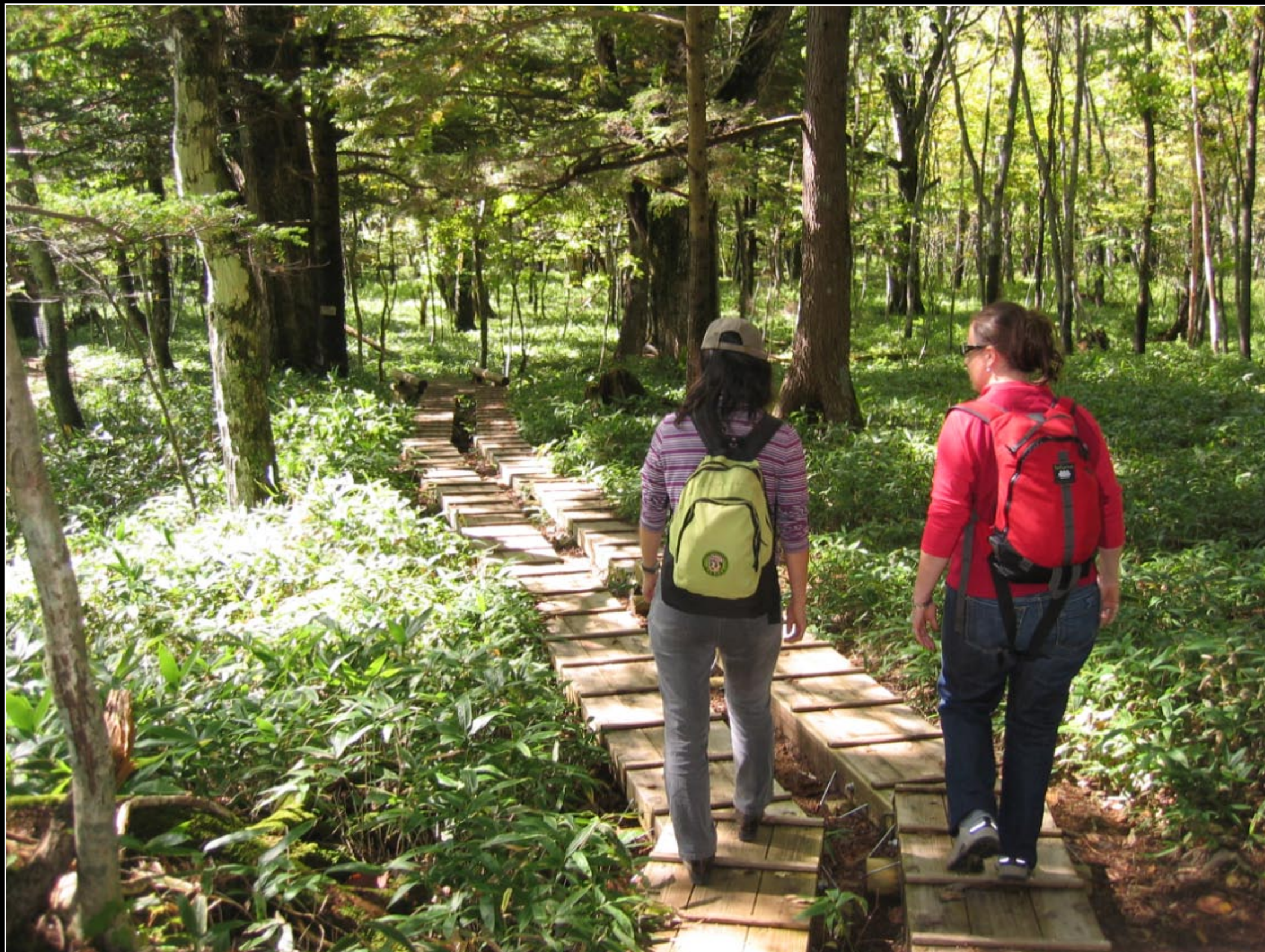
Most of the hike was on a board walk trail.