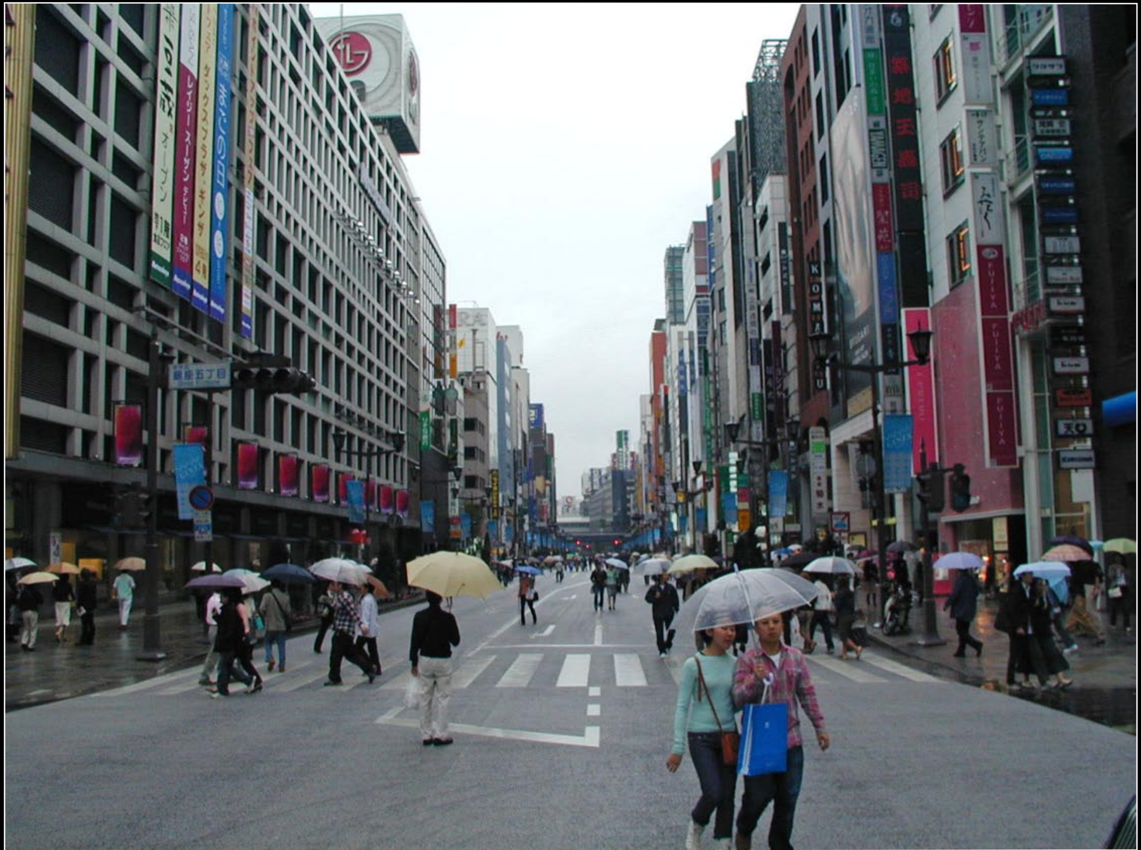
Day 1. Ginza district of Tokyo! Everyone had umbrellas but us.