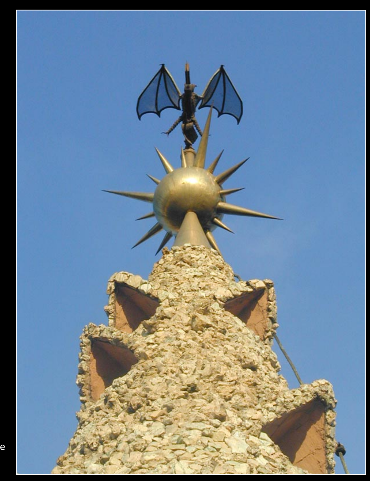
Keeping the mosquitos at bay on top of the Guell Palace