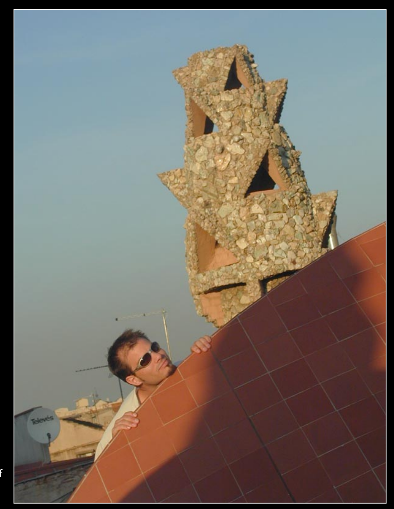
Up on the roof