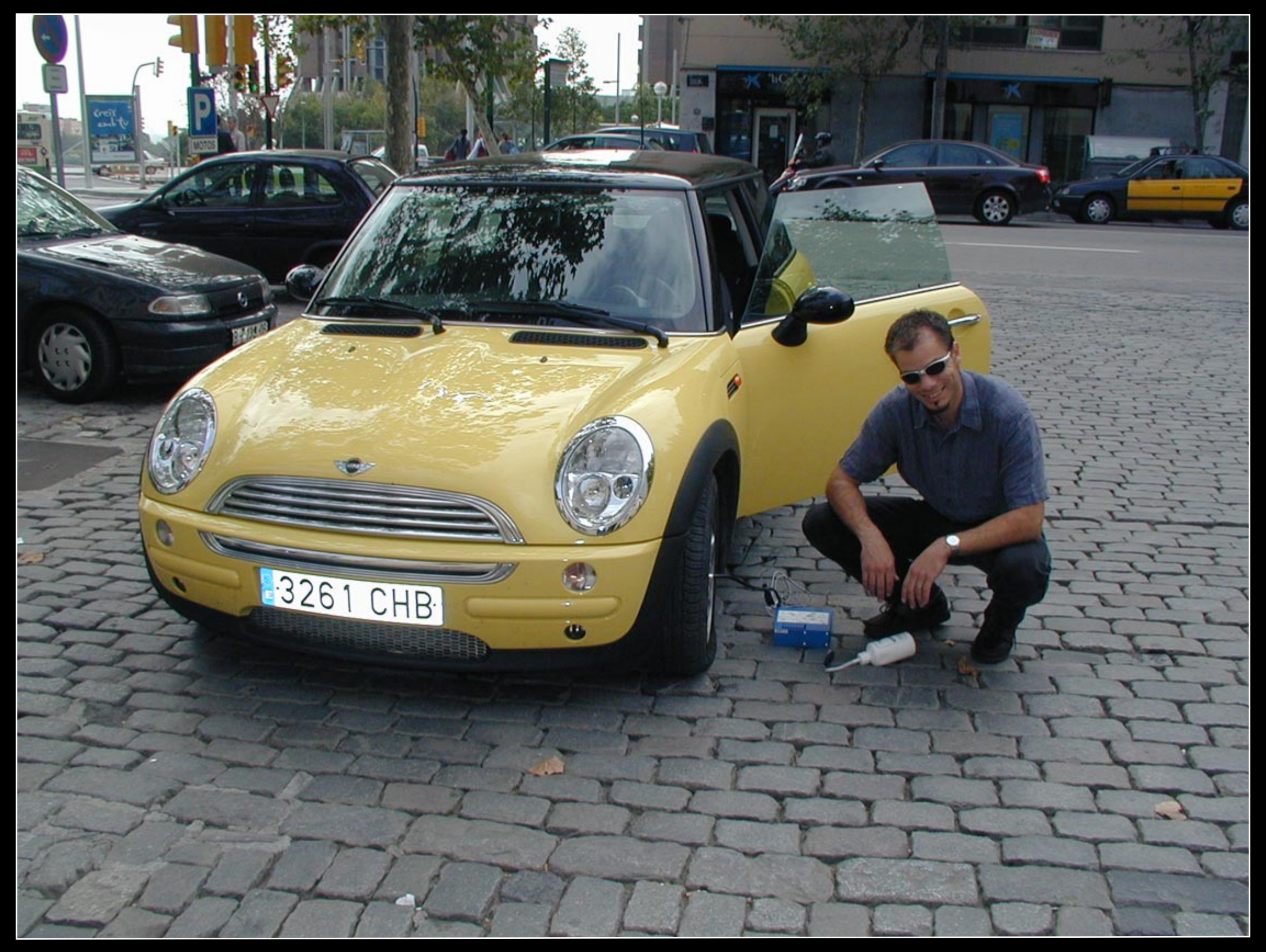
Ah, the Mini Cooper. With a flat. In our first 2 hours of Spain