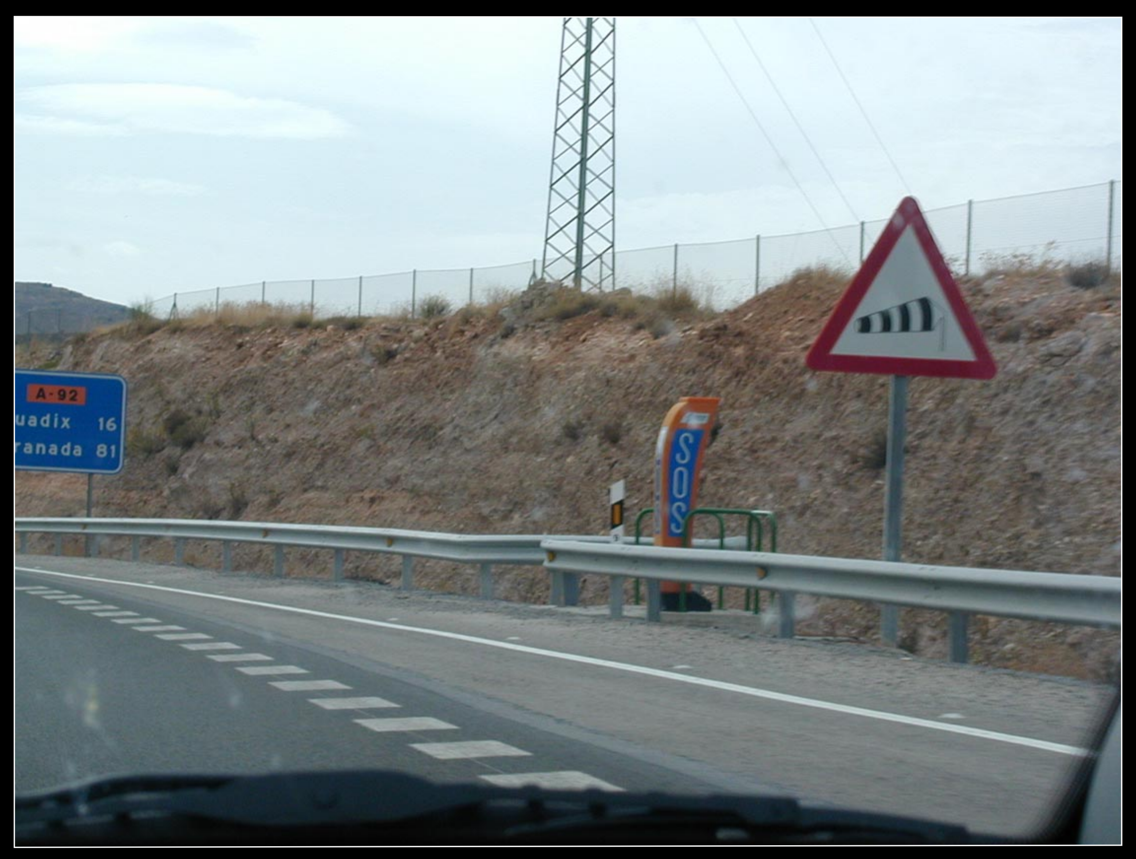
Warning! Rampant wind socks!