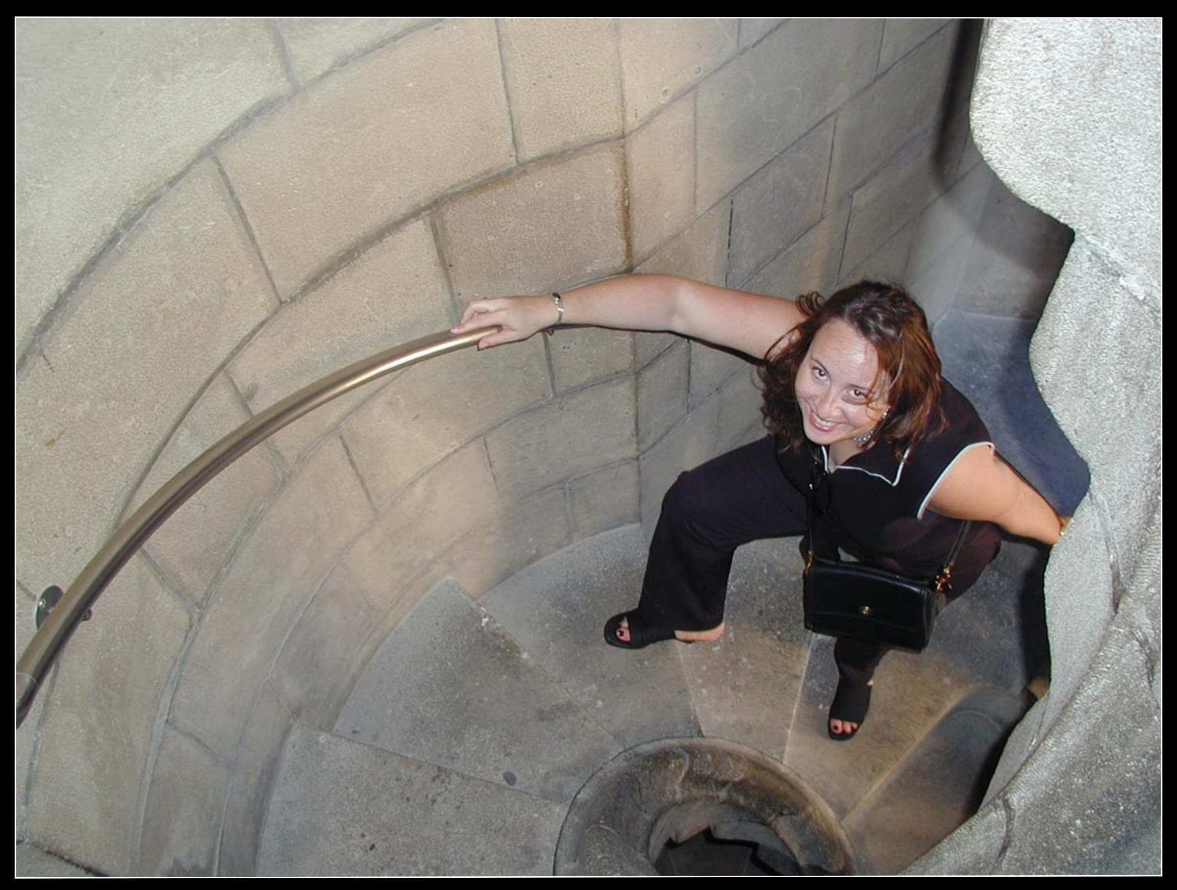
You could jump right down the middle!