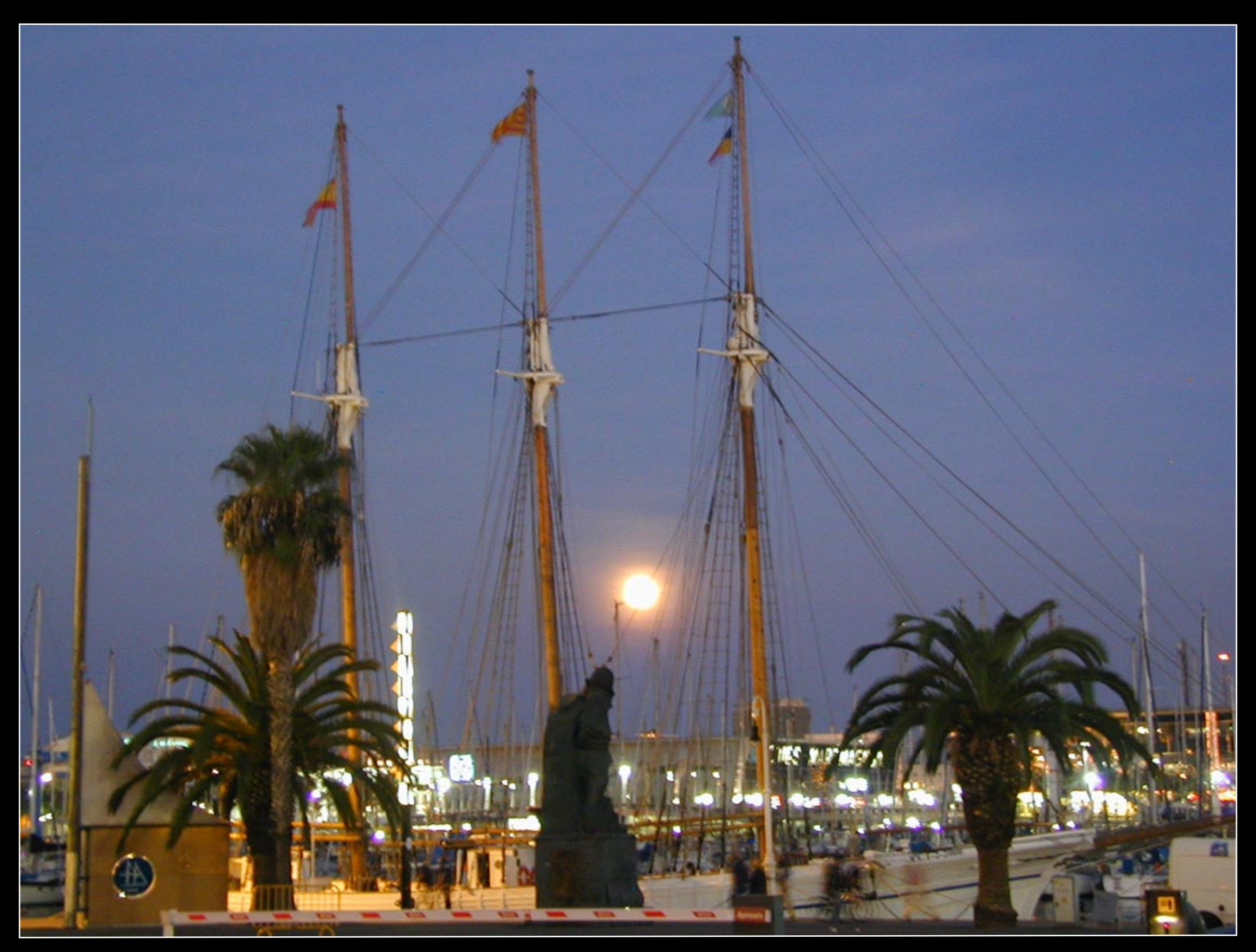
The moon at a Barcelona harbor