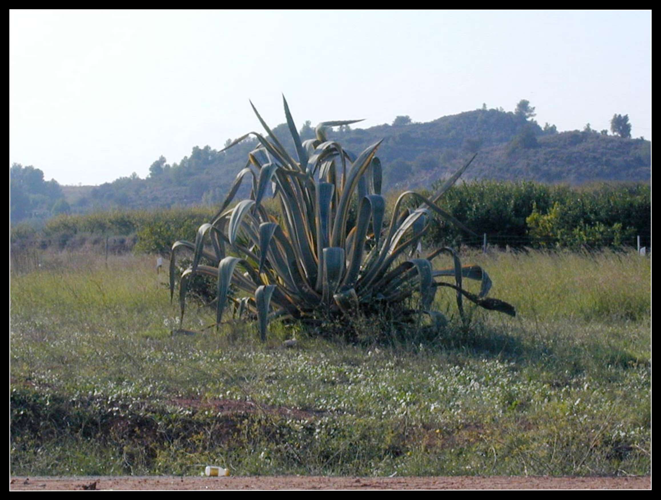
GIANT planty thingy on the road side