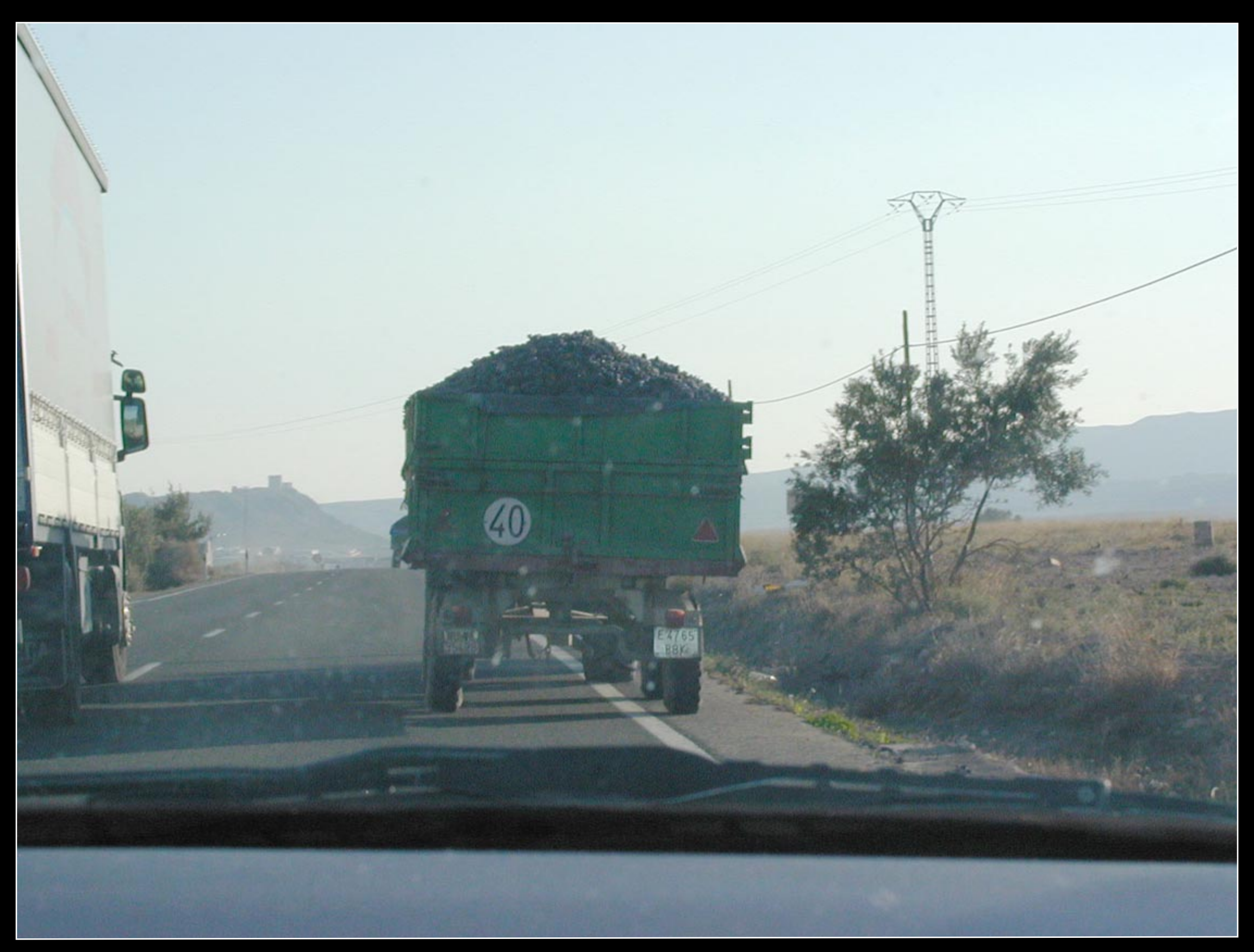
Harvest time! Very slow grape truck. There were lots of these.