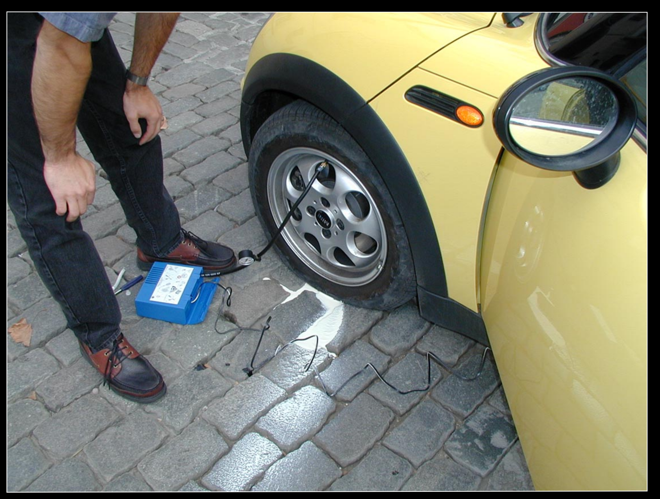
The Mini has no spare; just this useless white goo.