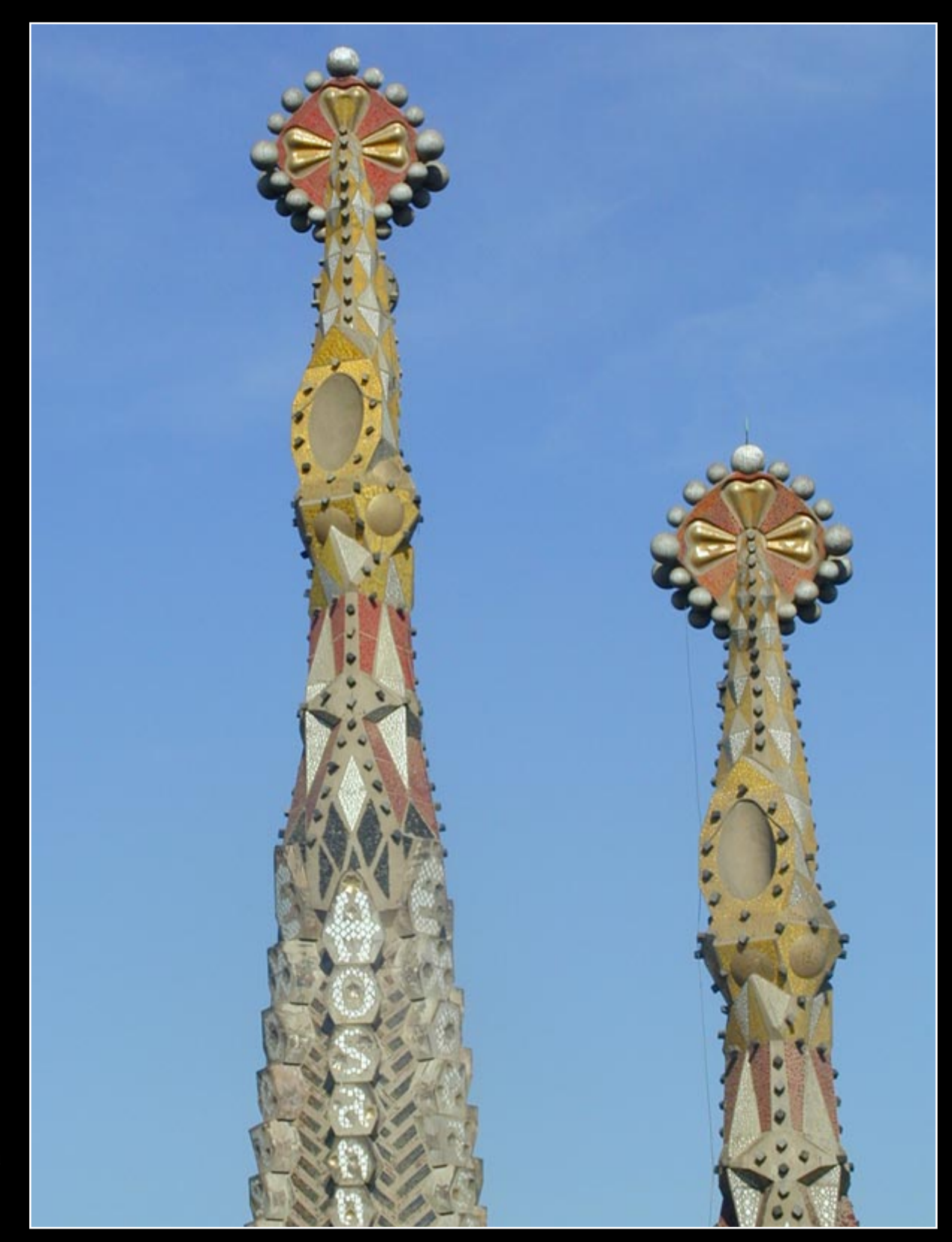
Colorful spires on La Sagrada Familia