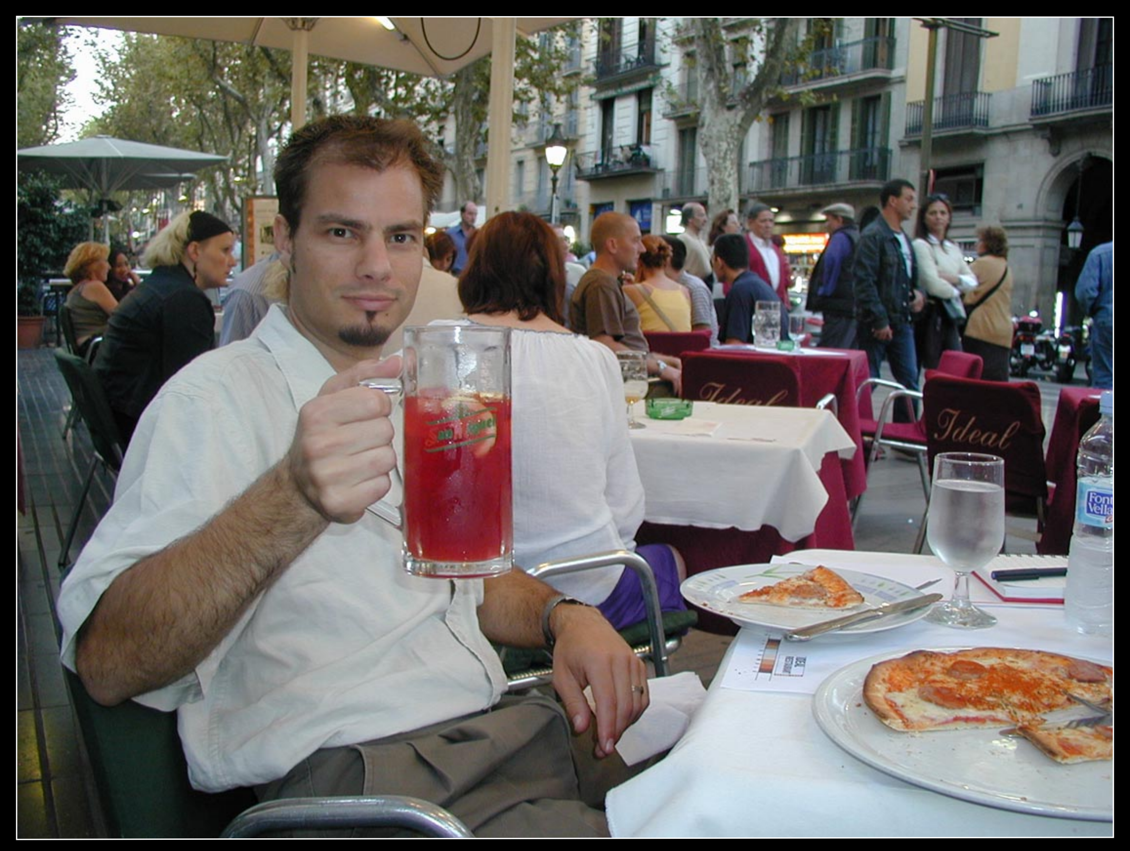
Mmm. Sangria. And awesome paprika covered pizza.