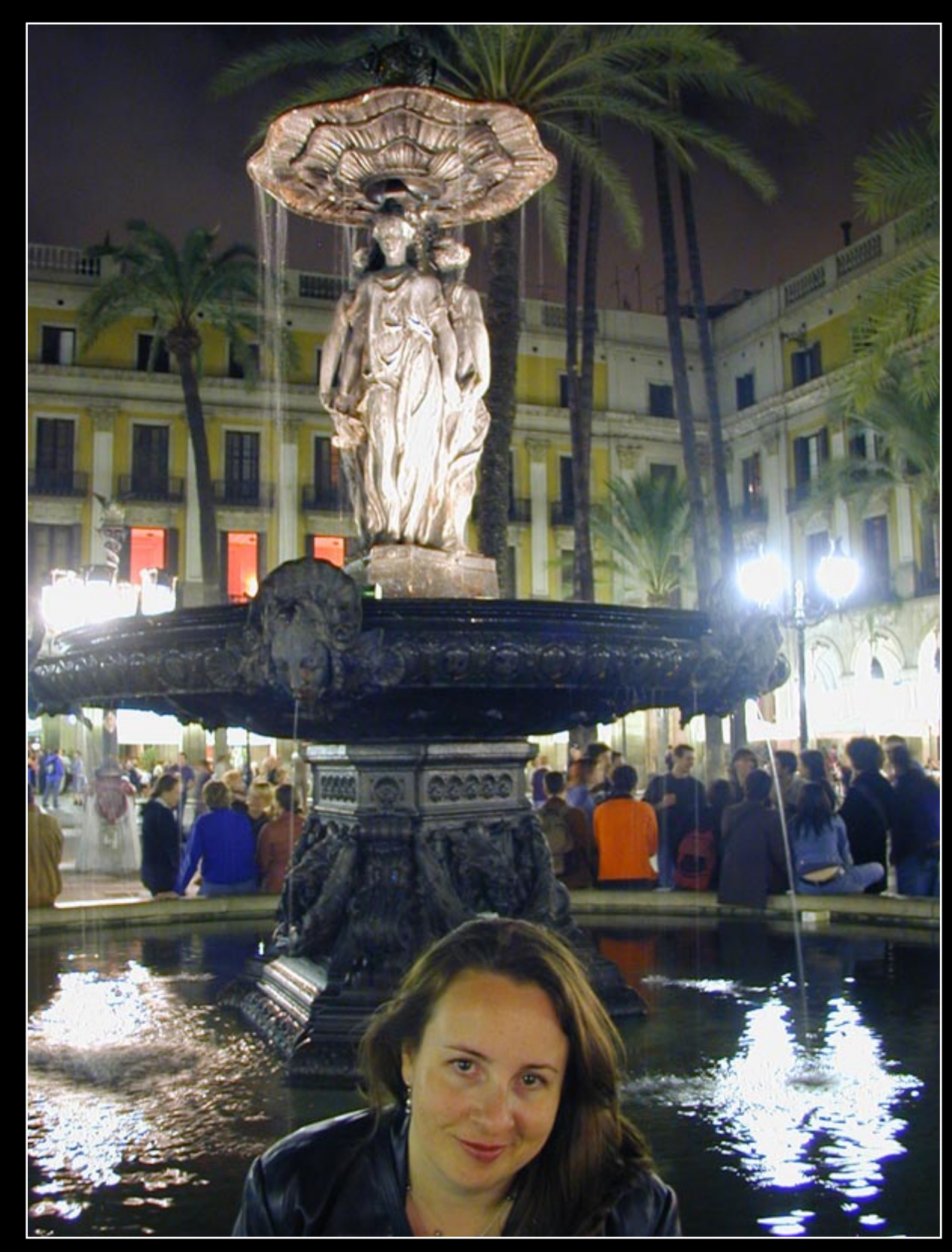
Looking good at Placa Reial