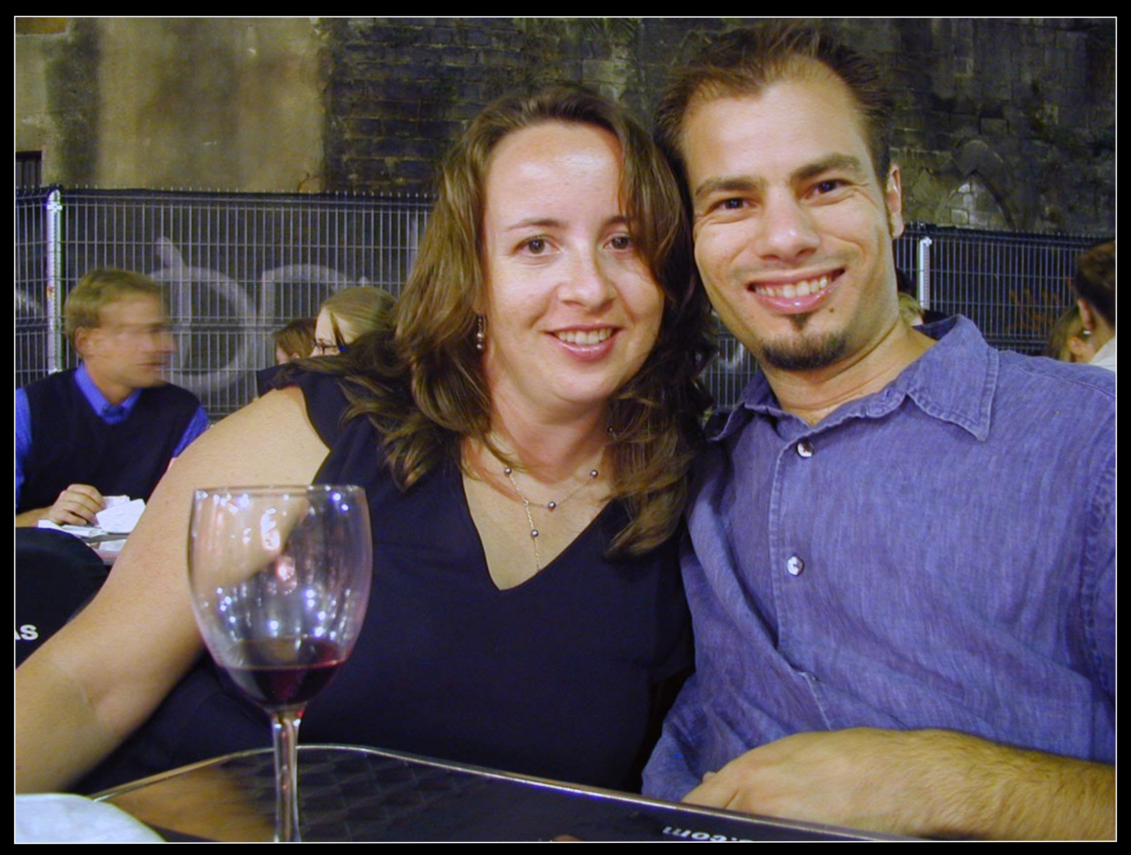
A bottle of Rioja later...