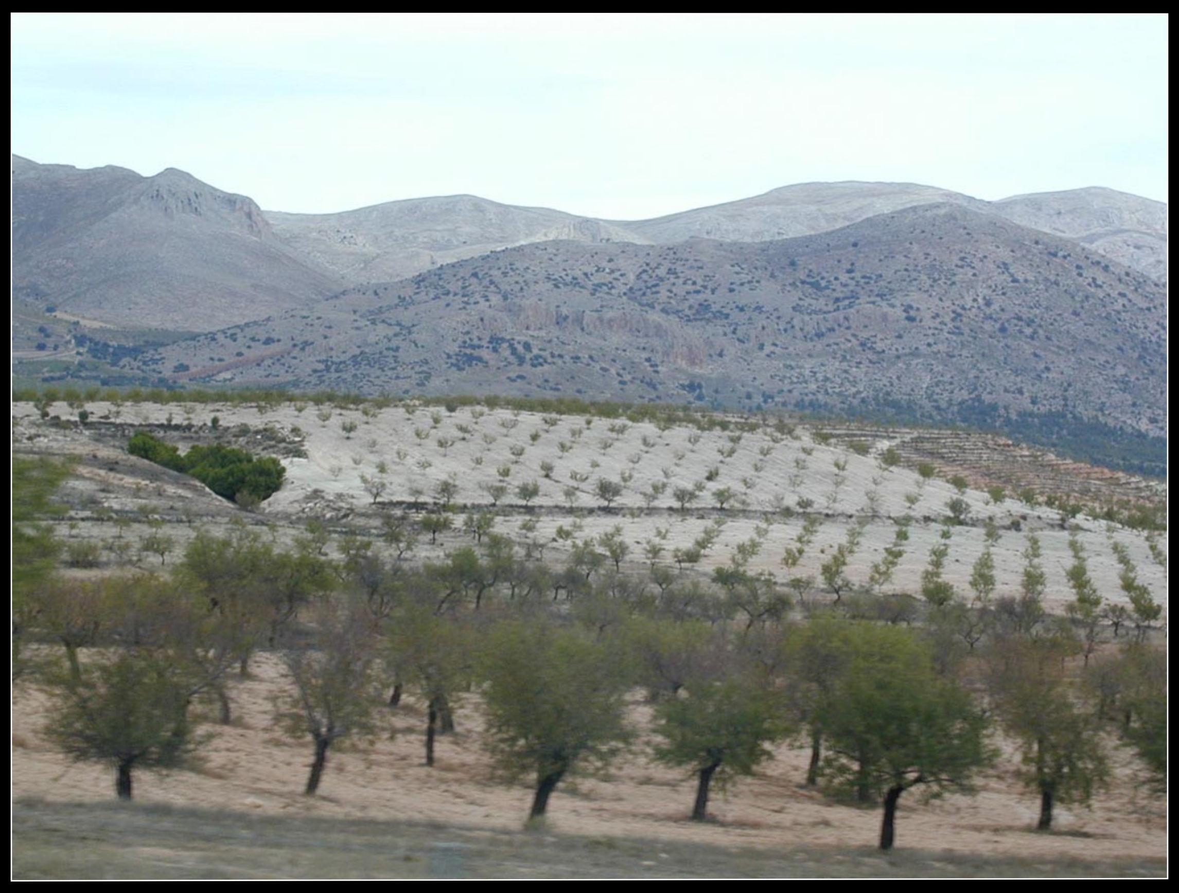
Arid land near the central East coast of Murcia, Spain.