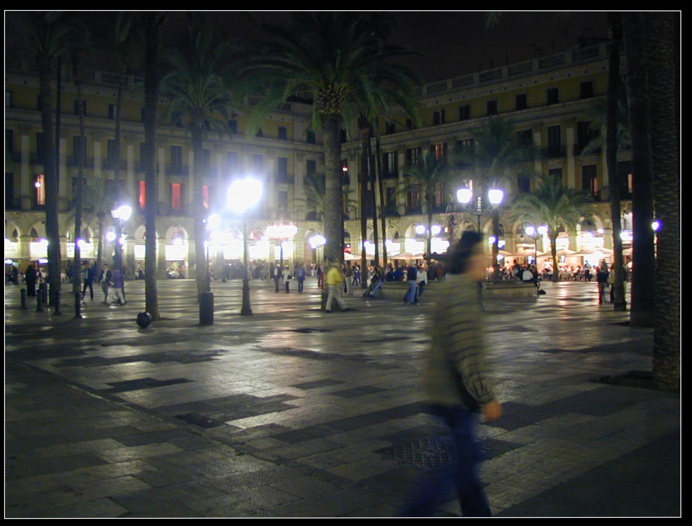
Placa Reial bustling at night