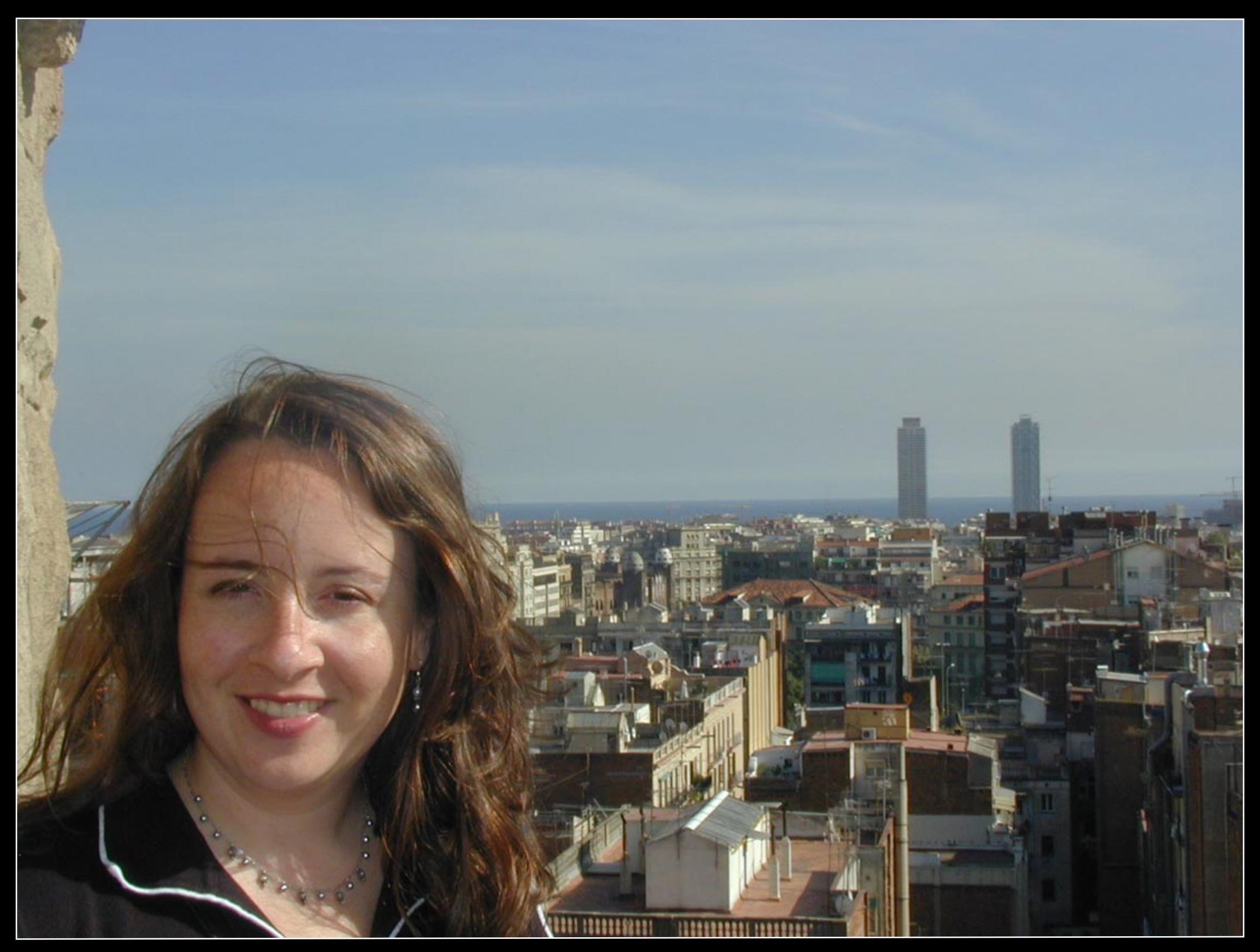
Looking out to the Mediterranean