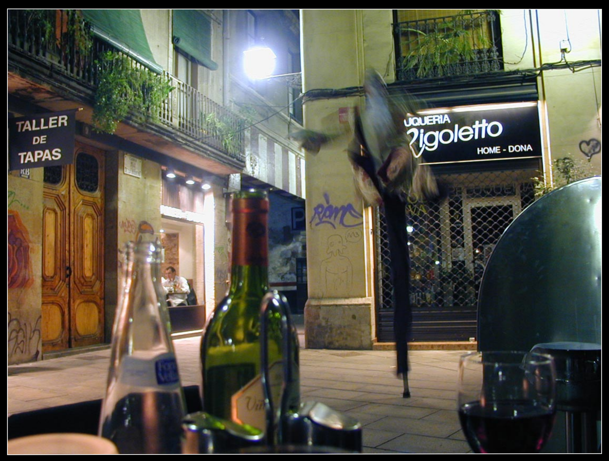
A stilt walker during dinner in Barcelona