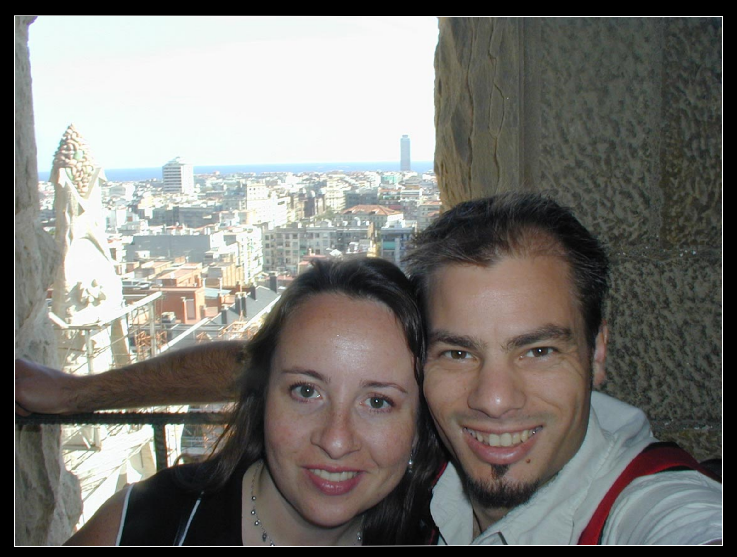
Inside a tower of La Sagrada Familia