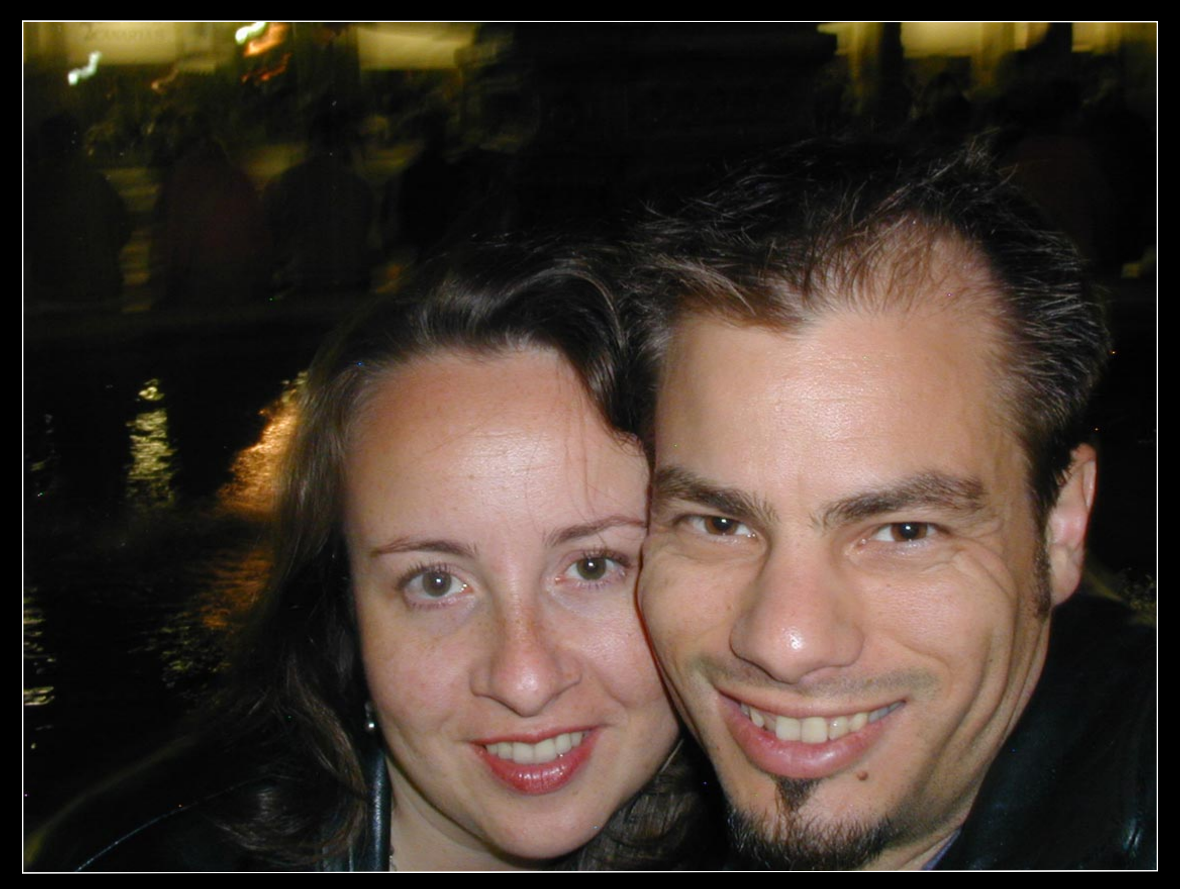
The Rioja has set in