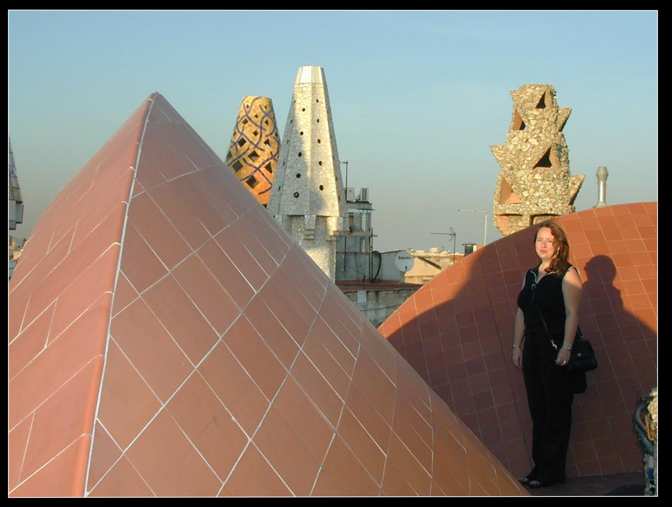
Waiting for a kiss